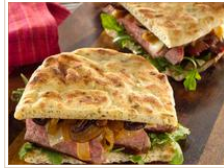
7" PRE-OILED GYRO BREAD 62490 12/10 ct.