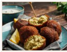
FALAFEL MIX 63378 2/5 lb.