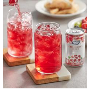
CRANBERRY JUICE - CAN 29260 24/7.2 oz.