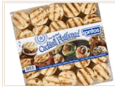
COCKTAIL FLATBREAD SLIDER 72062 1/648 ct.