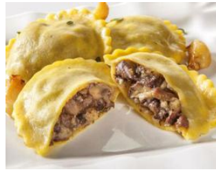
PORTOBELLO MUSHROOM RAVIOLI