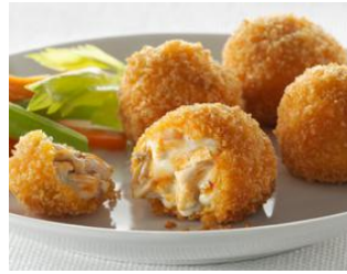
BUFFALO CHICKEN POPPERS

Marinated buffalo chicken blended with mozzarella, caramelized onion and ranch dressing, coated in a crispy panko crumb. 72572 200/.75 oz.