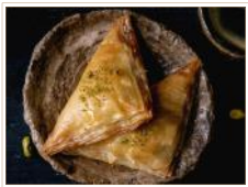
TRIANGLE CUT BAKLAVA 93570 2/48 ct.

These 2-inch, pre-grilled pita disks are soft and flexible, and extremely versatile. Use in the preparation of sliders, ideal for bruschetta, great with dips, and perfect for making hors d'oeuvre and appetizers. Contains No Trans Fat and is Vegan.