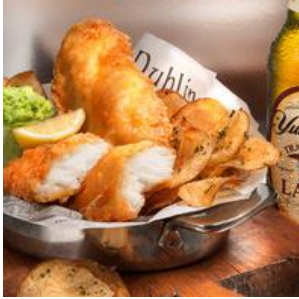
YUENGLING BATTERED HADDOCK FILET 70634 40/4 oz.