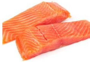
SKINLESS SALMON FILET 70640 20/8 oz.