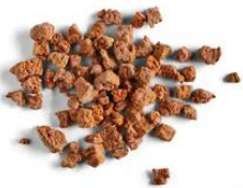
CHORIZO CRUMBLES, COOKED 66770 1/10 lb.

THE ORIGINAL STEAK-EZE® REVOLUTIONARY FAST BREAKAWAY® SIRLOIN BEEF PHILLY STEAK, NON MARINATED 67370 40/4 oz.