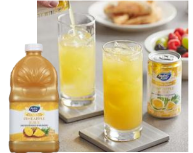
PINEAPPLE JUICE Can: 30110 24/7.2 oz. PET: 29570 8/48 oz.