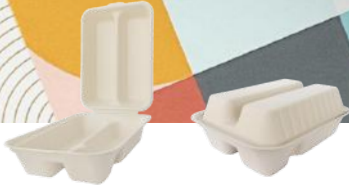
TACO CLAMSHELL 2-COMPARTMENT 50385 4/75 ct.