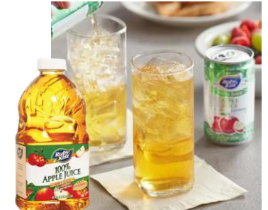
APPLE JUICE Can: 29902 24/7.2 oz. PET: 29120 8/48 oz.