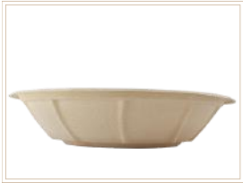
ROUND FIBER BOWL 6.3" 12 oz.: 49825 8/125 ct. 24 oz.: 49836 4/100 ct. 32 oz.: 49840 4/100 ct.