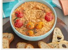
FETA FEISTY DIP A delicious blend of crumbled feta cheese, tomatoes, and green onions. 38654 3/3.75 lb.