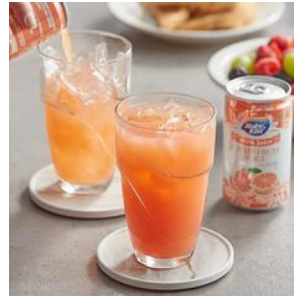
GRAPEFRUIT JUICE - CAN 29894 24/7.2 oz.