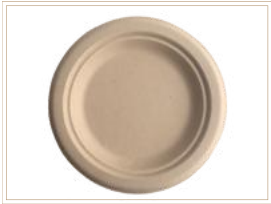
ROUND FIBER PLATE 6": 49801 10/100 ct. 10": 49805 4/125 ct.