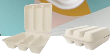
TACO CLAMSHELL 3-COMPARTMENT 50386 4/75 ct.