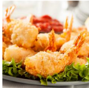
COCONUT BREADED SHRIMP 16/20 71466 4/3 lb. | 1/3 lb.