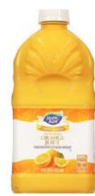
100% ORANGE JUICE PLASTIC BOTTLE 29431 8/48 oz.