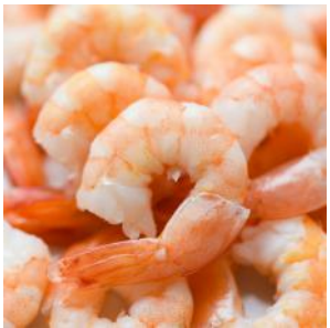
COOKED SHRIMP 16/20 TAIL ON 71462 5/2 lb. | 1/2 lb.