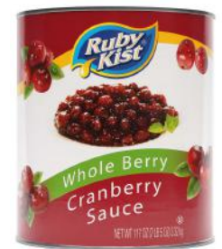
WHOLE BERRY CRANBERRY SAUCE 14314 6/#10