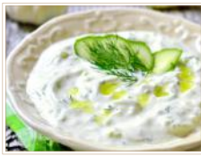
TZATZIKI SAUCE, FRESH 38648 6/32 oz. 38648 1/32 oz.