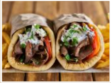
GYRO MEAT, RAW 62901 1/10 lb.