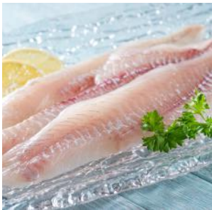
HADDOCK FILET, 8/10 oz., IQF 70662 1/10 lb.