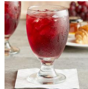
GRAPE JUICE PET 29332 8/48 oz.