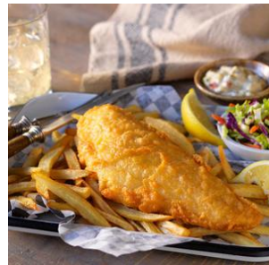
BREWER'S CHOICE HADDOCK 32/10 oz. 70890 1/20 lb.