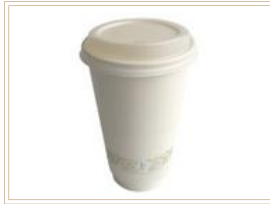
DOUBLE WALL CUP 16 oz.: 50398 25/20 ct. 20 oz.: 50400 25/20 ct.