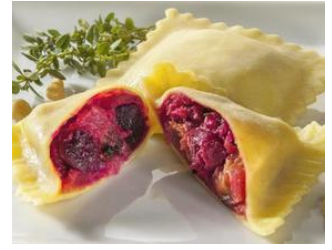
HONEY BRAISED BEET & GOAT CHEESE RAVIOLI