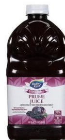
PRUNE JUICE PLASTIC BOTTLE 29600 8/48 oz.