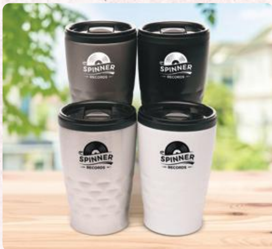
MG0045 ASHFORD GEO 360ML TUMBLER