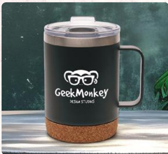
MG0828 VINCI 360ML TRAVEL MUG