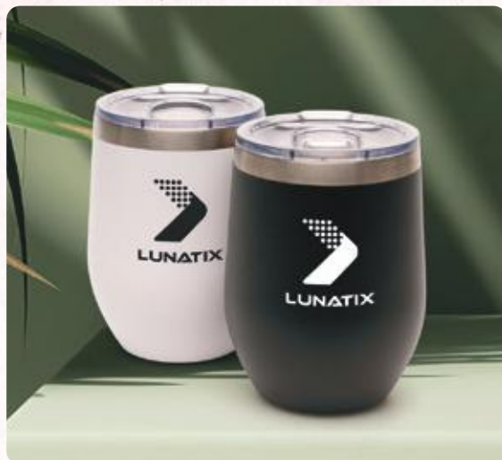
MG0139 POP 360ML TUMBLER