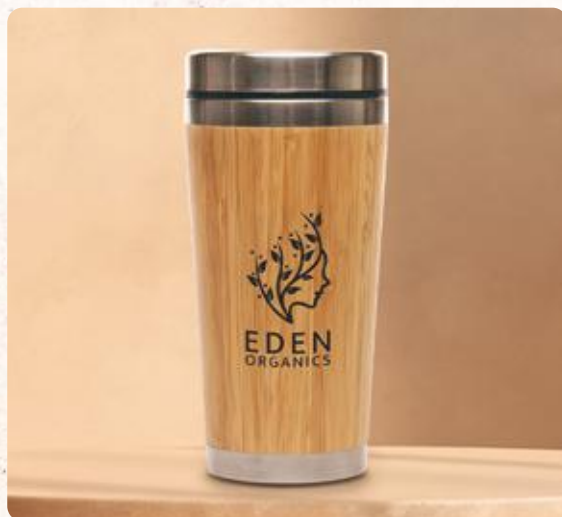
MG1010 BAMBOO 450ML TUMBLER