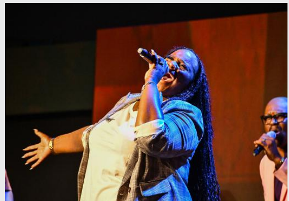
Faith and Blue Church Services