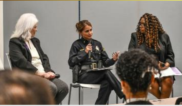
Domestic Abuse Townhall at Genesis Women's Shelter

Our department participated in and facilitated approximately 65 community-focused events, including town hall meetings, neighborhood outreaches, and initiatives like National Night Out.