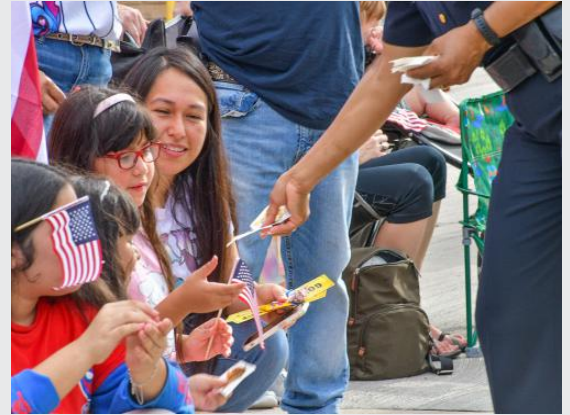
Labor Day Parade 2024