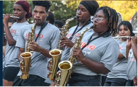
National Night Out 2024

We are committed to building strong partnerships that inspire and uplift our community. By working together, we can create a more promising future for those we serve. To join our efforts, please contact us at community@dallascounty.org