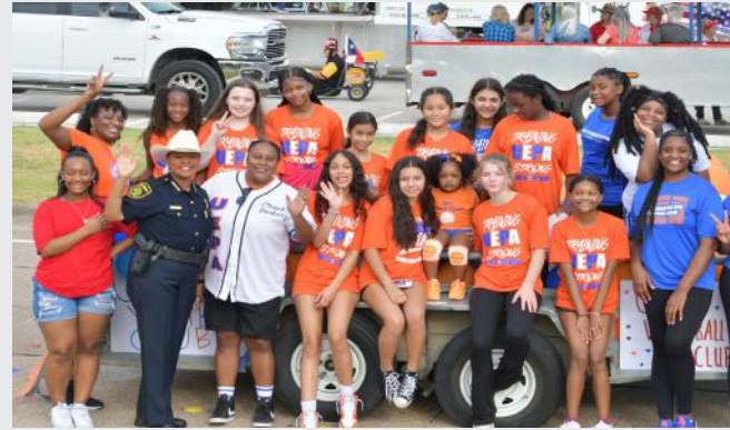
Labor Day parade 2024

During Halloween, staff engaged with the community by hosting Trunk or Treat events for local children. The Sheriff's Office provided gifts to three mobile home park communities during Christmas, bringing joy to hundreds of families. Through our Blue Santa events, over 500 families were served.