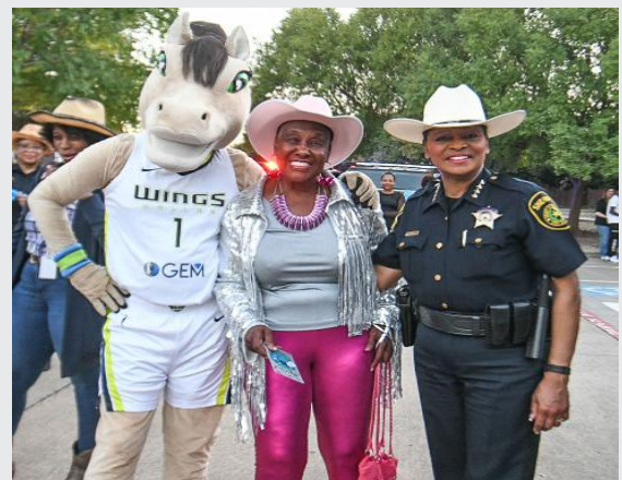
National Night Out - 2024