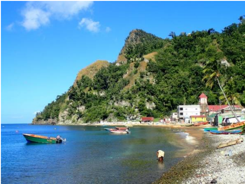
Dominica is so scenic