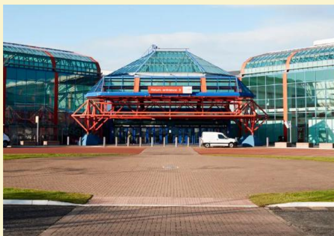
The NEC hired him too