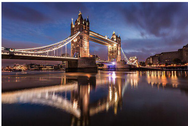
Tower Bridge is another on his CV

After school he studied to become an electrician for two years, gaining top marks before being accepted for a five-year apprenticeship, gaining invaluable experience in schools, offices, factories, and shops.