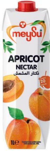
1 LITER APRICOT NECTAR