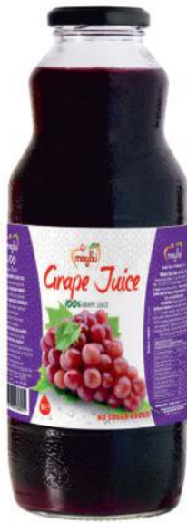
1 LITER 100% GRAPE JUICE