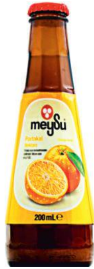
200 ML ORANGE NECTAR