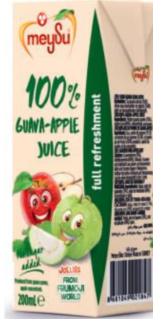
200 ML 100% GUAVA- APPLE JUICE