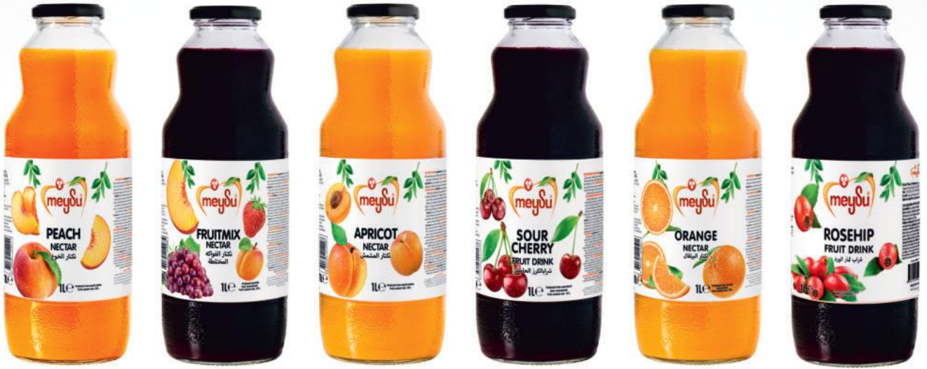
1 LITER PEACH NECTAR