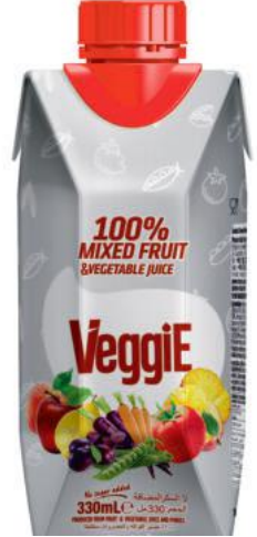
330 ML 100% FRUITMIX FRUIT JUICE