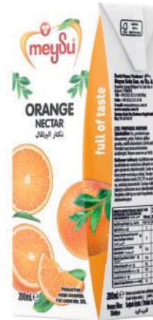
200 ML ORANGE NECTAR