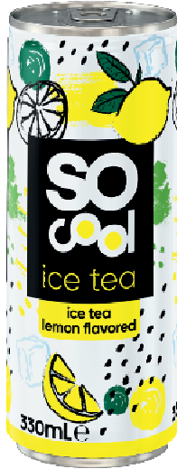
330 ML ICE TEA LEMON FLAVORED