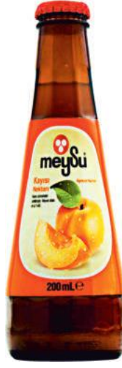
200 ML APRICOT NECTAR