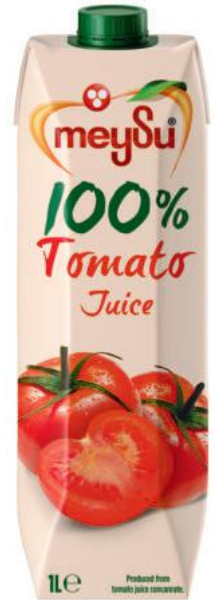
1 LITER 100% TOMATO JUICE