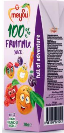
200 ML 100% FRUITMIX JUICE