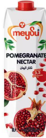
1 LITER POMEGRANATE NECTAR