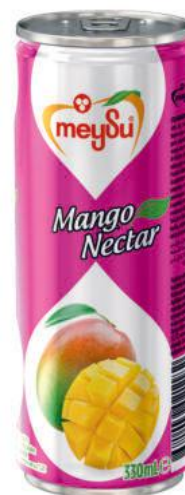
330 ML MANGO NECTAR