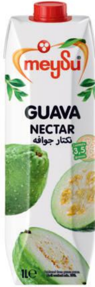
1 LITER GUAVA NECTAR