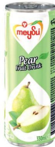
330 ML PEAR FRUIT DRINK