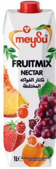
1 LITER FRUITMIX NECTAR