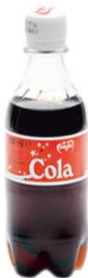
250 ML COLA