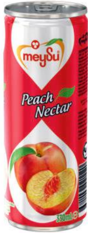
330 ML PEACH NECTAR