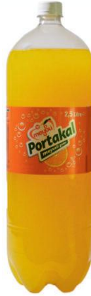
2,5 LITER ORANGE FIZZY DRINK