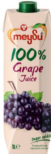
1 LITER 100% GRAPE JUICE