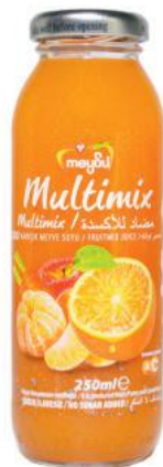
250 ML MULTIMIX 100% FRUITMIX FRUIT JUICE