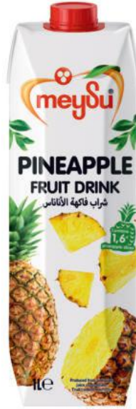
1 LITER PINEAPPLE FRUIT DRINK