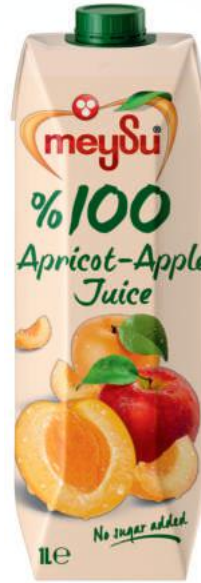
1 LITER 100% APRICOT-APPLE JUICE