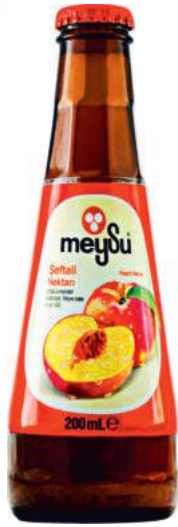
200 ML PEACH NECTAR