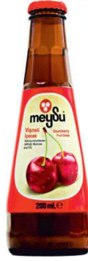
200 ML SOURCHERRY FRUIT DRINK