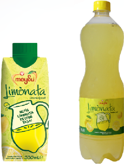
330 ML LEMONADE DRINK