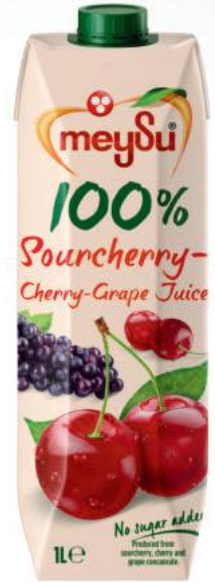
1 LITER 100% SOURCHERRY-CHERRY-GRAPE JUICE