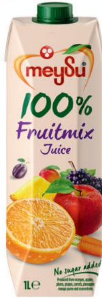
1 LITER 100% FRUITMIX JUICE