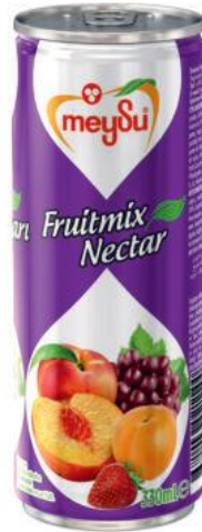
330 ML FRUITMIX NECTAR