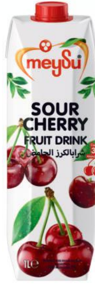
1 LITER SOURCHERRY FRUIT DRINK