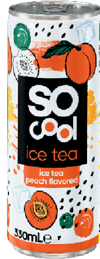
330 ML ICE TEA PEACH FLAVORED