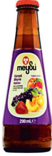
200 ML FRUITMIX NECTAR