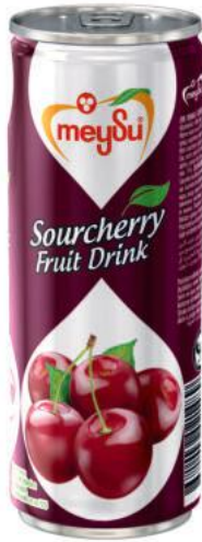
330 ML SOURCHERRY FRUIT DRINK