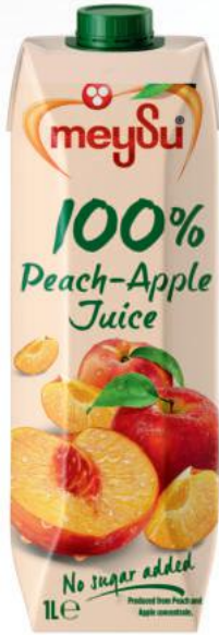
1 LITER 100% PEACH-APPLE JUICE