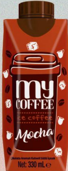
330 ML MY COFFEE (MOCHA)