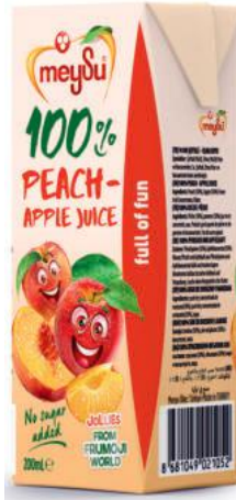
200 ML 100% PEACH-APPLE JUICE