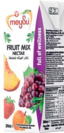
200 ML FRUITMIX NECTAR