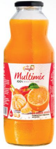
1 LITER MULTIMIX 100% FRUITMIX FRUIT JUICE