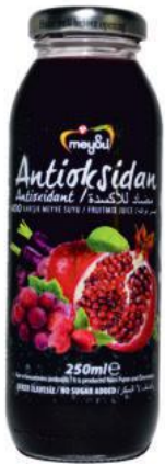
250 ML ANTIOXIDANT 100% FRUITMIX FRUIT JUICE