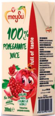
200 ML 100% POMEGRANATE JUICE