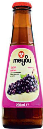
200 ML GRAPE NECTAR