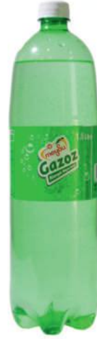
1,5 LITER MIXED FRUIT FLAVORED FIZZY DRINK