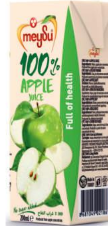
200 ML 100% APPLE JUICE