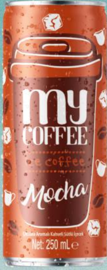
250 ML MY COFFEE (MOCHA)