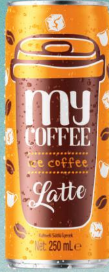
250 ML MY COFFEE (LATTE)