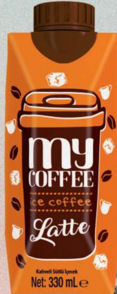
330 ML MY COFFEE (LATTE)