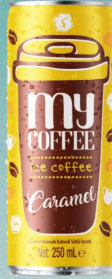
250 ML MY COFFEE (CARAMEL)