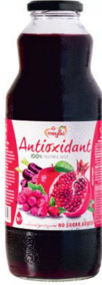
1 LITER ANTIOXIDANT 100% FRUITMIX FRUIT JUICE