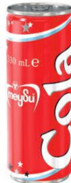
330 ML COLA