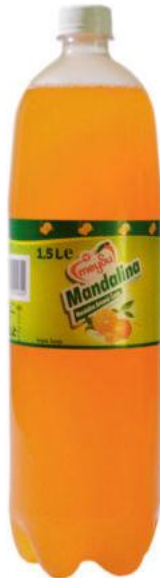
1,5 LITER MANDARIN FLAVORED FIZZY DRINK