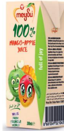
200 ML 100% MANGO- APPLE JUICE