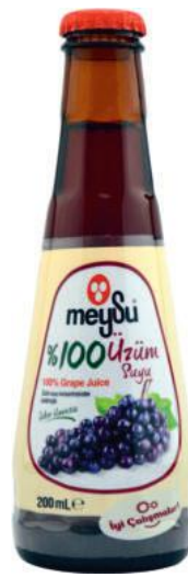
200 ML 100% GRAPE JUICE