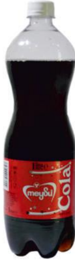
1 LITER COLA