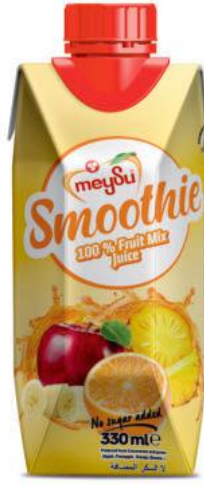
330 ML 100% FRUITMIX FRUIT JUICE