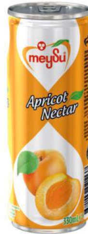
330 ML APRICOT NECTAR