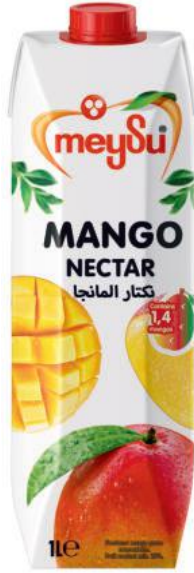
1 LITER MANGO NECTAR