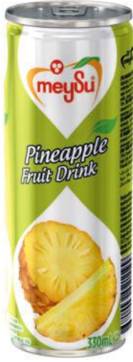
330 ML PINEAPPLE FRUIT DRINK