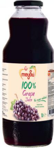
1 LITER 100% GRAPE JUICE