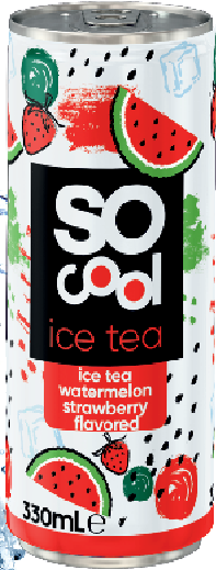
330 ML ICE TEA WATERMELON STRAWBERRY FLAVORED