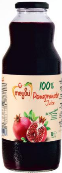
1 LITER 100% POMEGRANATE JUICE