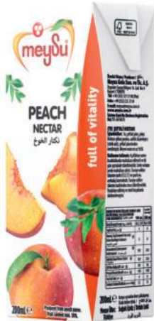
200 ML PEACH NECTAR