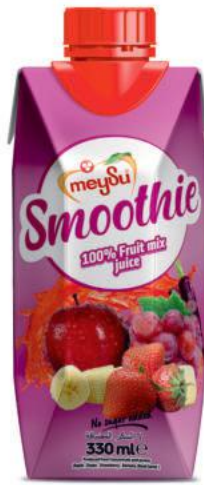
330 ML 100% FRUITMIX FRUIT JUICE