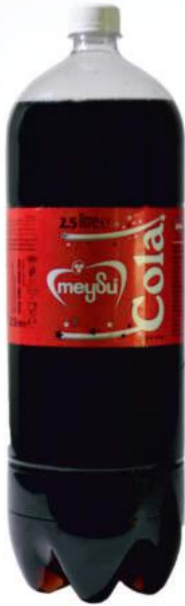
2,5 LITER COLA