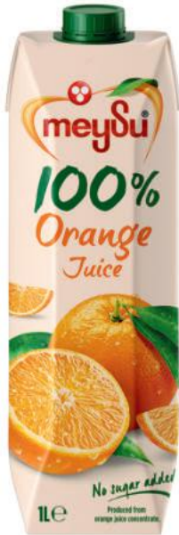
1 LITER 100% ORANGE JUICE