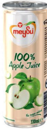
330 ML %100 APPLE JUICE