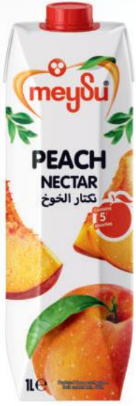
1 LITER PEACH NECTAR