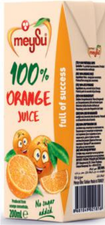
200 ML 100% ORANGE JUICE