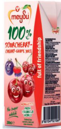
200 ML 100% SOURCHERRY- CHERRY-GRAPE JUICE