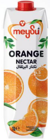
1 LITER ORANGE NECTAR