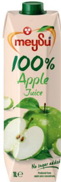
1 LITER 100% APPLE JUICE