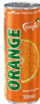
330 ML ORANGE FIZZY DRINK