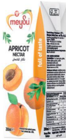
200 ML APRICOT NECTAR