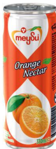
330 ML ORANGE NECTAR