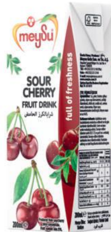
200 ML SOURCHERRY FRUIT DRINK