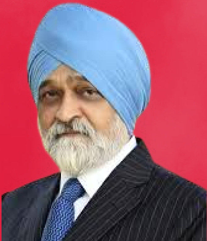
Dr Montek Singh Ahluwalia*