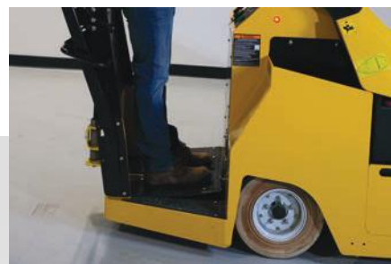
350 LB Capacity Operator Compartment