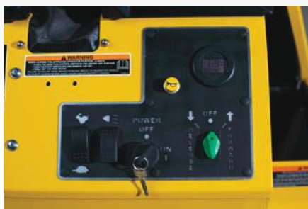
Control Panel with Battery Meter, Horn, Hi-Low Speed Switch