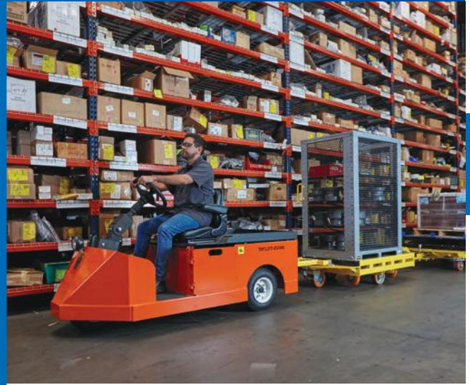
70 Years of Industrial Reliability