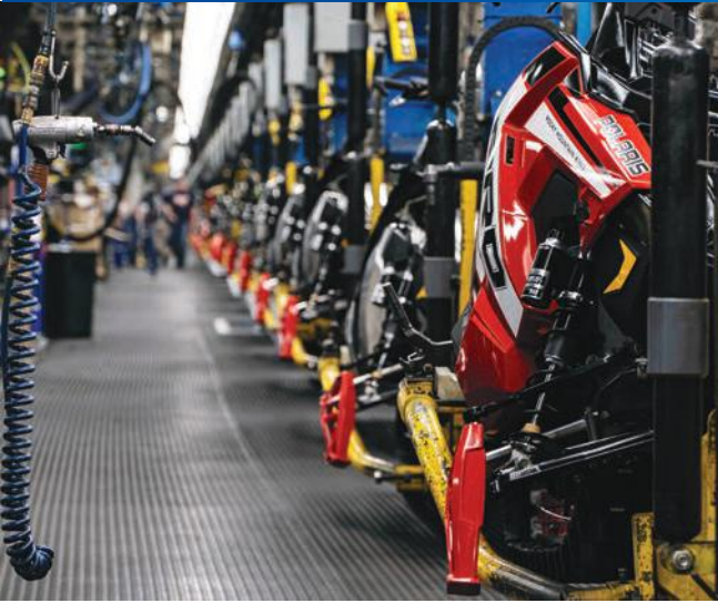
65 Years of Vehicle Innovation