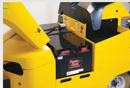
Easy Access Battery Compartment