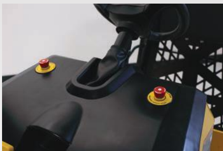
Two Sided Emergency Shut Off Buttons