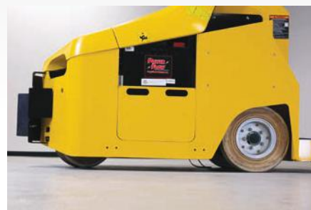
Front Dual Coil Suspension and Rear Coil Suspension with Shock Absorbers