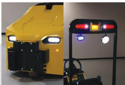
Safety Headlights and Large Front Push Bumper