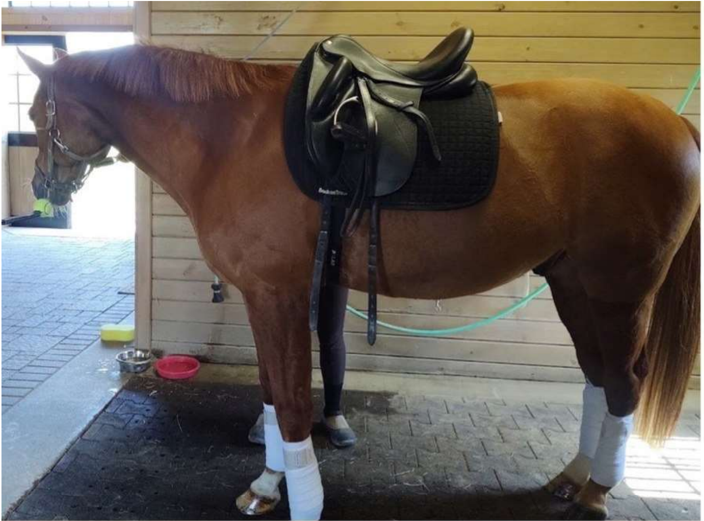
Figure 2. Horse wearing an equine heart rate monitor under tack.

Measuring the horse's pulse by hand is not an accurate way to determine the horse's heart rate during exercise. By the time a horse comes to a stop and the rider dismounts to check the pulse, the horse's heart rate has already drastically decreased. Using an equine heart rate monitor can track the horse's heart rate over the entire exercise session and provide an opportunity to calculate the average heart rate. The NRC table provides some general heart rate averages that may be found for each exercise level. The use of an equine heart rate monitor in addition to identifying the frequency and duration of exercise may help to properly estimate a horse's workload.