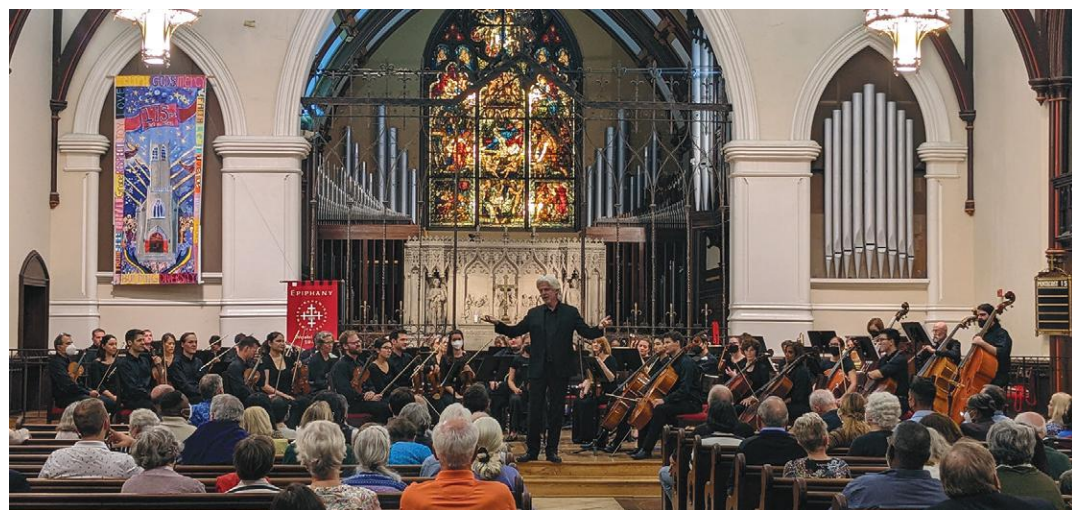
Avanti Orchestra, photo by Jennie Weyman.