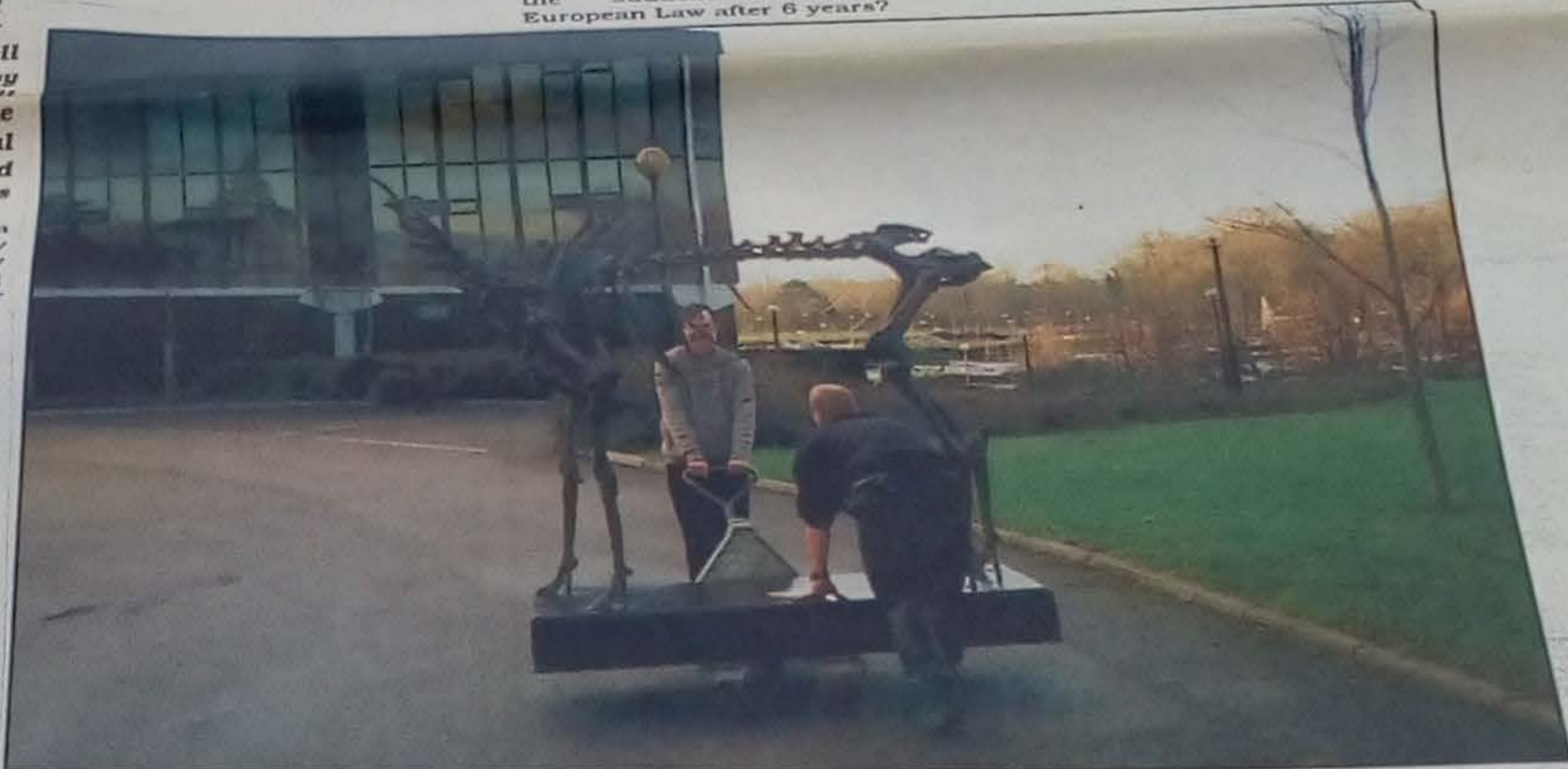
Skeleton removed from White House - Images of 25 Cromwell St. !

So what is the SU doing about it? Given the obvious intransigence on the Society's part it would seem that the only avenue open is the legal one. To this end we have received a verbal commitment from the university that they would fund any challenge and it is now a matter of co-ordinating with the other unions around the country. If anyone has any queries call into the union and we will try to answer any concerns.