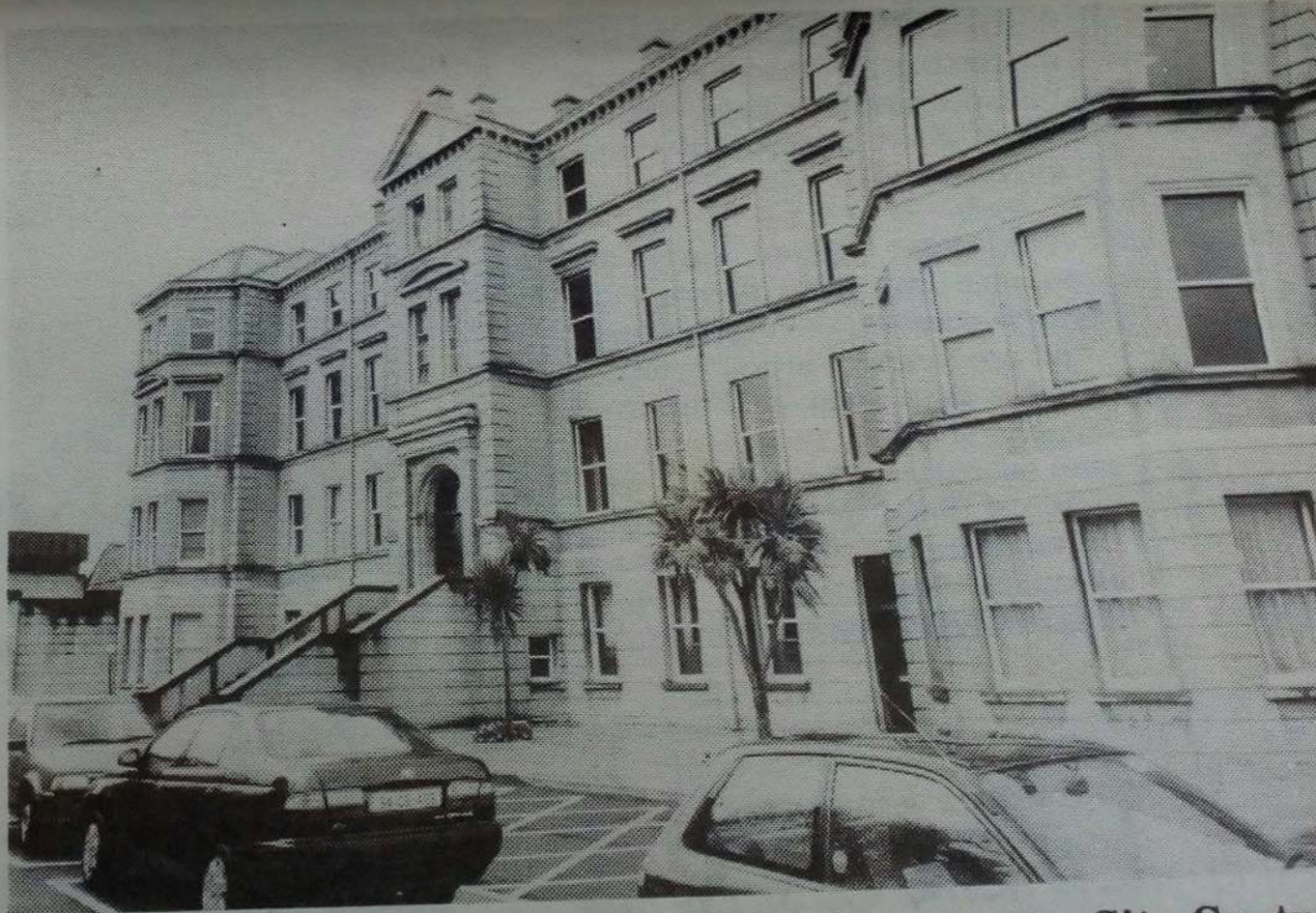
Students Queuing for the Sho

As you may have read in a related article in this paper at the time of print no law student weather current or future will be exempt from the first set of exams in Blackhall place in order to become a solicitor. Present Law students were told that they would automatically proceed to the second part of exams in Blackhall Place if they got a Law degree in U.L. At the moment the situation now is that students will first have to sit an exam to decide wether or not they can become solicitors. There is approx. a 50% passing rate for this exam and it is widely thought that this will be used to cut down on the large number of Solicitors qualifying each year.