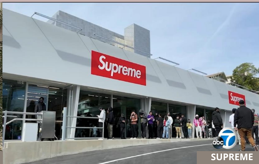
abc 7 SUPREME