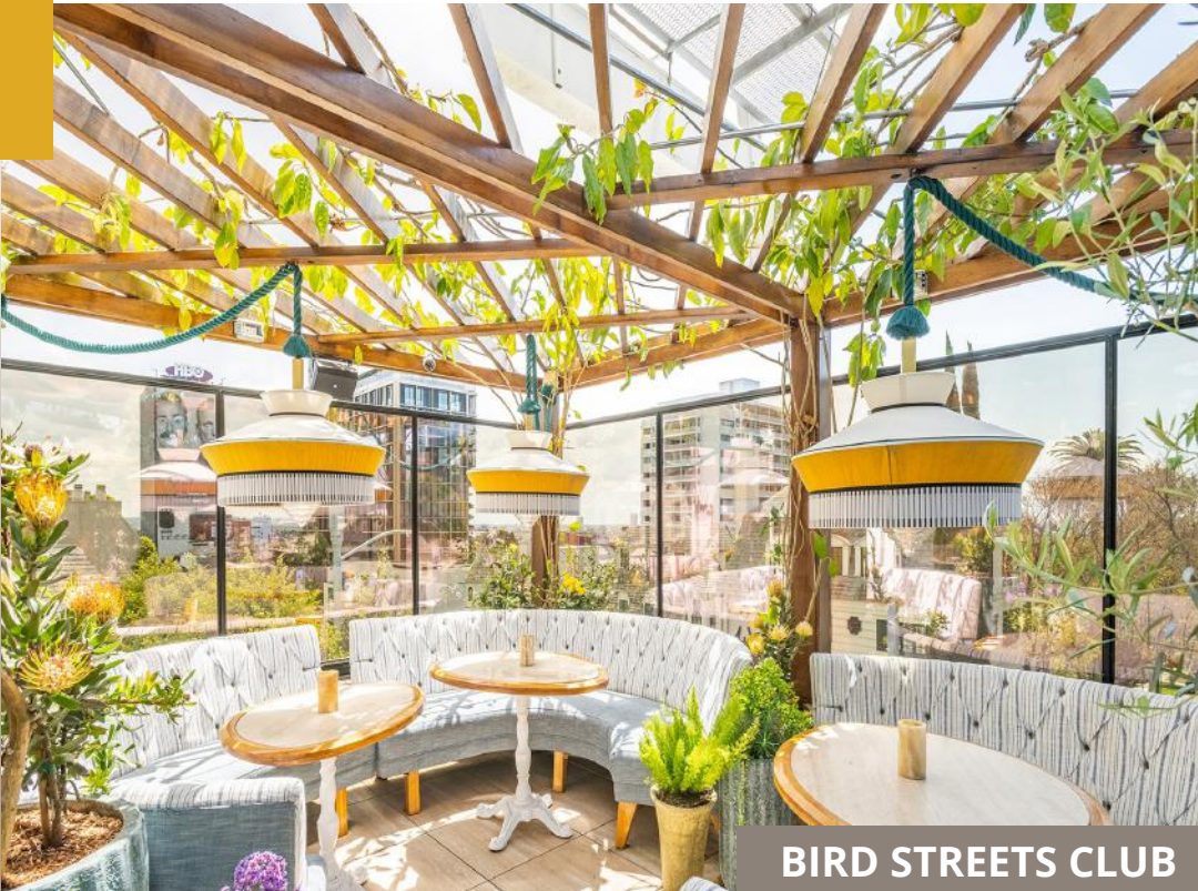
BIRD STREETS CLUB