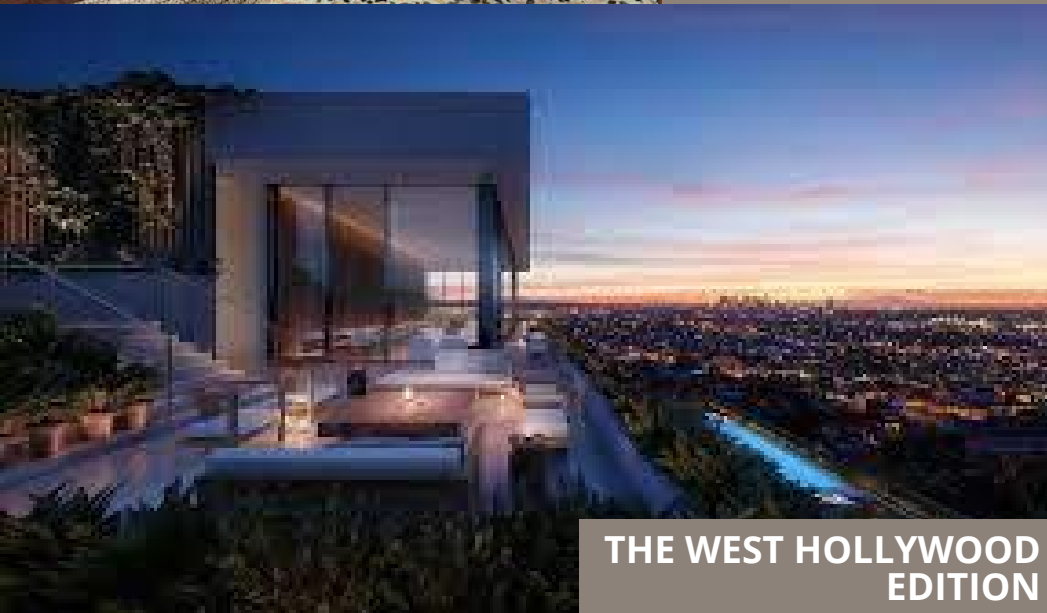
THE WEST HOLLYWOOD EDITION