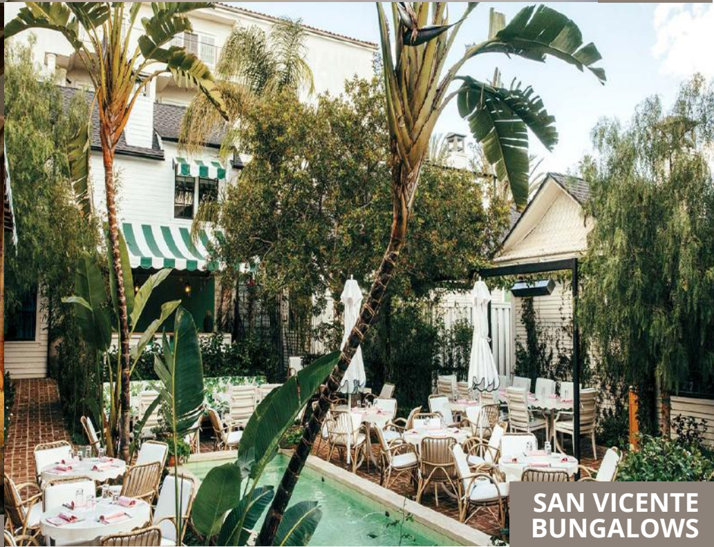
SAN VICENTE BUNGALOWS