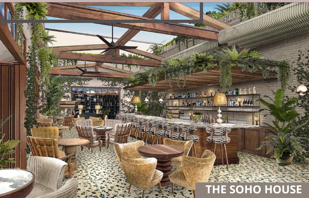
THE SOHO HOUSE