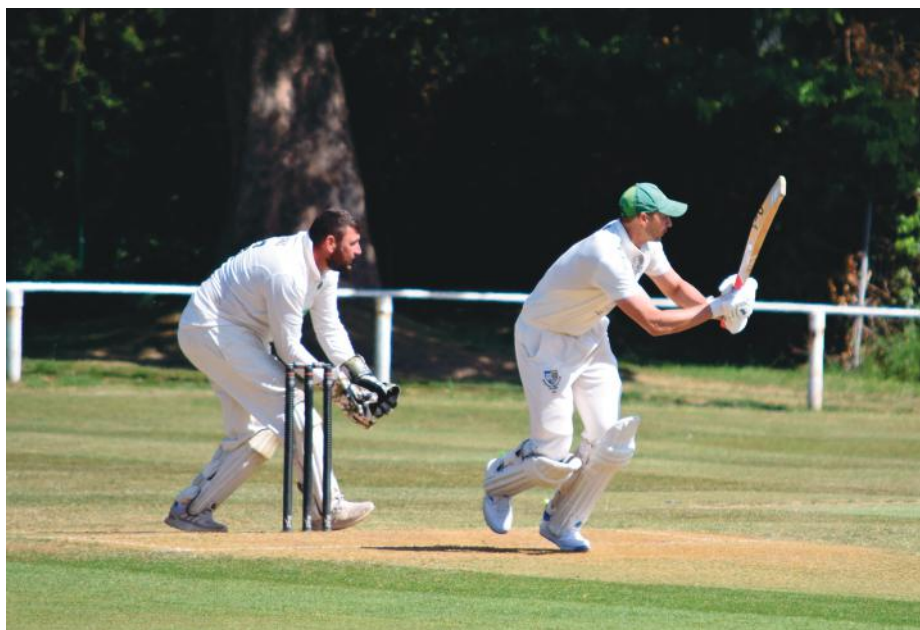
Ackworth v Aston Hall

Warmsworth 2nds took advantage of Ackworth not being in action to return to the top of Division 5 by beating Whiston Parish Church 2nds by four