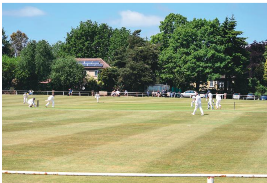
A fabulous day for cricket - Ackworth v Aston Hall