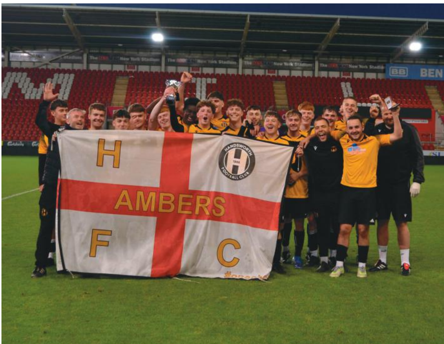
Above Left: Handsworth FC Amber - cup winners and above right match action.