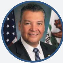
Alex Padilla (D) 2021-2027

Each state has two U.S. senators. California Senate Representatives, as of 2026: