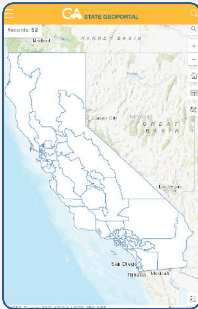
From the California State Geoportal (February 2026)

Both the House and the Senate hold hearings that guide the law-making process , provide oversight of the executive branch with their investigative powers, and have the power to declare war and are in control of the federal government budget , which includes taxation .