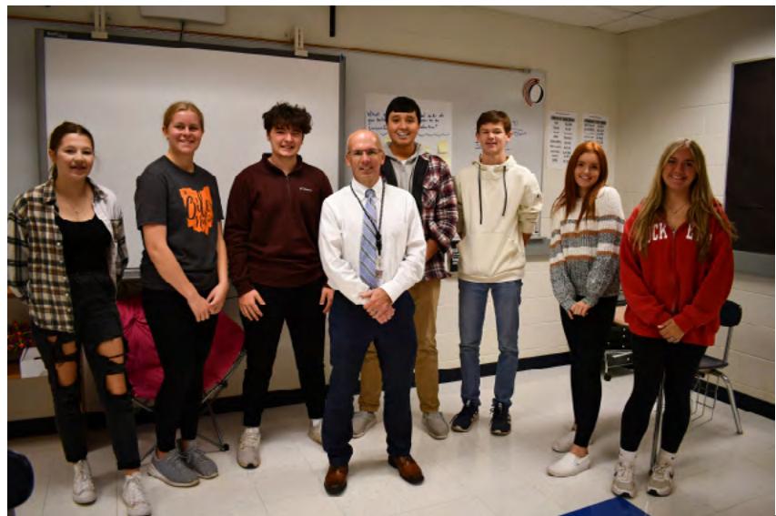
I am grateful to have the opportunity to receive feedback from the Student Advisory Committee. These young people are helping to shape the future of AWLS by sharing their experiences.

As I reflect on the first three months of school and the last 13 years of serving as