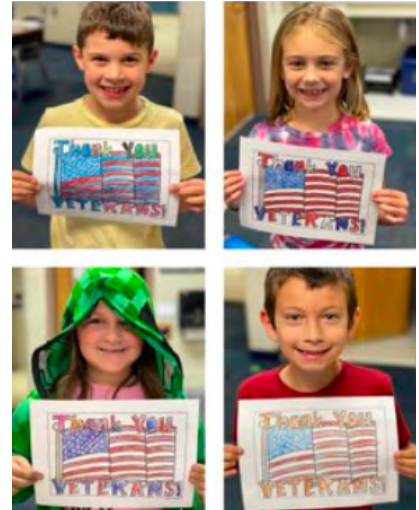
Last year, students made thank you cards for local veterans.

Students have written thank you letters, completed service projects and participated in classroom lessons and other school-wide activities to learn