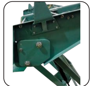
High quality rust proof painting and electroplating. All stainless steel screws and washers for high efficiency