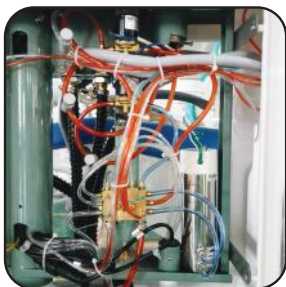
High quality tubing resists acid-base, SMC tubing resists high temperature