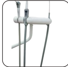
High quality and durable suction tubing