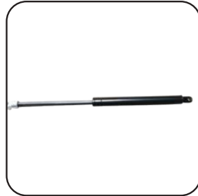
Oilless gas spring for balancing chair moving. Low noise & durable