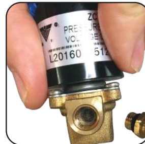
Solenoid valve with built-in filter, stops micro chippings, avoid water drops in cup filling and spittoon rinsing