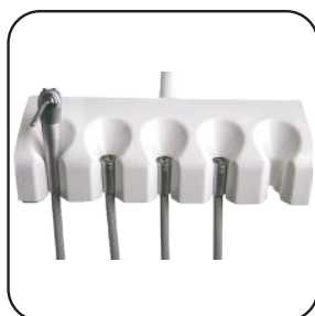
High quality and durable HP tubing sleeves