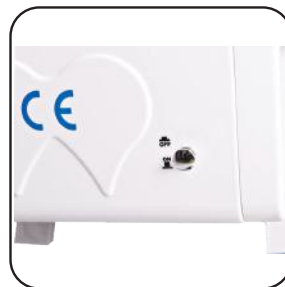
Pull-push water exchange valve for city water and fresh water