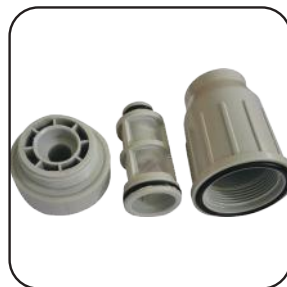
Bigger water filter ensures water flow capacity, good quality filter stops micro chippings, easy for maintenance