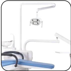
Separate light arm and instrument arm