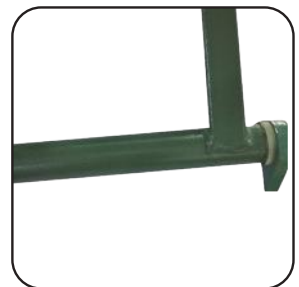
Nylon washer & oiled bearing in movement joint for low noise & durability