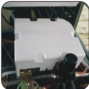
Power protection cover for safety