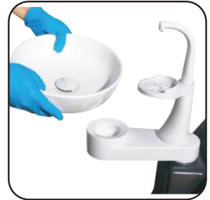
Easy to clean removable ceramic spittoon