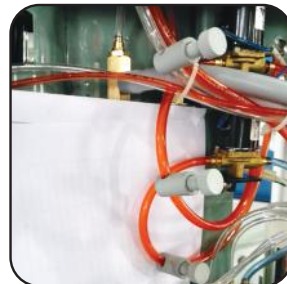
3* regulators for controlling the water flow of cup filling. Spittoon rinsing and air flow of air suction