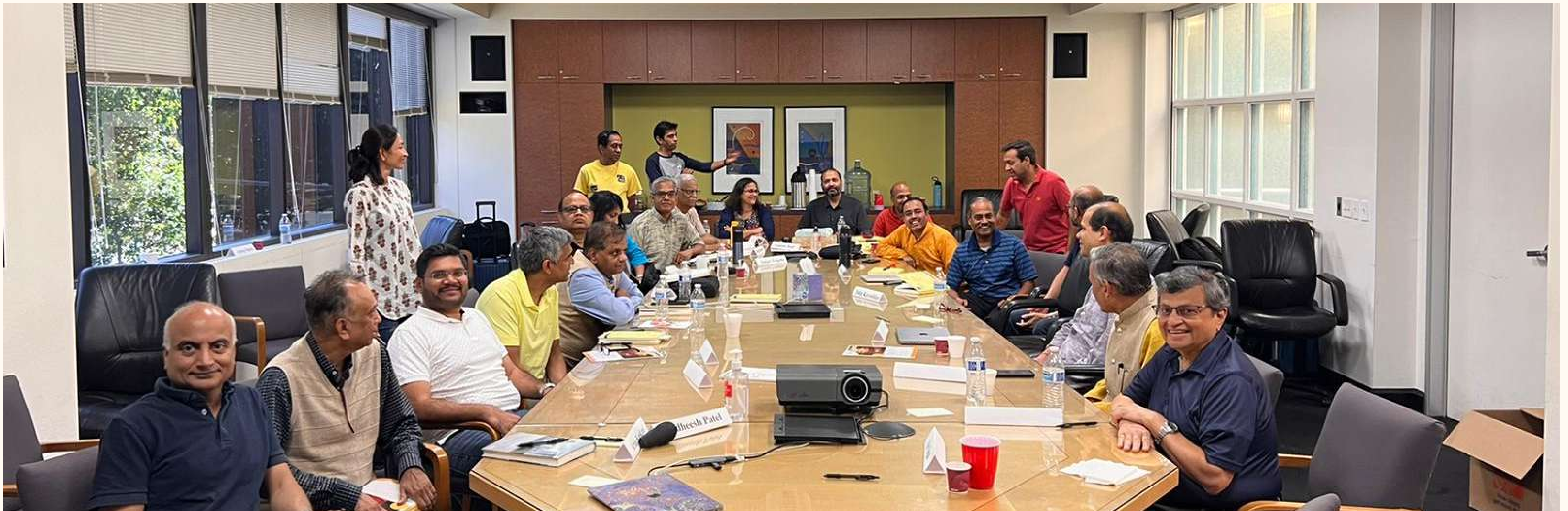
Participants at the Sewa Strategy Meeting in San Francisco Bay Area

Sewa organized a strategy meeting at the Sewa Community Center in Milpitas in the San Francisco Bay Area in October 2022. Over 35 people, including Sewa directors, advisors, and executive leaders, participated in the meeting. Sewa had its last strategy meeting in 2017. The plan agreed upon in 2017 had prepared the organization for the growth it experienced the past five years, including the impeccable service it rendered in the US and India during the pandemic.