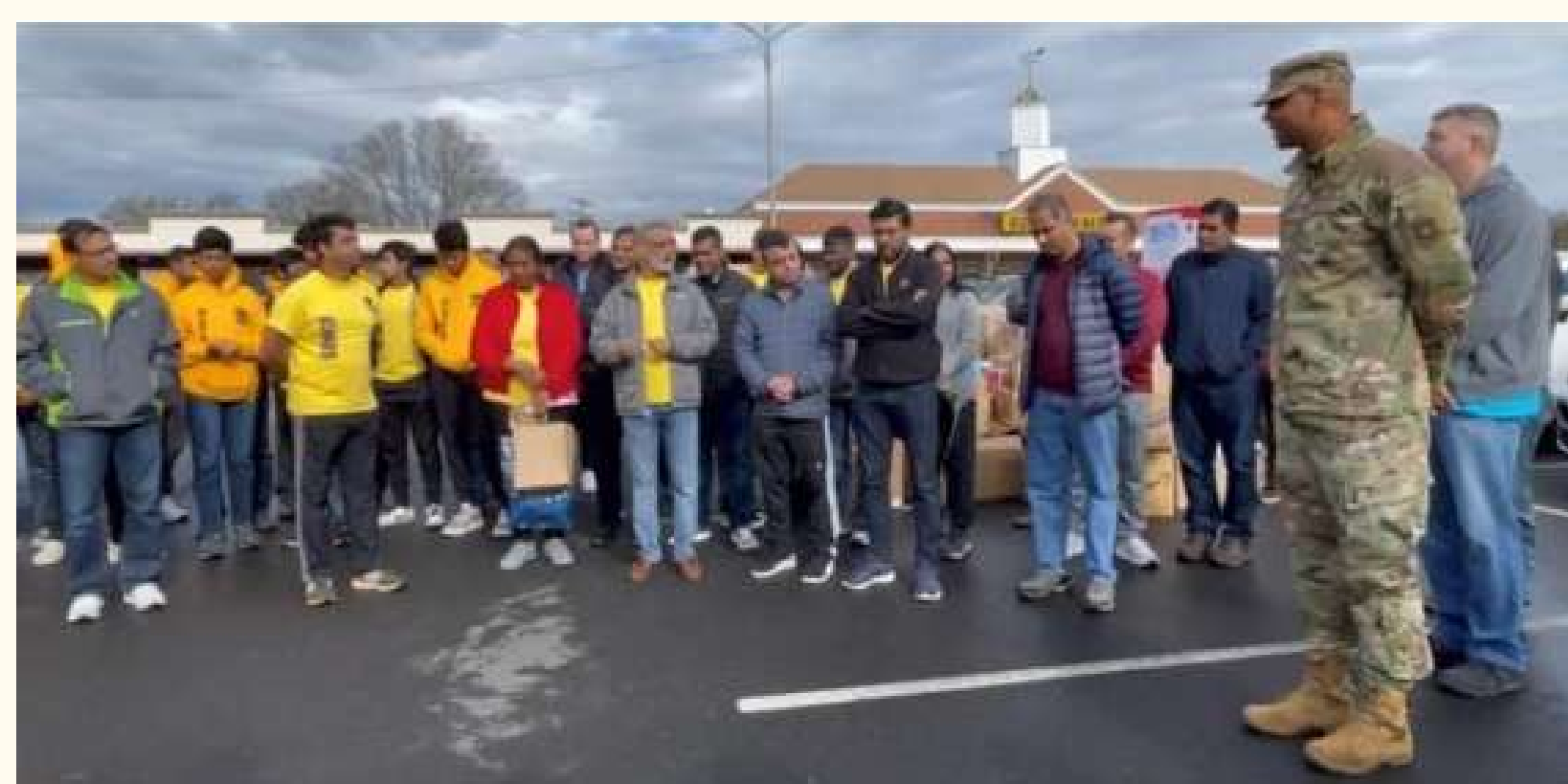
Sewa volunteers meet with Joint Base McGuire Dix Lakehurst (JBMDL) officers to handover collected treats to soldiers

Letters received from soldiers, sailors, marines, and airmen prove that these packages from home boost their morale. Sewa International and its nationwide network of committed volunteers and donors have given graciously over the years to this program. The Central Jersey Chapter has been organizing and conducting the donation drive since 2019, and each year since, the number of volunteers, and the amount of treats collected, has grown. This year the Chapter collected about 5,200 pounds of treats and donated to the Joint Base McGuire Dix Lakehurst (JBMDL) at Trenton, NJ. The Chapter Coordinators, and members of the Leadership, Education, and Development (LEAD) team along with adult volunteers met with the active-duty members from the Army, Air Force, Navy, and Marine bases.