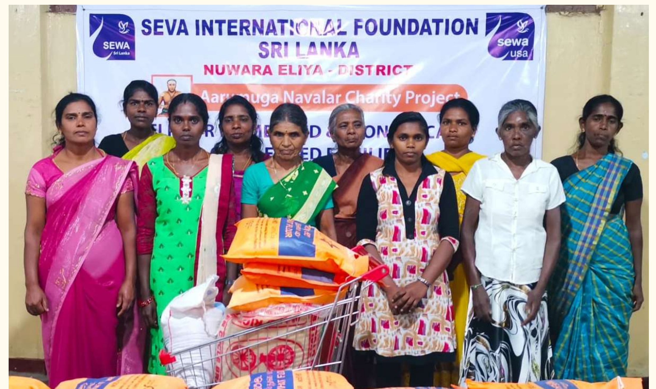
Beneficiaries receiving bags of grains in Sri Lanka.

SIF identified around 200 locations in 20 districts that needed food items immediately. The national-level coordinating team, followed by 20 district coordinators, distributed food items to the targeted families. Through this project, SIF aims to assist fifty families in each location focusing on ten economically challenged women-led families and forty other families affected by the current financial crisis.