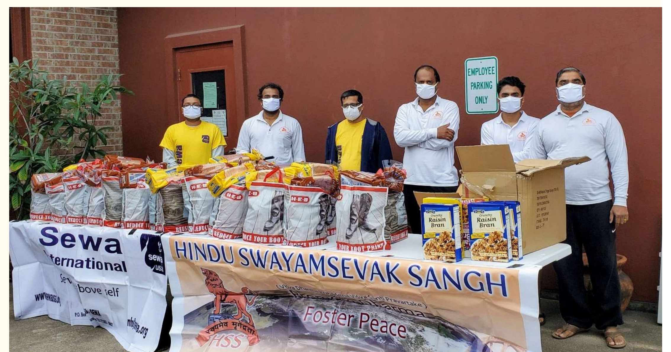
Sewa & HSS volunteers in a Food Distribution Event

The coalition letter is available here: https://bit.ly/3BN6eex .