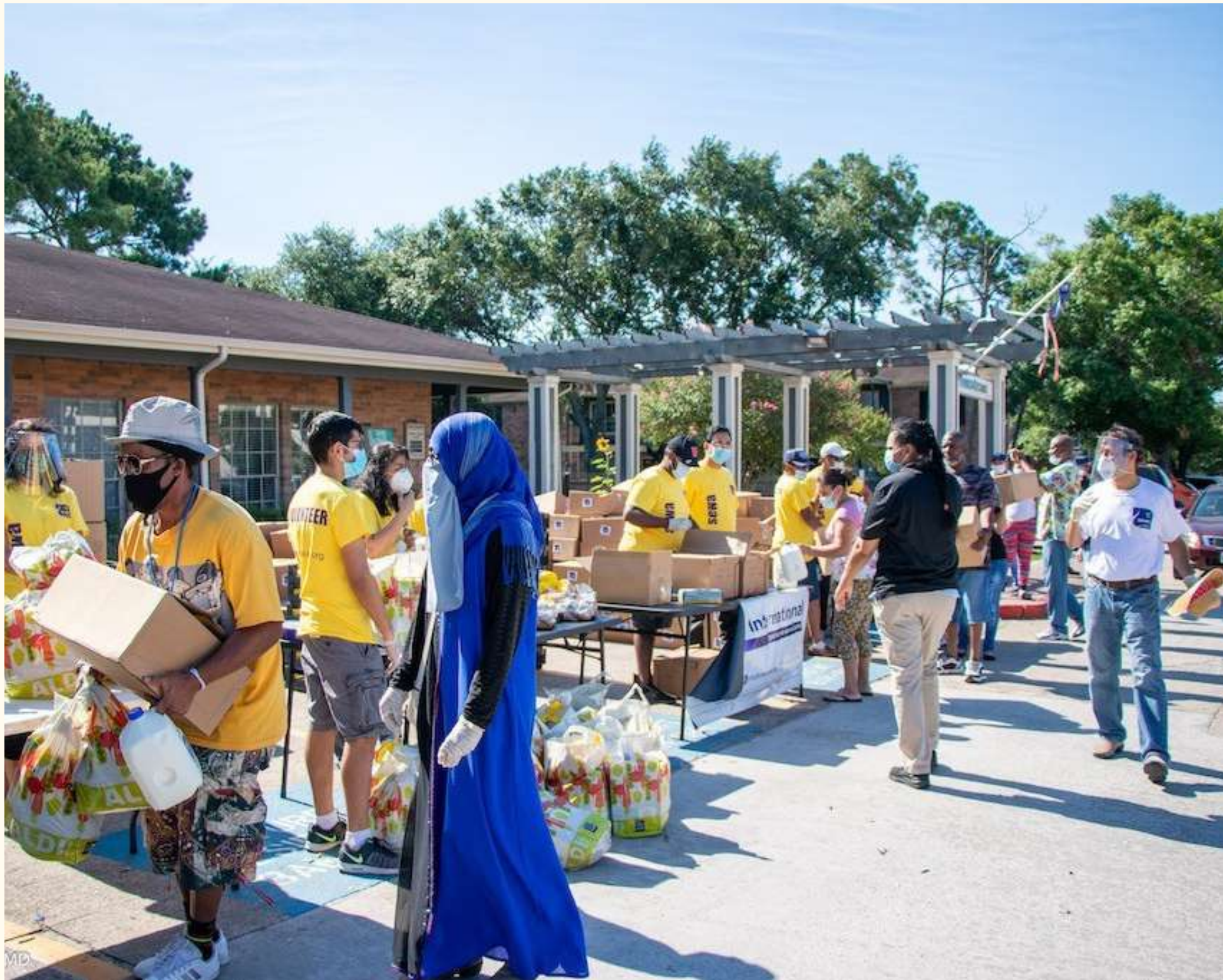
Sewa volunteers distributing food kits to COVID victims

Sewa International and over fifty other Hindu American organizations representing more than 155,000 residents of Bergen County, NJ, and surrounding areas signed a letter condemning the hateful resolution passed by the Teaneck Democratic Municipal Committee (TDMC) in September 2022.