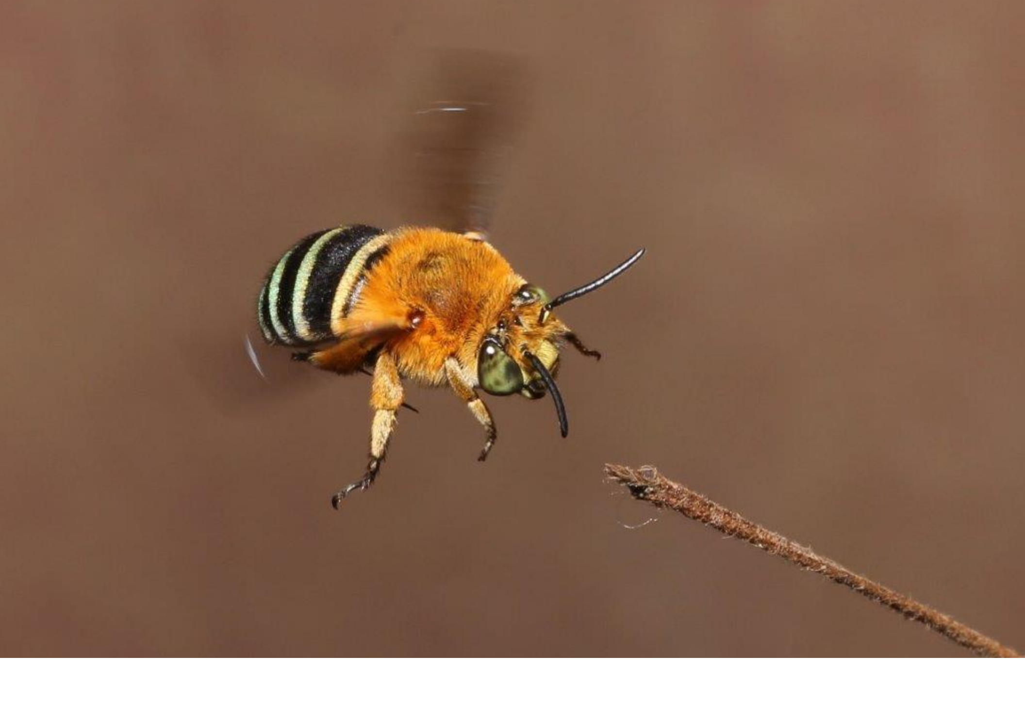
This twig looks like a good place to rest.