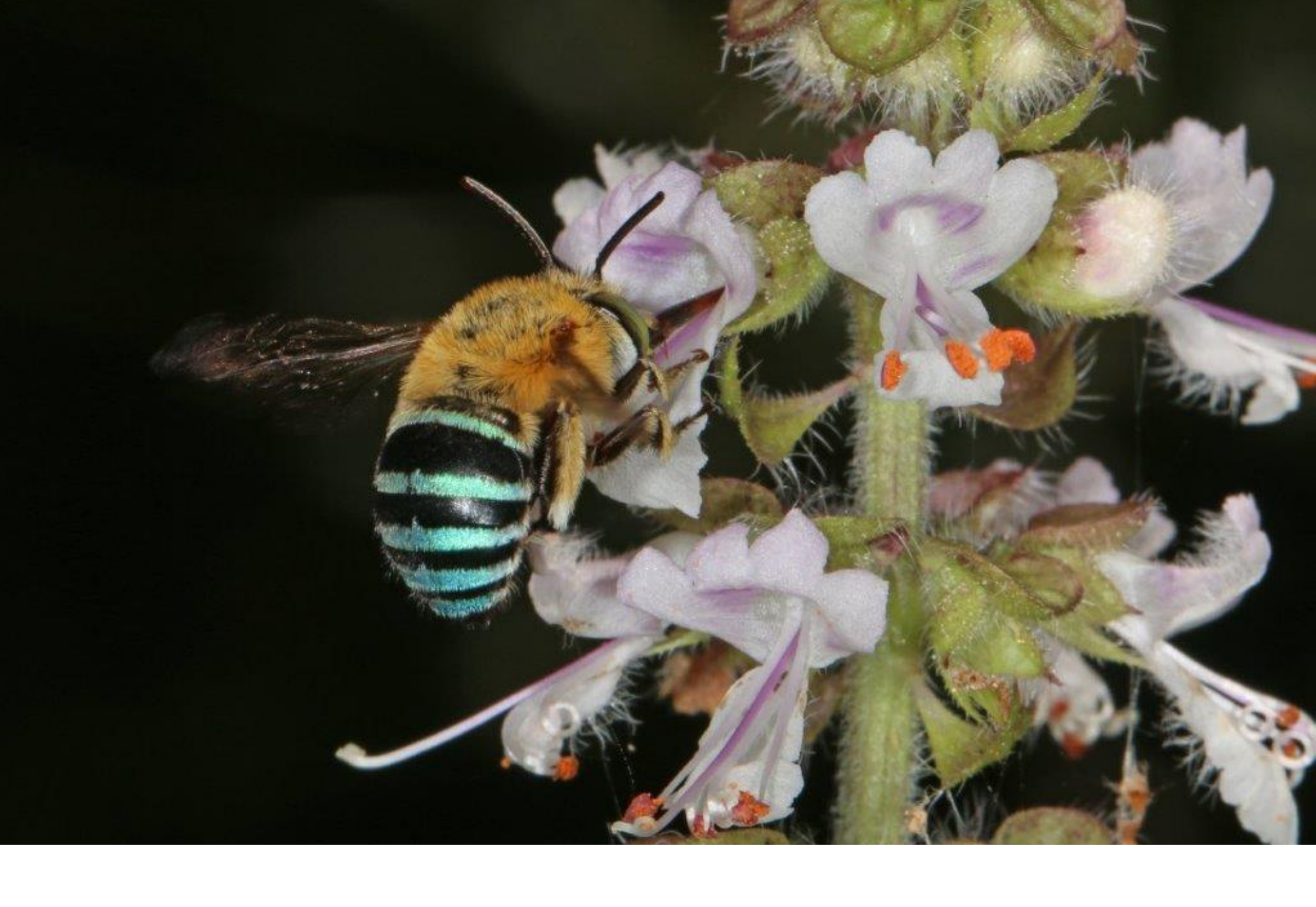
To drink, I insert my proboscis deep into the flower. Slurp!