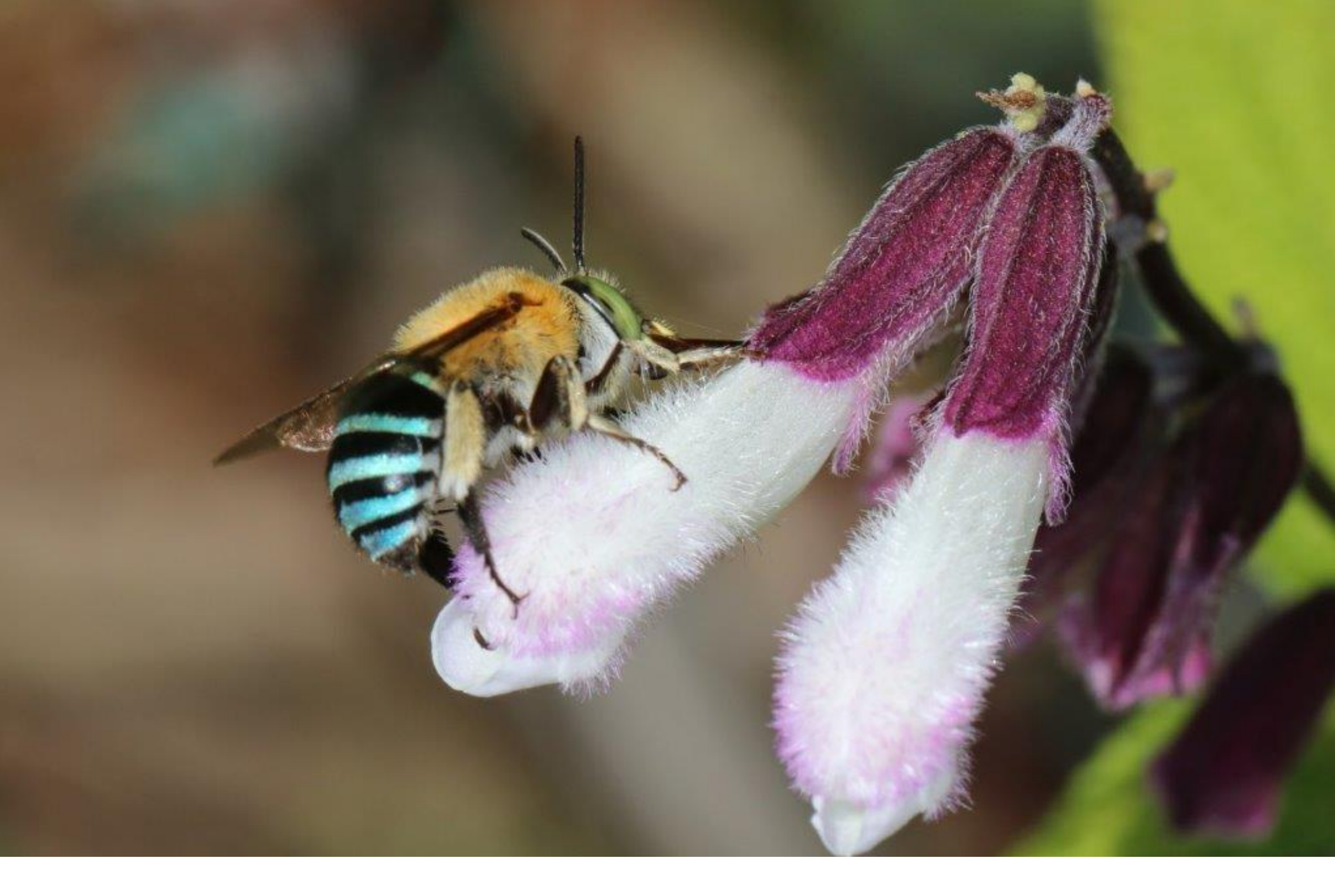
After I've warmed up in the sun, I'm off to forage and find a female to mate with.