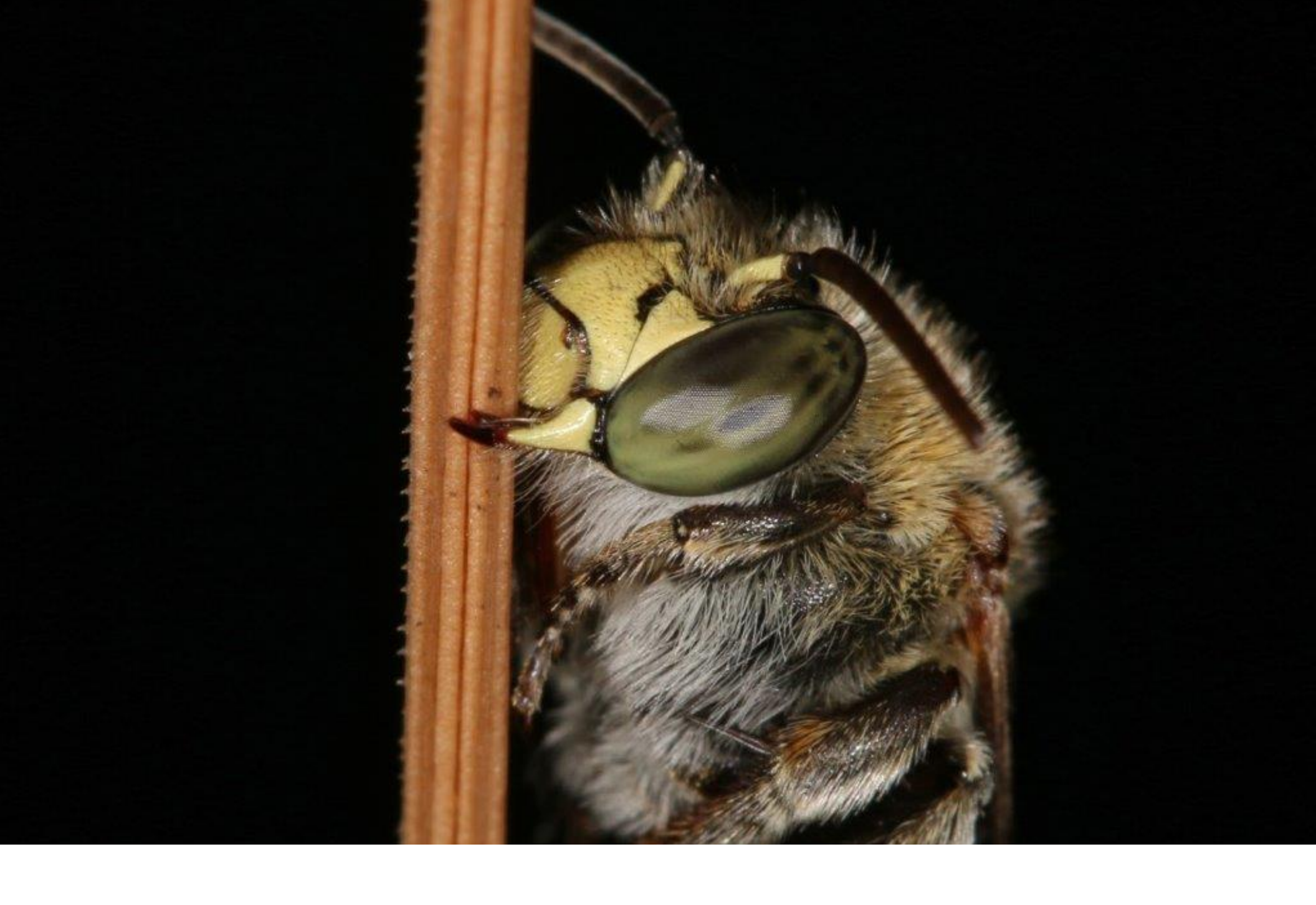
I use my mandibles to grab onto twigs or stems.