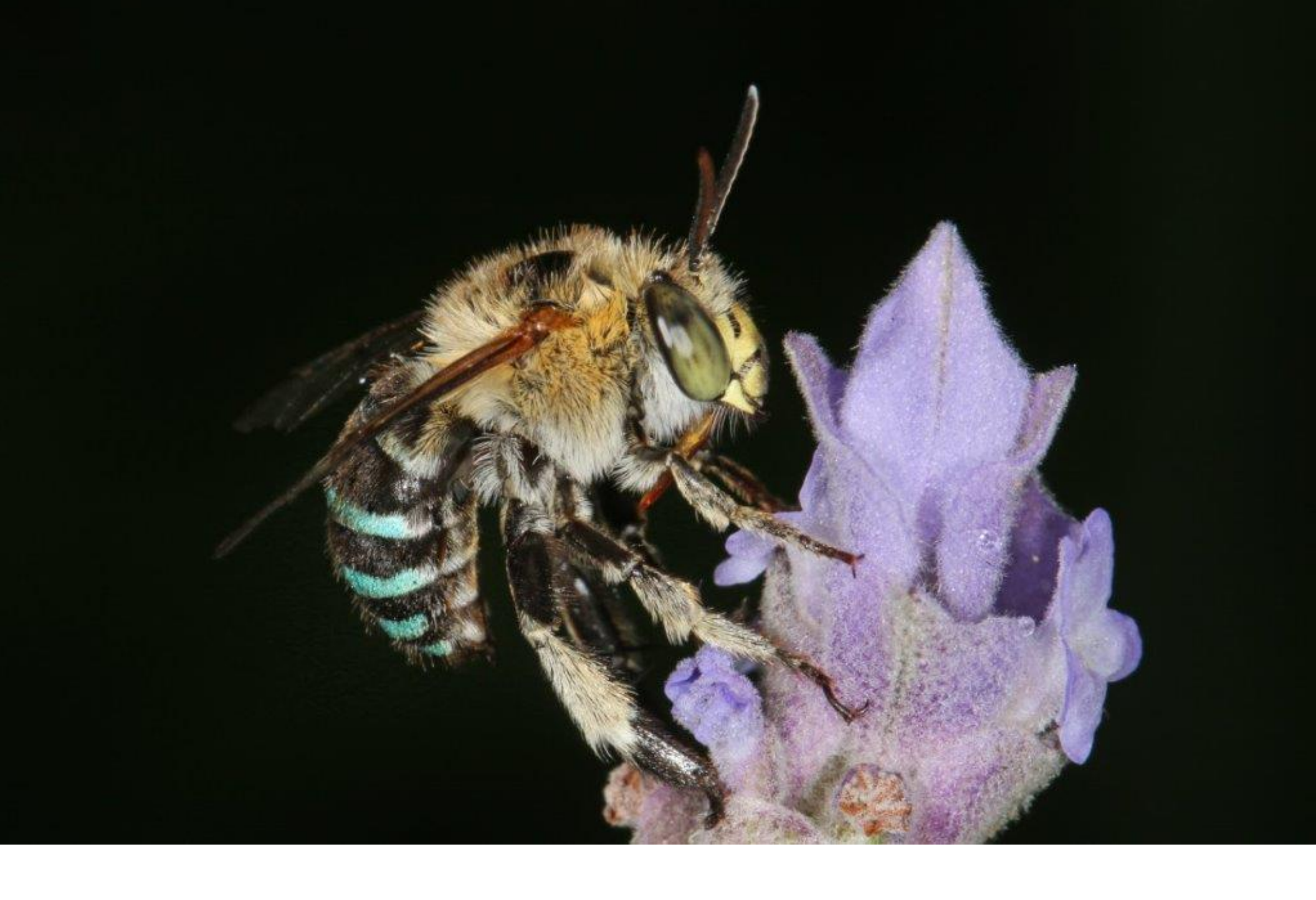
After I've had my fill, I feel a little sleepy.