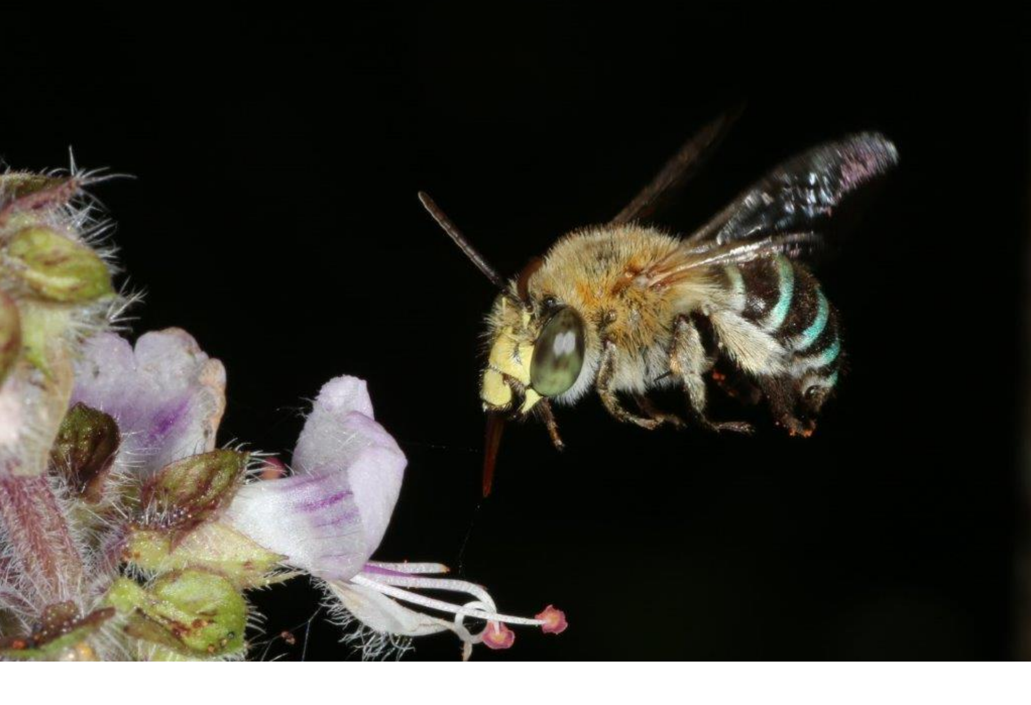
I use my proboscis to feast on the delicious nectar.