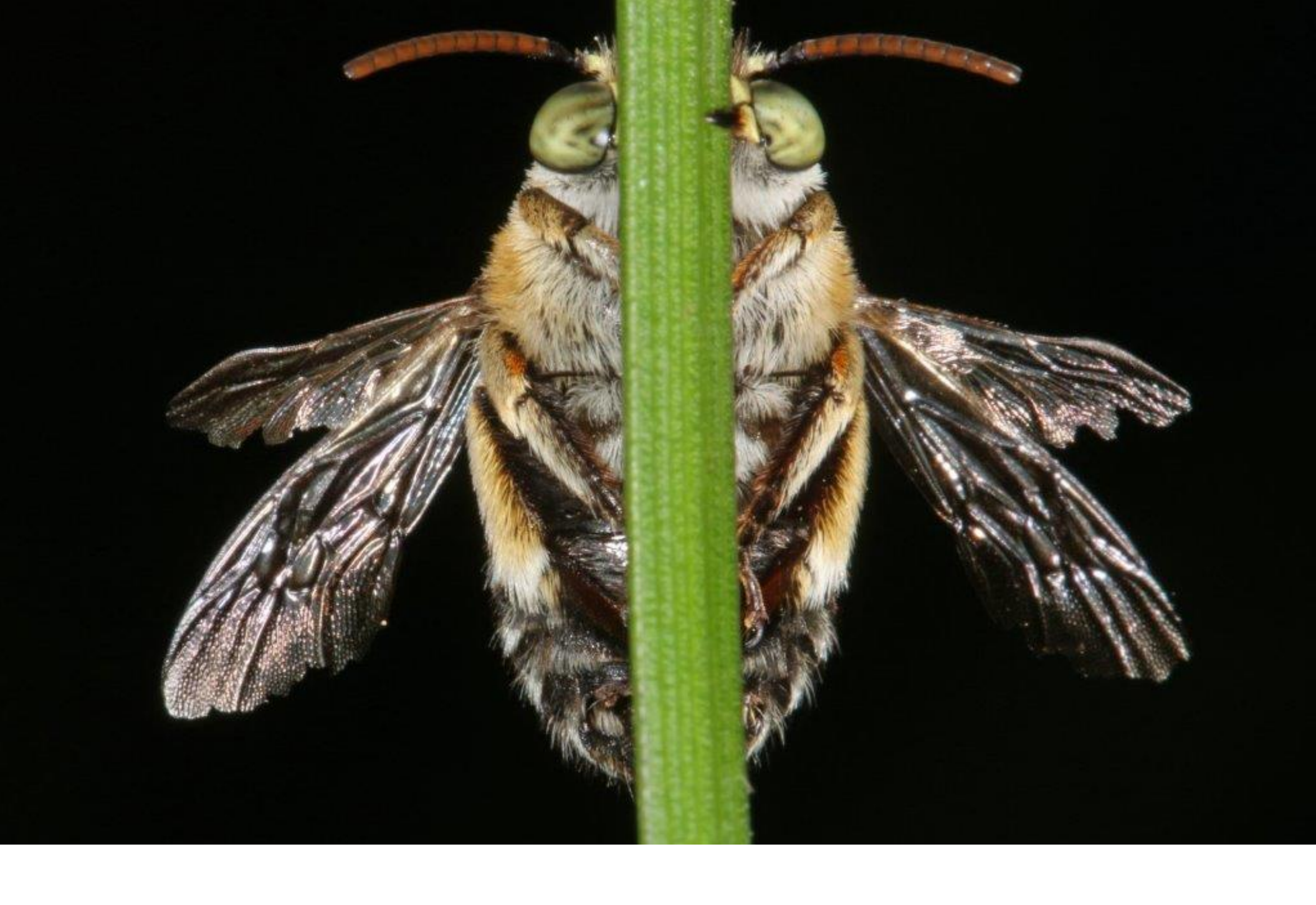
It pays to hold on tight ...