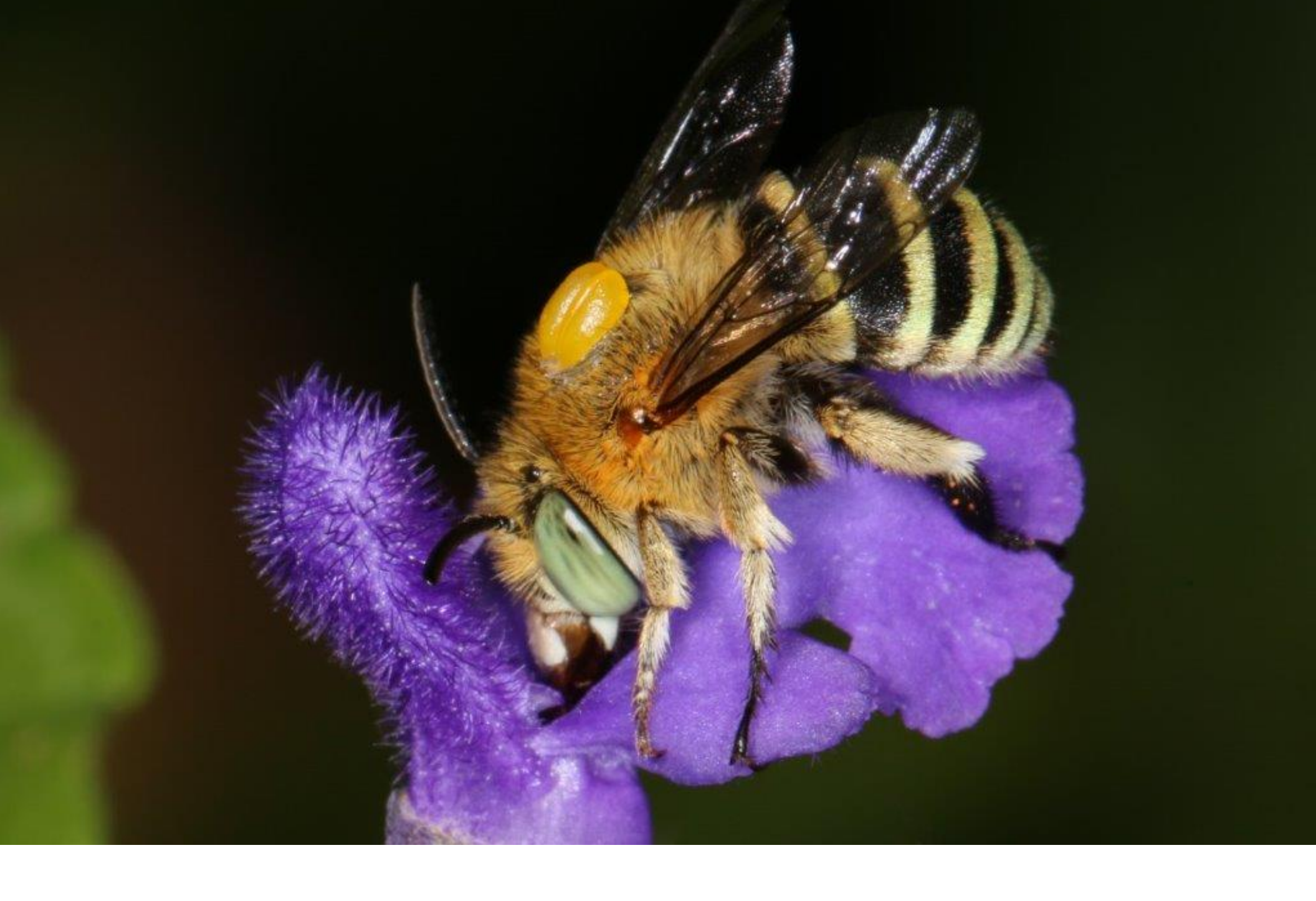
Sometimes, orchid pollen grains get stuck to my back.