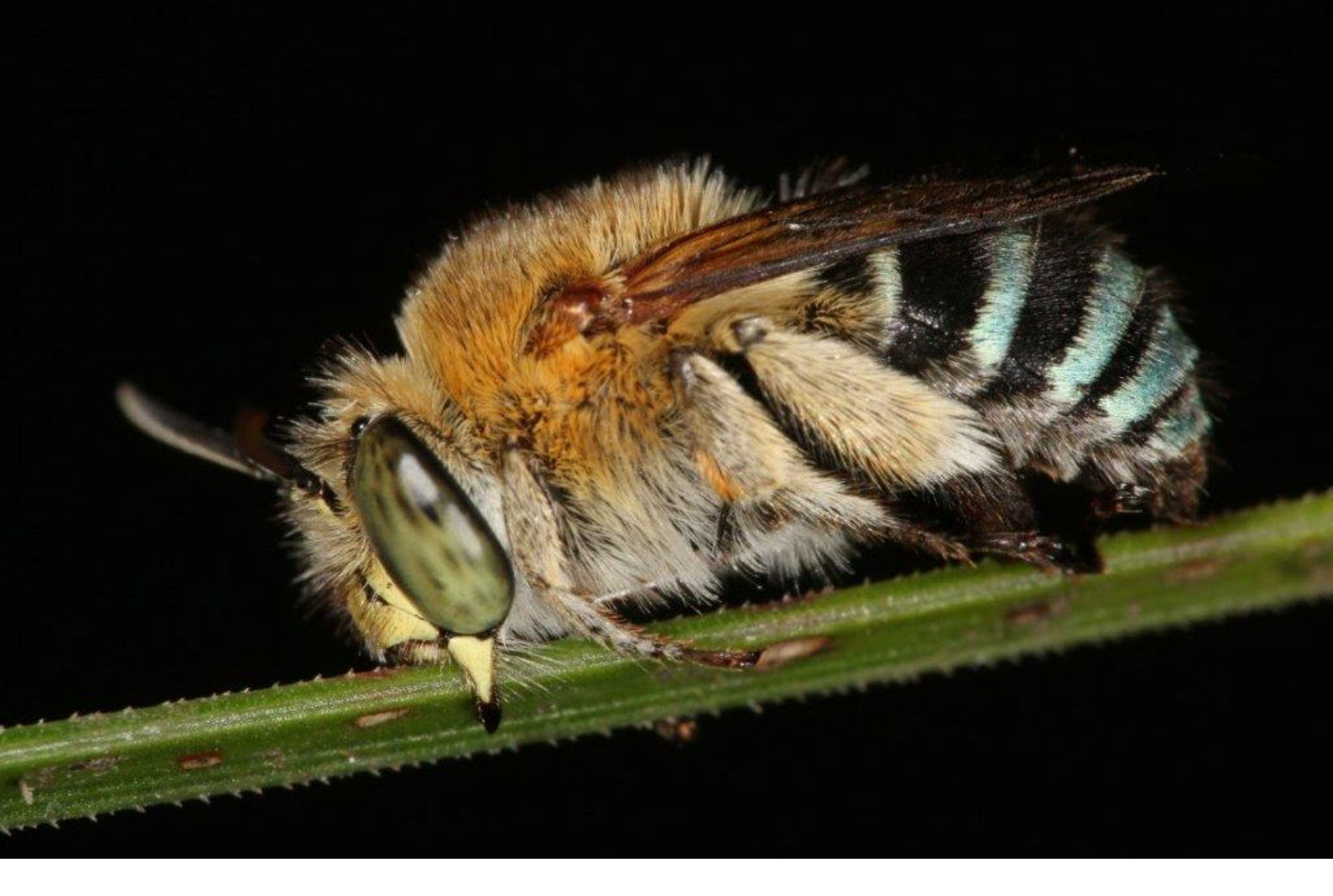
I'm a male blue banded bee. I have five blue abdominal bands, whereas females have four.