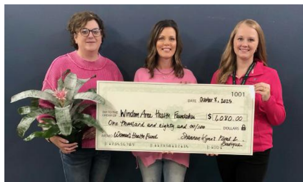
Pictured: Accepting a check from Shannon Lynn's Floral & Boutique.