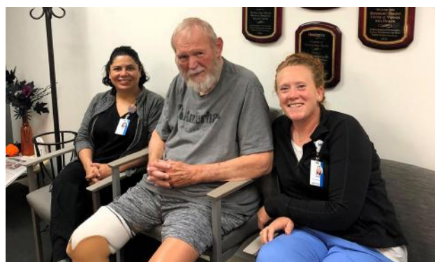
Pictured: Wound Center patient and staff on new hip-height chair.