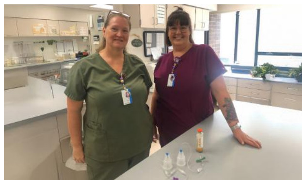
Pictured: Lab department staff with new blood culture collection devices.