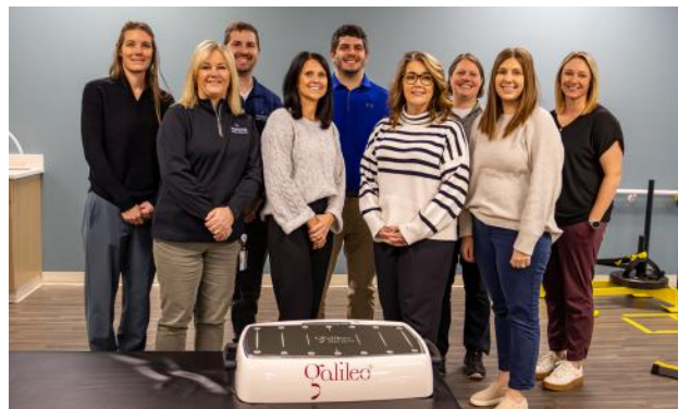
Pictured: Rehabilitation department and their new Galileo vibration platform.