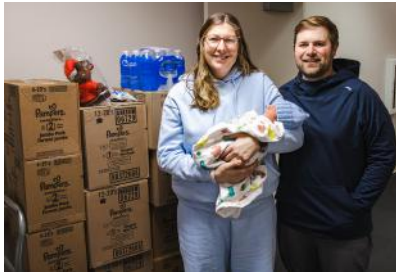
Pictured: The family with gifts from the community and year supply of diapers.