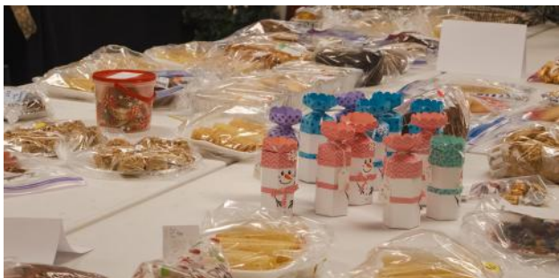
Pictured: A sample of products at the Bake Sale & Vendor Craft Fair.