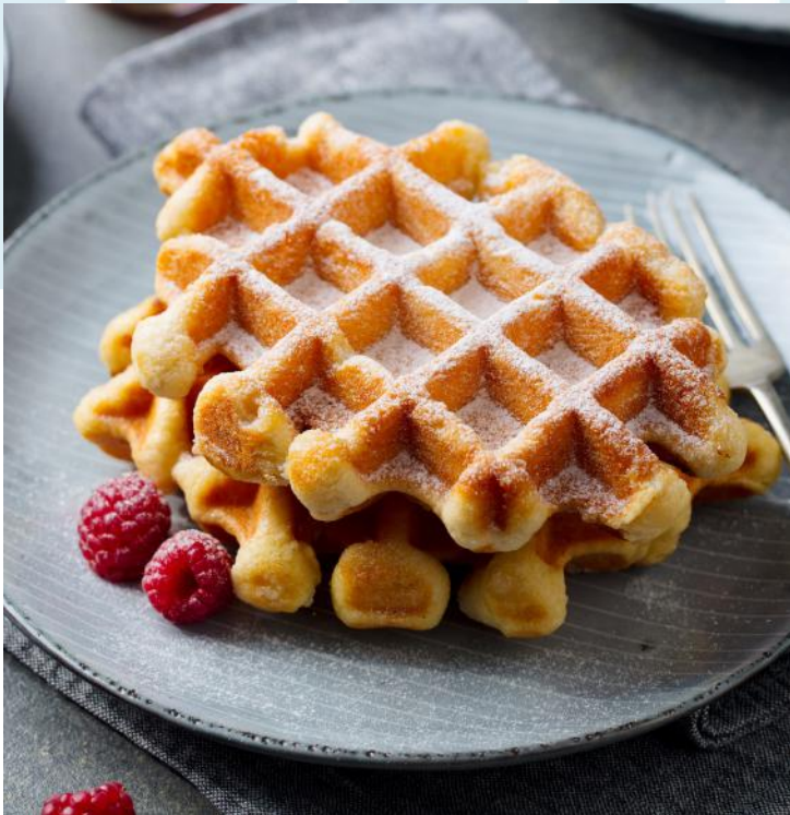
5190 WAFFLE AND PANCAKE MIX Our Waffle & Pancake Mix, a classic buttermilk blend perfect for making effortlessly delicious waffles and pancakes every time. This versatile mix ensures crispy waffles or fluffy pancakes for a delightful morning treat. Makes 10 servings. 400 g (14.1 oz.) $18.00