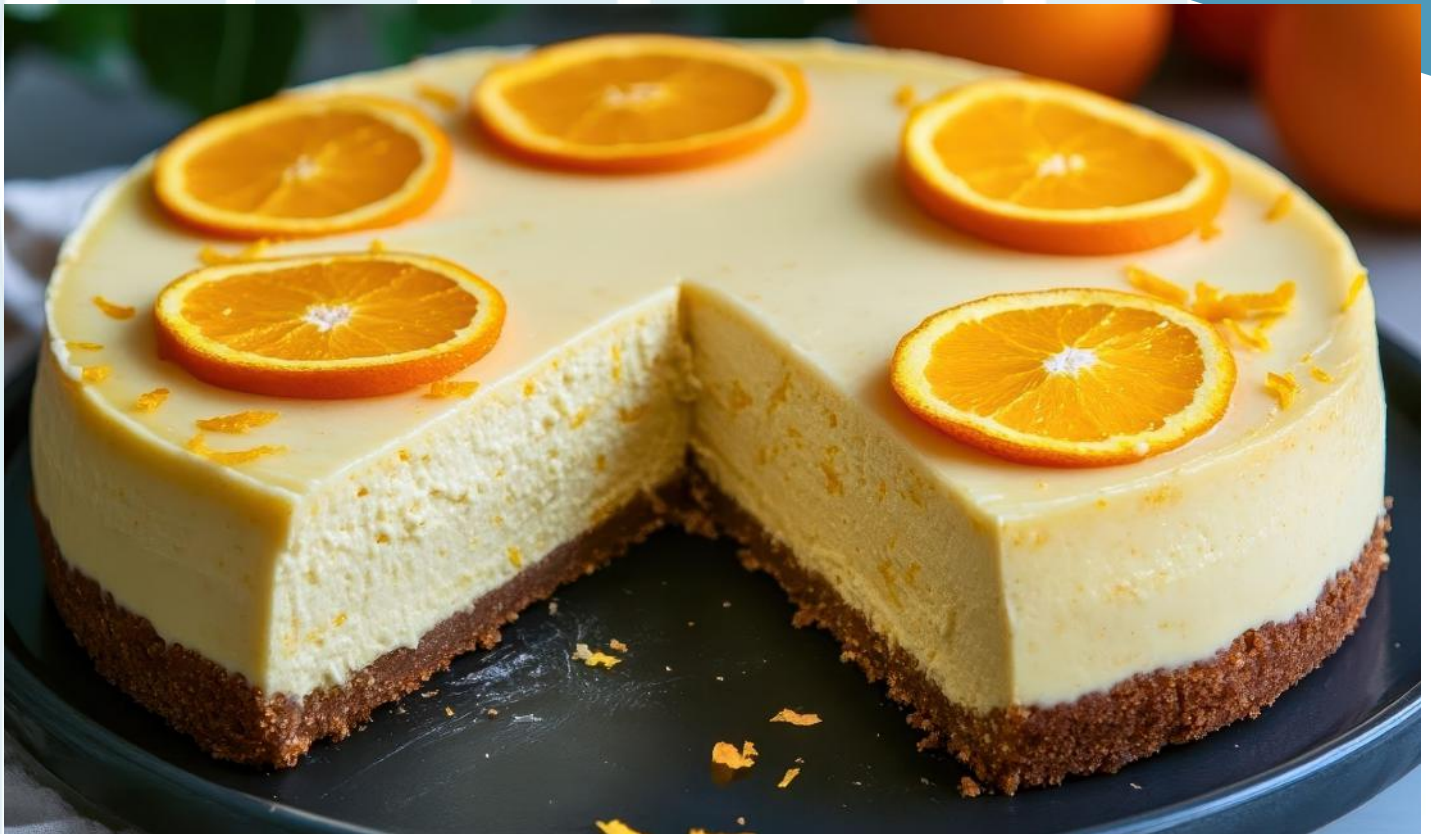
9619 DREAMY CREAMSICLE CHEESECAKE MIX The perfect blend of oranges and creamy cheesecake make this combination a no brainer! Serves 8. $14.00