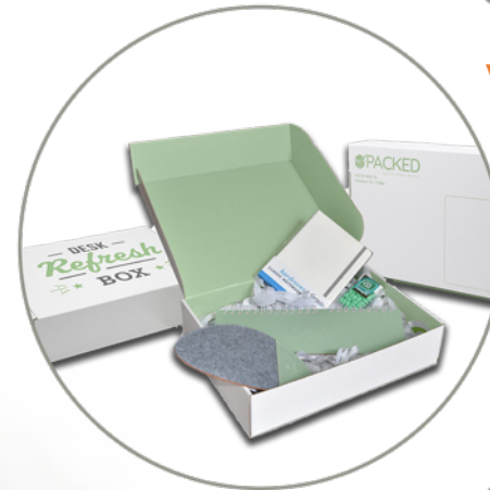
Desk Refresh kit