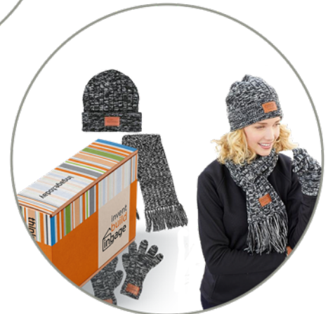
Stay cozy kit