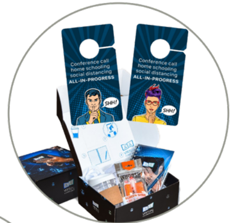
Virtual Meeting kit