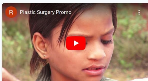
Plastic Surgery at Chitrakoot

In order to provide the very best treatment available in the 21st Century there is a need to improve and update the present facilities with the newest instruments and technology.