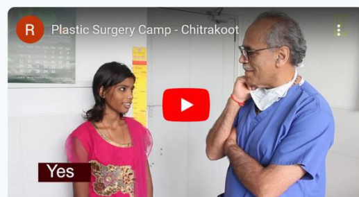
Plastic Surgery Promo