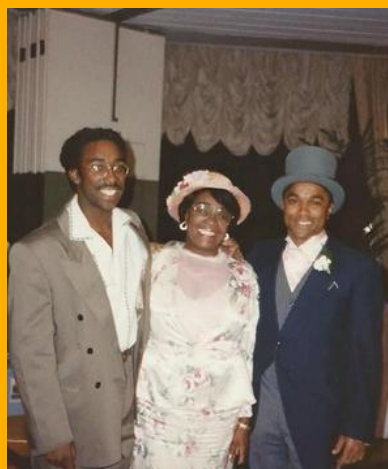
All dressed up at a wedding, c1989