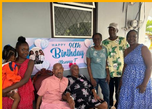
The milestone party was lovely