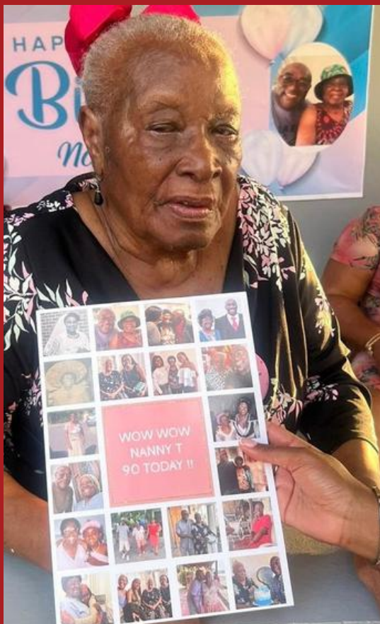
She was blessed to see her 90th

At least we can celebrate the kindness and beauty of a wonderful woman.