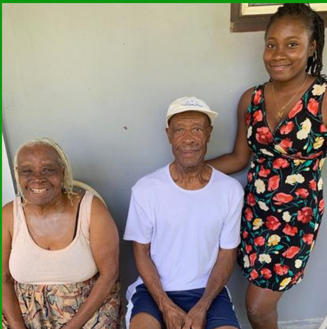
Mum was always well cared for