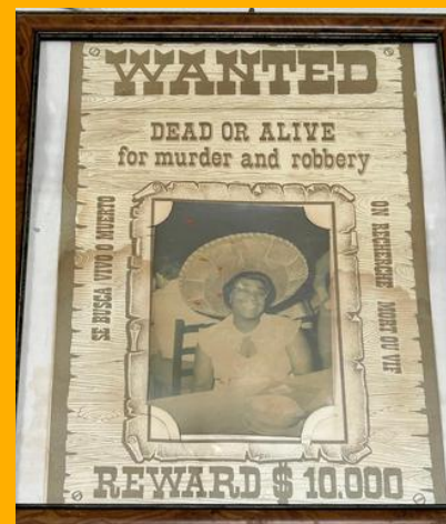
She enjoyed travelling around Europe