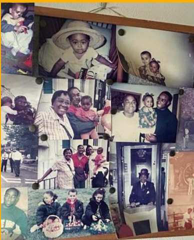
She kept lots of family photos, especially of her grandkids