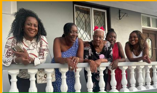
With her special people at her 90th

Her kindness and generosity, both in spirit and financially, is legendary. Many can give examples of that. She'd return to Salisbury from London with suitcases packed with clothes, footwear and presents for loved ones. Cash gifts were always inserted in birthday cards to her family abroad, envelopes typically sealed so tightly with super glue that we'd have to prise them open. Mum lived the dream in retirement; summer months in England, winter months in her beloved Dominica.