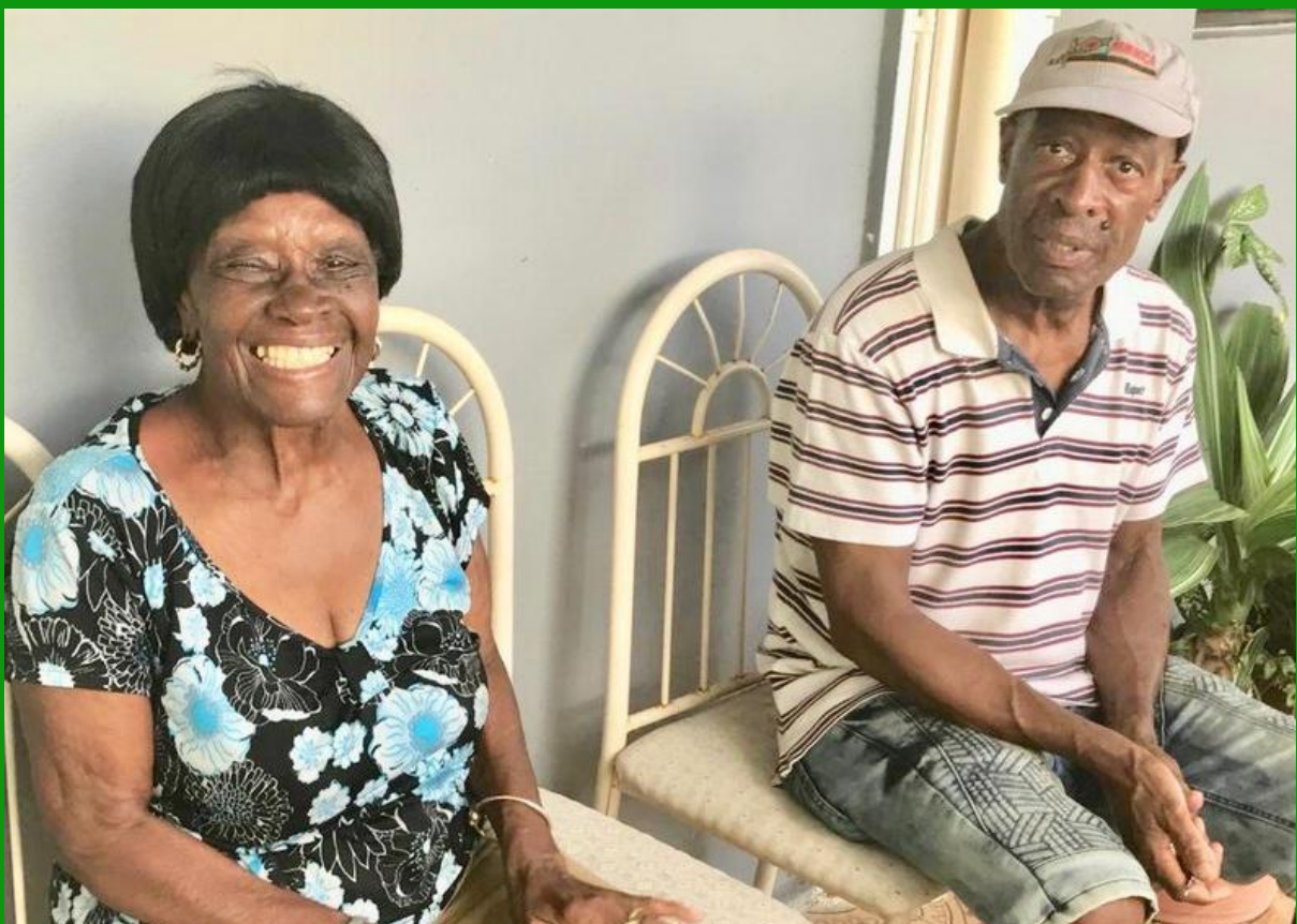
Uncle Ato looked after Mum brilliantly