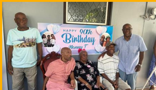
Her brothers were at the 90th