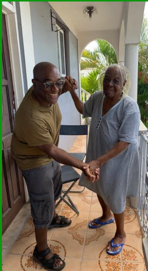
Twinkle toes even at 90!