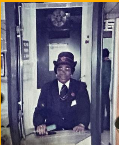
Mum worked hard for 20 years for London Transport