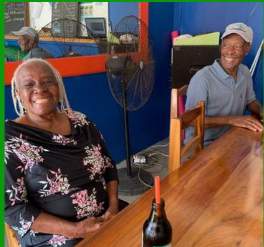
Fun time at Indee's, Mero Beach