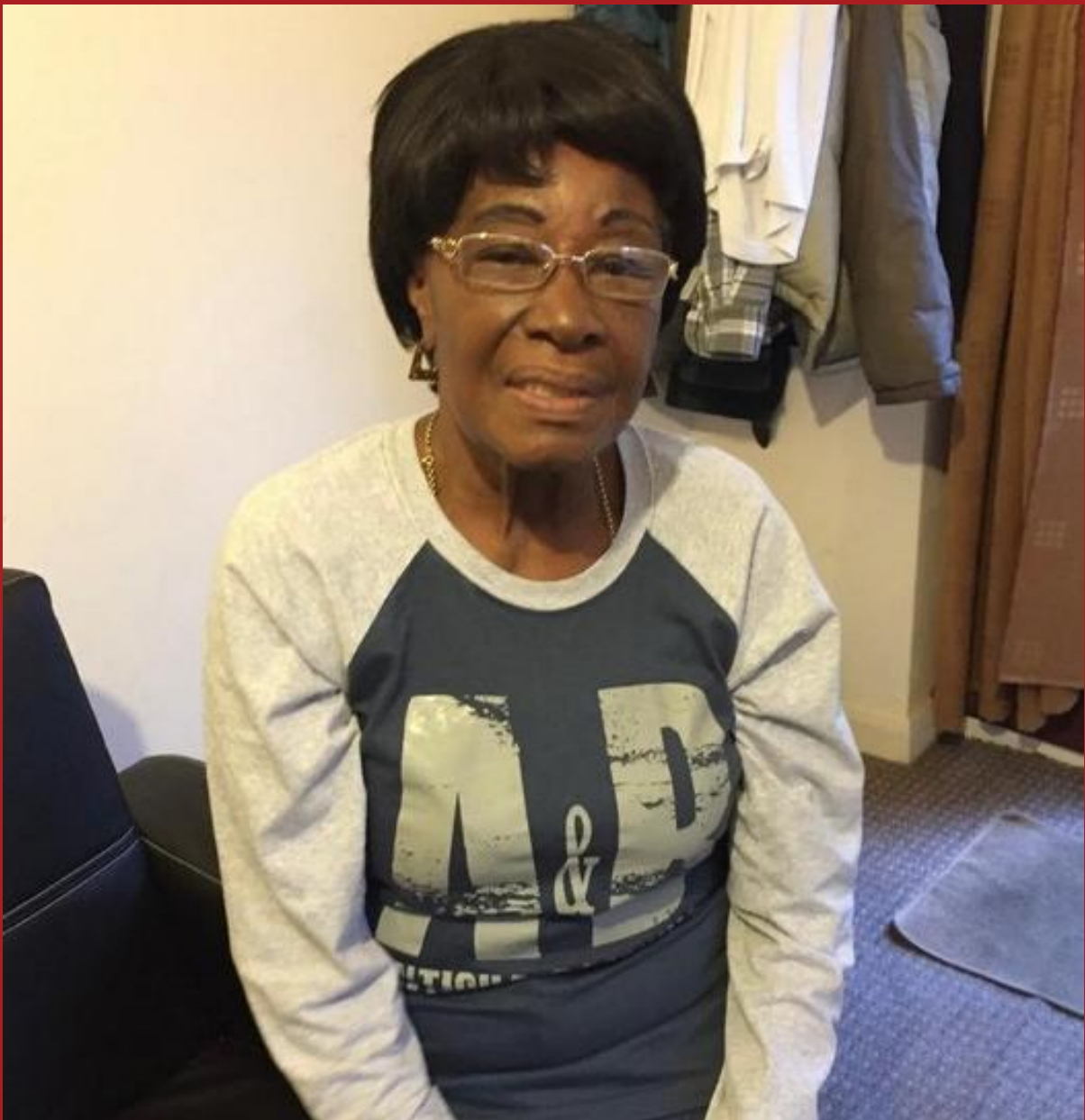
Relaxing in London

A stylish dresser, Mum took pride in her appearance. Even a trip to the local shops involved a change of clothes, application of fresh makeup and choice of matching handbag.