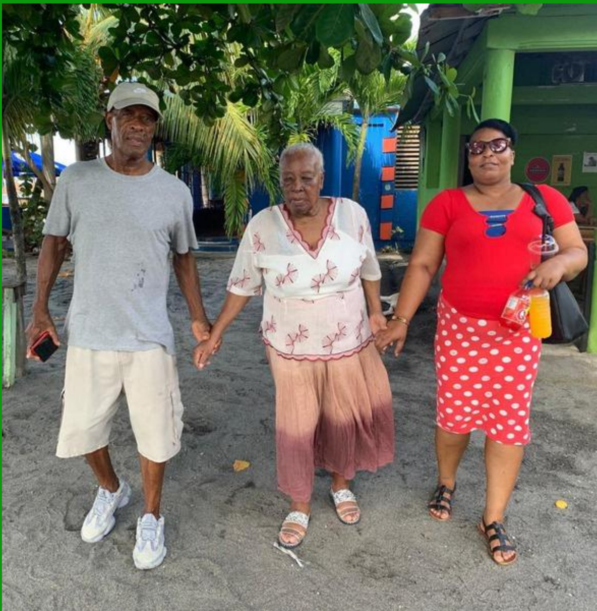
Mero Beach day out