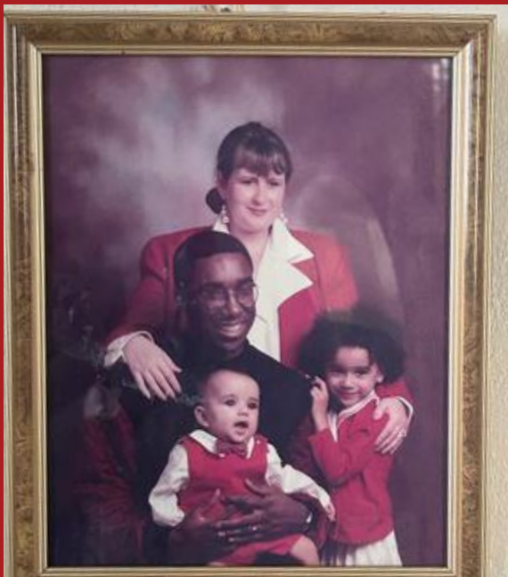
This was one of Mum's favourite old family pics