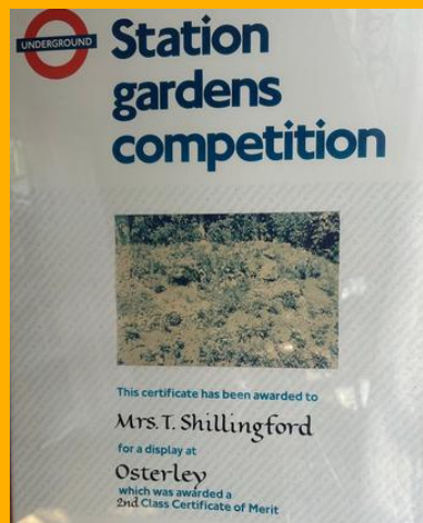
Mum was proud of her gardening certificates