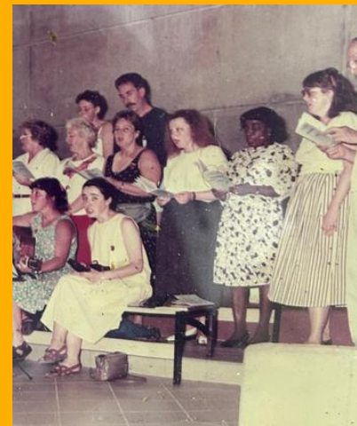
She was a keen member of the choir in Isleworth