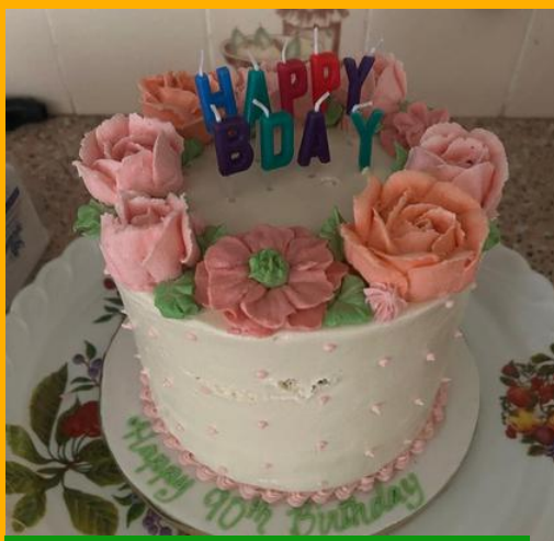
The birthday cake was delicious