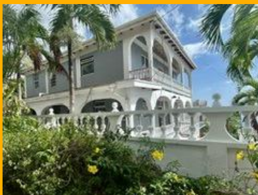
Mum's freshly painted house