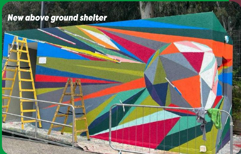
New above ground shelter