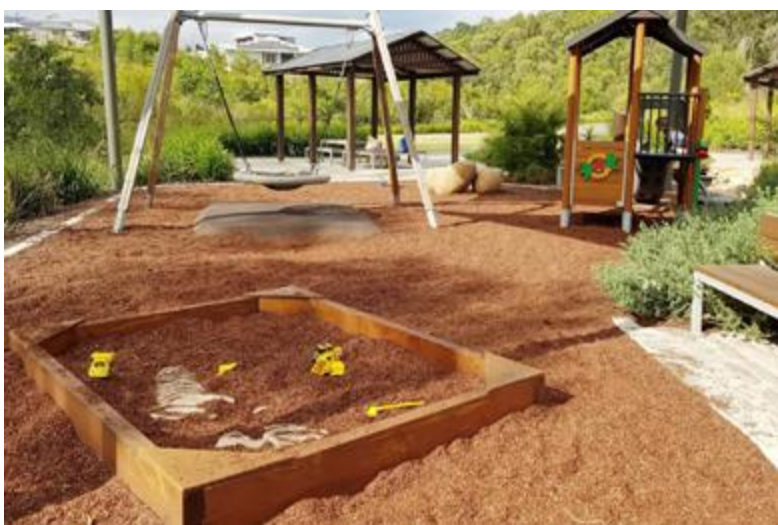
Fossil digs and sandpits encourage quiet, imaginative play