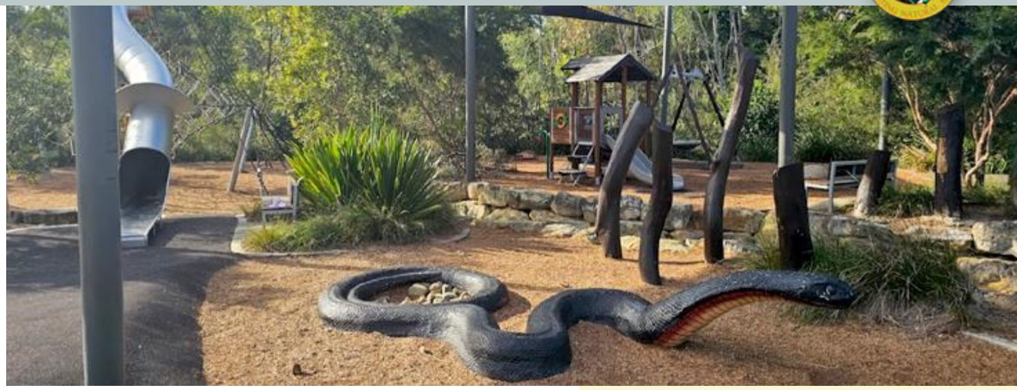
A giant red bellied black snake provides a central climb and play feature