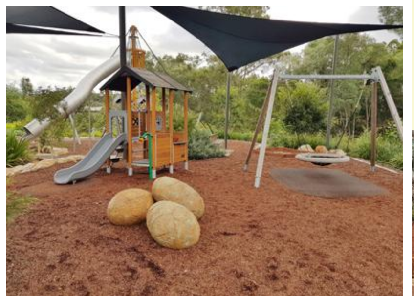
These giant-sized dinosaur eggs double as seats and climbers

"Kids can balance along the giant red bellied black snake, dig for dinosaur fossils or explore the playhouse... Little explorers will love the dry creek bed and giant eggs."