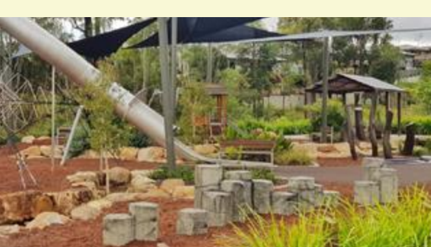
Balancing columns beside the dry creek bed