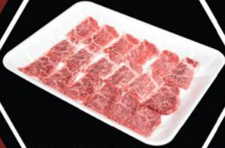
BBQ Chuck Roll