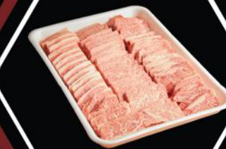
BBQ Chuck Rib