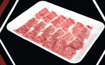
Slice Chuck Roll