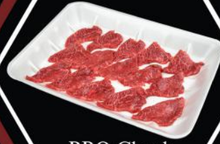
BBQ Chuck Tender