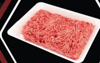
Beef Mince Neck & Shank