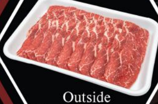
Outside (Bottom Round)