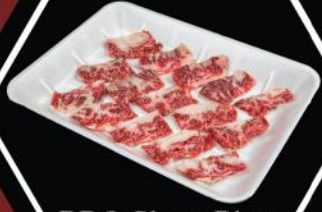
BBQ Short Plate (Inside Part)