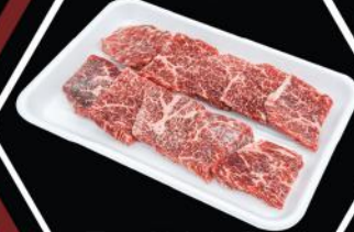
Top Sirloin Butt (Backside)