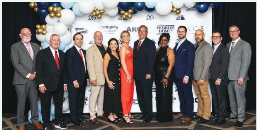
The Next Step Board of Directors

12-step recovery program from substance use disorder academic or vocational education.