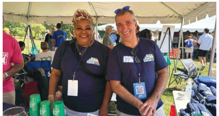
Board members, community ambassadors, and scholarship recipients volunteer at our 2025 RecoveryFest STL tent.