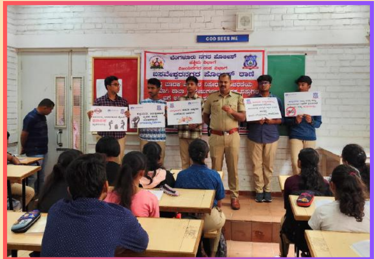
WORLD DRUG ABUSE DAY (26-06-24)