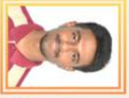
SAAVI GAGAN A V PCMC - 96.33%