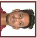
YOITH D EBAC - 92.50%