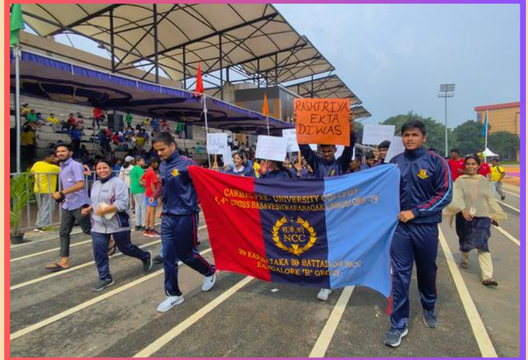
NATIONAL UNITY DAY (31-10-24)