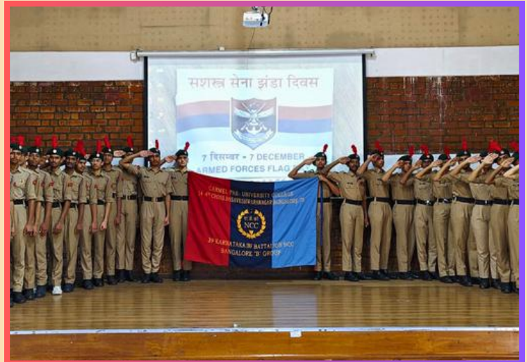
ARMED FORCES FLAG DAY (07-12-24)