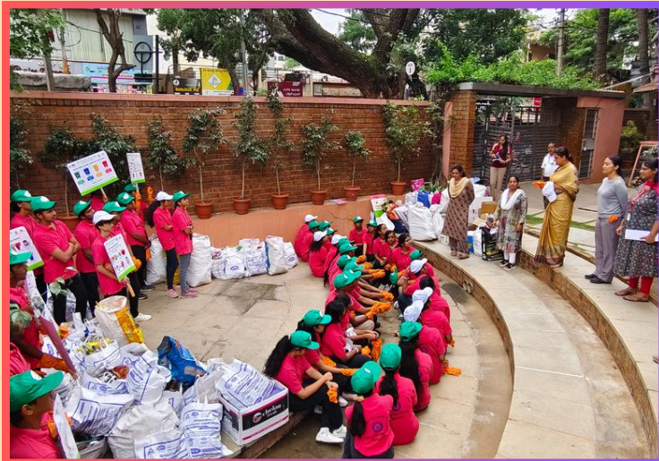
INTERNATIONAL PLASTIC BAG FREE DAY (03-07-24)