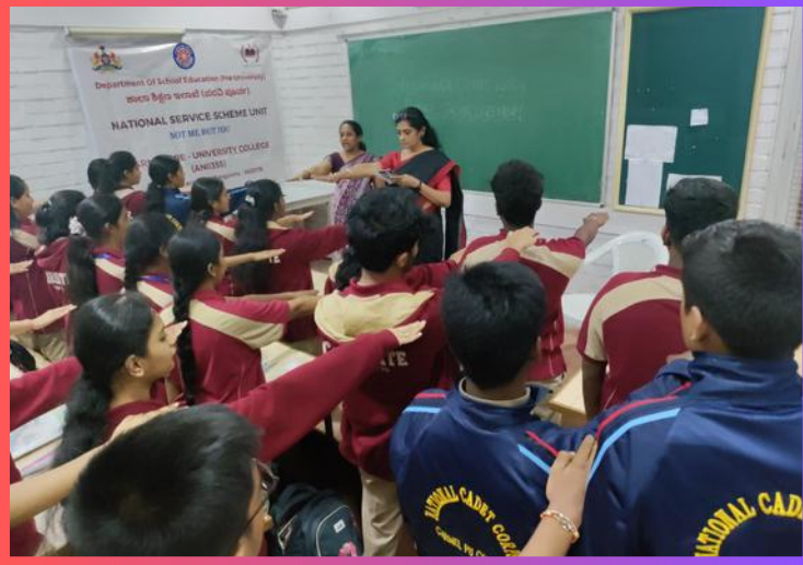
SADBHAVANA DIWAS (20-08-24)