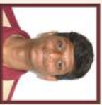
LIKITH HS EBAC - 92.33%