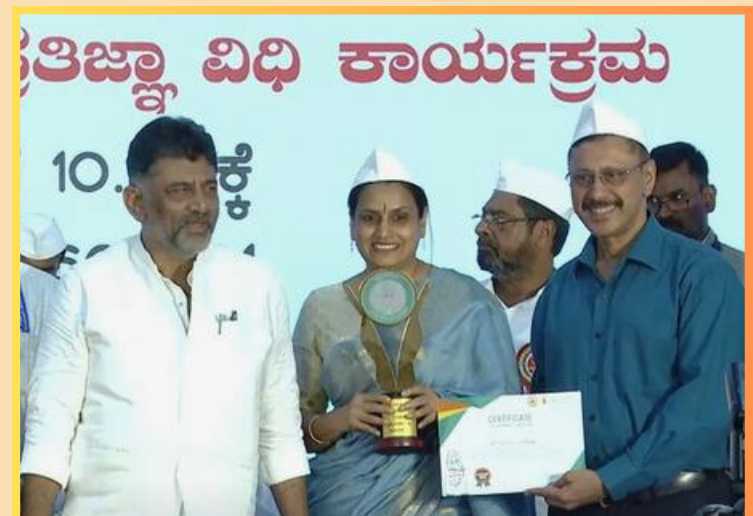
“BEST INSTITUTION AWARD” BY THE GOVERNMENT OF KARNATAKA IN COLLABORATION WITH CLEANBLR, A BBMP INITIATIVE, FOR PARTICIPATION IN SWACHHATA HI SEVA 2024