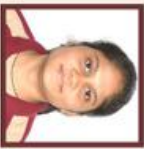
LISHIKA A PCMC - 93.50%