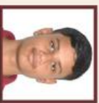
SMARAN C PCMC - 91.67%