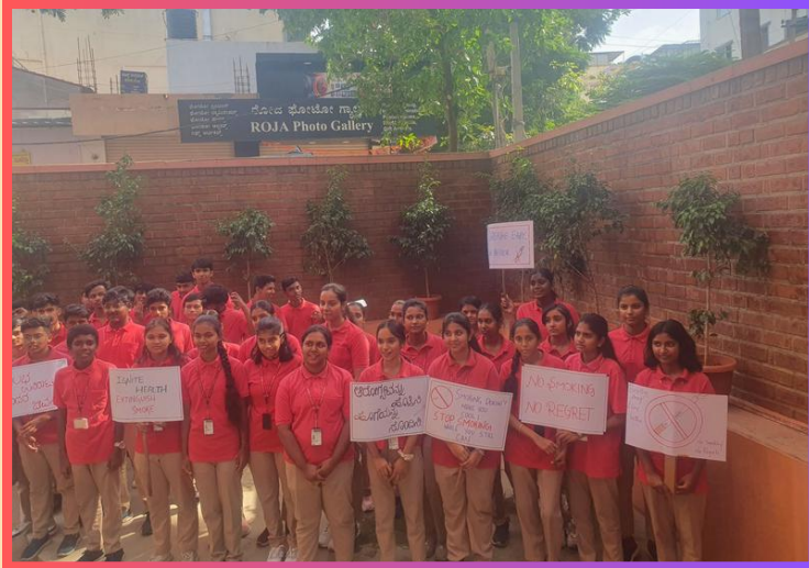
WORLD NO TOBACCO DAY (31-05-24)