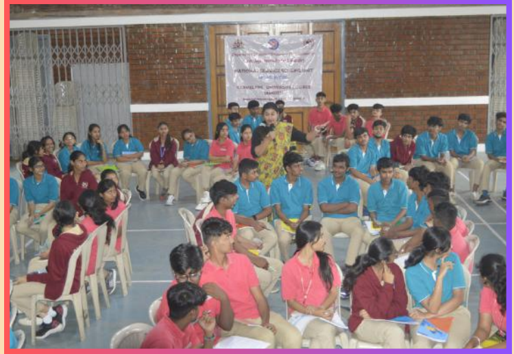
WORLD SUICIDE PREVENTION DAY (10-09-24)