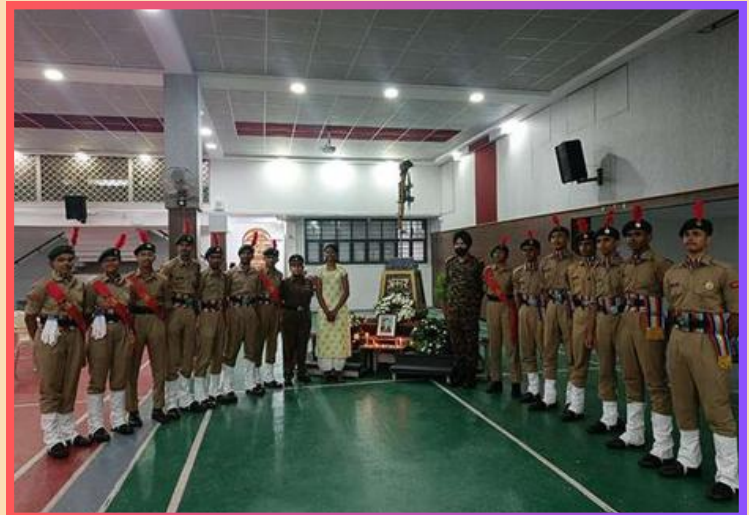
KARGIL VIJAY DIWAS (26-07-24)