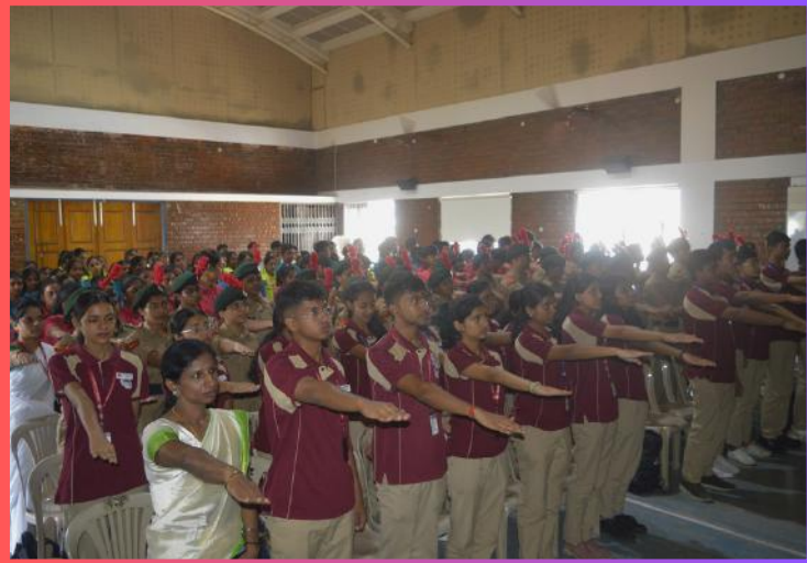
INTERNATIONAL DAY OF DEMOCRACY (15-09-24)