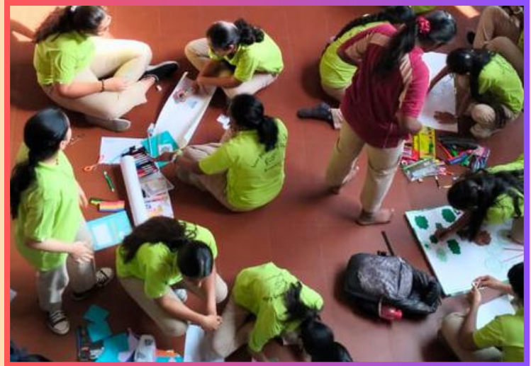
WORLD ENVIRONMENT DAY (05-06-24)