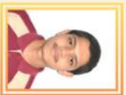
NEEDHWAJ K R PCMC - 98.67%