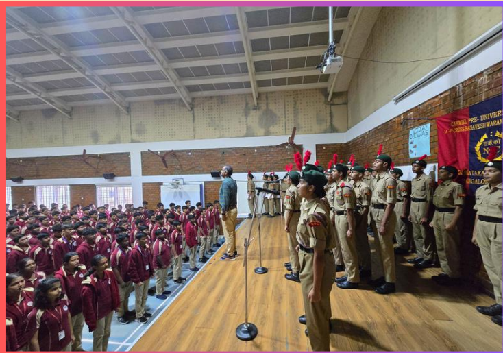
CONSTITUTION DAY (26-11-24)