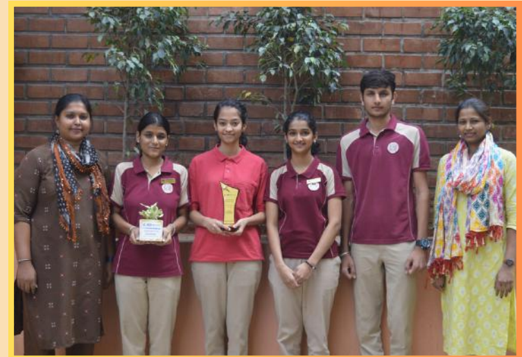
“BEST INSTITUTION AWARD” BY ITC IN PARTNERSHIP WITH ANUBHUTI WELFARE ASSOCIATION