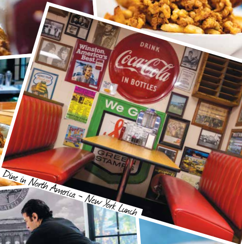
Dine in North America - New York Lunch