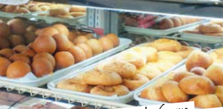
Dine in South America - La Casona