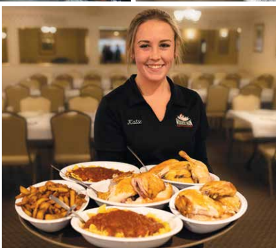
Dine in North America - Wright's Farm