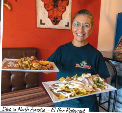
Dine in North America - El Paso Restaurant