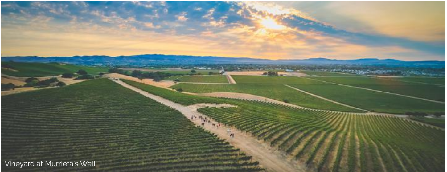
Vineyard at Murrieta's Well