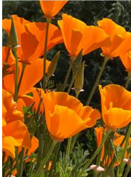
2nd Place: Tangerine Flowers Nidhi Kota