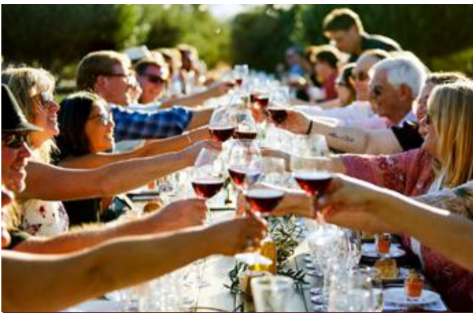
Taste Our Terroir Event