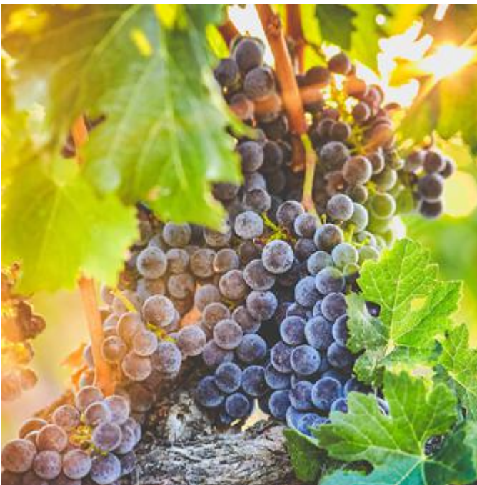
Retzlaff Merlot Harvest