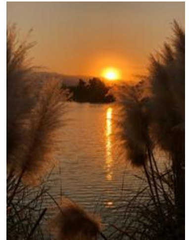
3rd Place: Golden Hour Pravallika Pasupulati