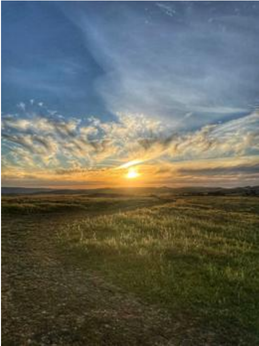
1st Place: Spectaculars of the Sky Pravallika Pasupulati