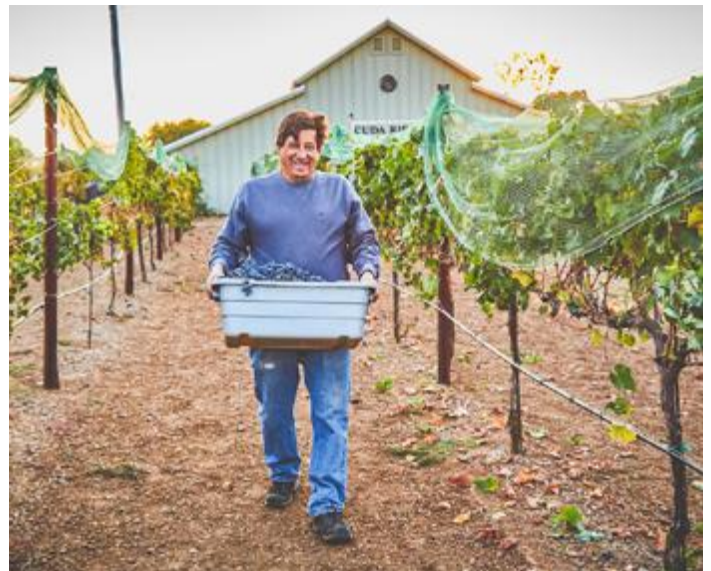
Cuda Ridge Petit Verdot Harvest

If you are interested in working with Ron, visit RonEssexPhotography.com for more information.