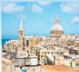
Italy to Malta Sept 14 - 28, 2027