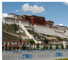
China & Tibet Sept 12 - 28, 2027