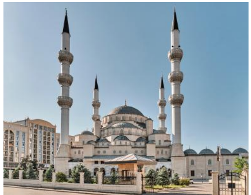
Bishkek Central Mosque