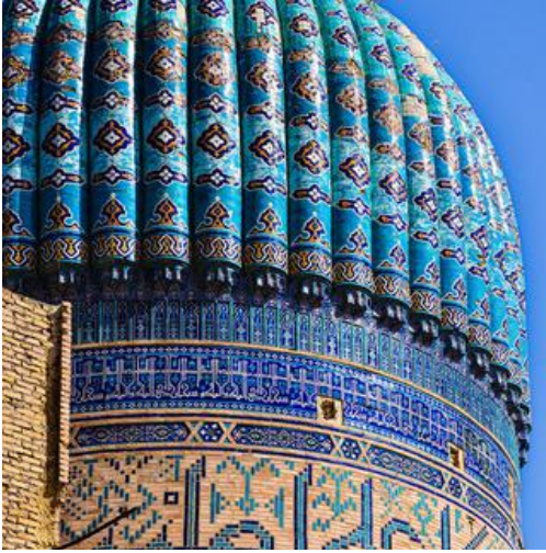
Bibi-khanyum Mosque in Samarkand

A full day is devoted to Samarkand's extraordinary architectural and historical heritage. Visit the grandeur of Bibi Khanum Mosque and Registan Square, appreciating their scale and artistry in greater depth. Continue to the Shah-i-Zinda necropolis, a remarkable avenue of mausoleums adorned with intricate tilework dating from the 14th century, widely regarded as one of the most beautiful sites in Central Asia. Conclude with a visit to the Ulug Beg Observatory, where groundbreaking astronomical studies were conducted in the 15th century, reflecting the city's importance as a centre of scientific learning. Lunch included.