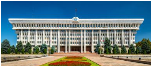
Central Asia Treasures

Upon arrival, transfer directly to your hotel. After time to rest, begin your introduction to Kyrgyzstan's capital. Explore Ala Too Square, the city's central gathering place, and view monuments to Manas, Kurmanzhan Datka, and Lenin. Continue past key governmental buildings to Old Square, home to the Parliament House and Fine Arts Gallery, before concluding at Victory Square, dedicated to World War II. This evening, gather for a welcome dinner.