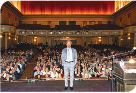
Above: David Baldacci with attendees at The Appell Center.

In 2025, York County Libraries launched two signature fundraisers, following a strategic planning process which identified the need to strengthen long-term financial sustainability. We are proud to share the results of these initiatives!