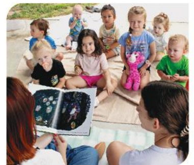
Outdoor Story Time at Springettsbury Township Park

Story Time sessions increase attention span, early group experiences, and opportunities for children and caregivers to bond. 1,196 story sessions reached 33,391 children in 2025!