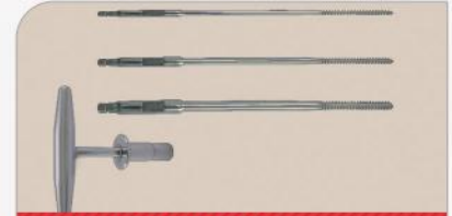
Tap 4mm(EG030005) Tap 5mm(EG030006) Tap 6mm(EG030024)