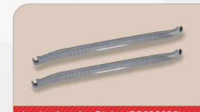
In situ bender Right (EG030020) In situ bender Left(EG030021)