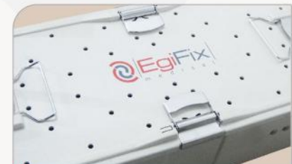
Steralization tray for instuments