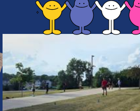
HRC summer campfire & yard games