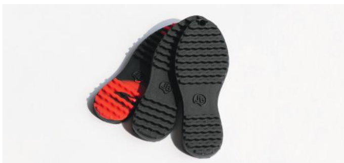
Shoe soles with Austin Black® 325 as filler and for coloring