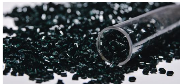
Economical filler for Plastic Masterbatches