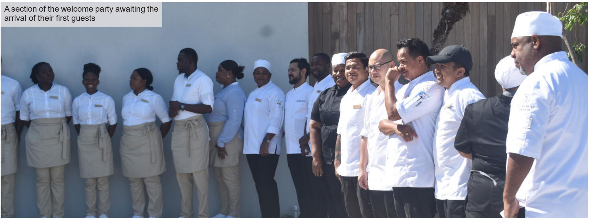
A section of the welcome party awaiting the arrival of their first guests