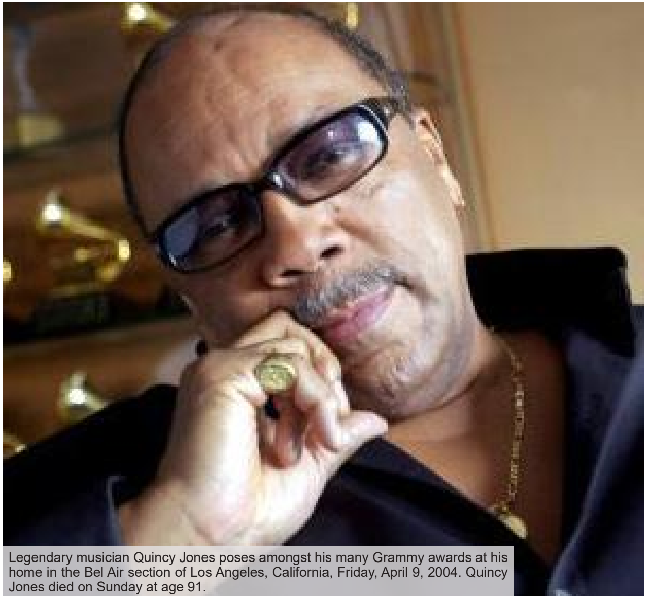
Legendary musician Quincy Jones poses amongst his many Grammy awards at his home in the Bel Air section of Los Angeles, California, Friday, April 9, 2004. Quincy Jones died on Sunday at age 91.

Perhaps Jones' best-known production partnership is the one he had with Michael