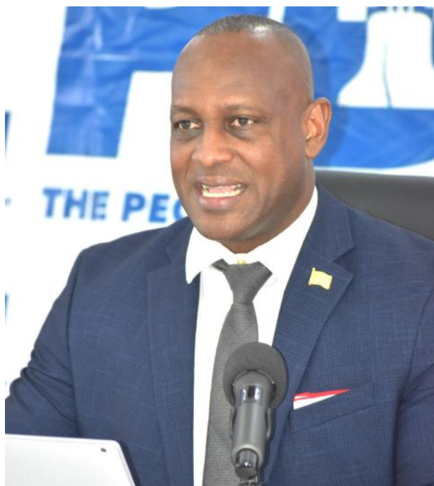
ASTWOOD: The people deserve leaders who prioritize their welfare over political gain.