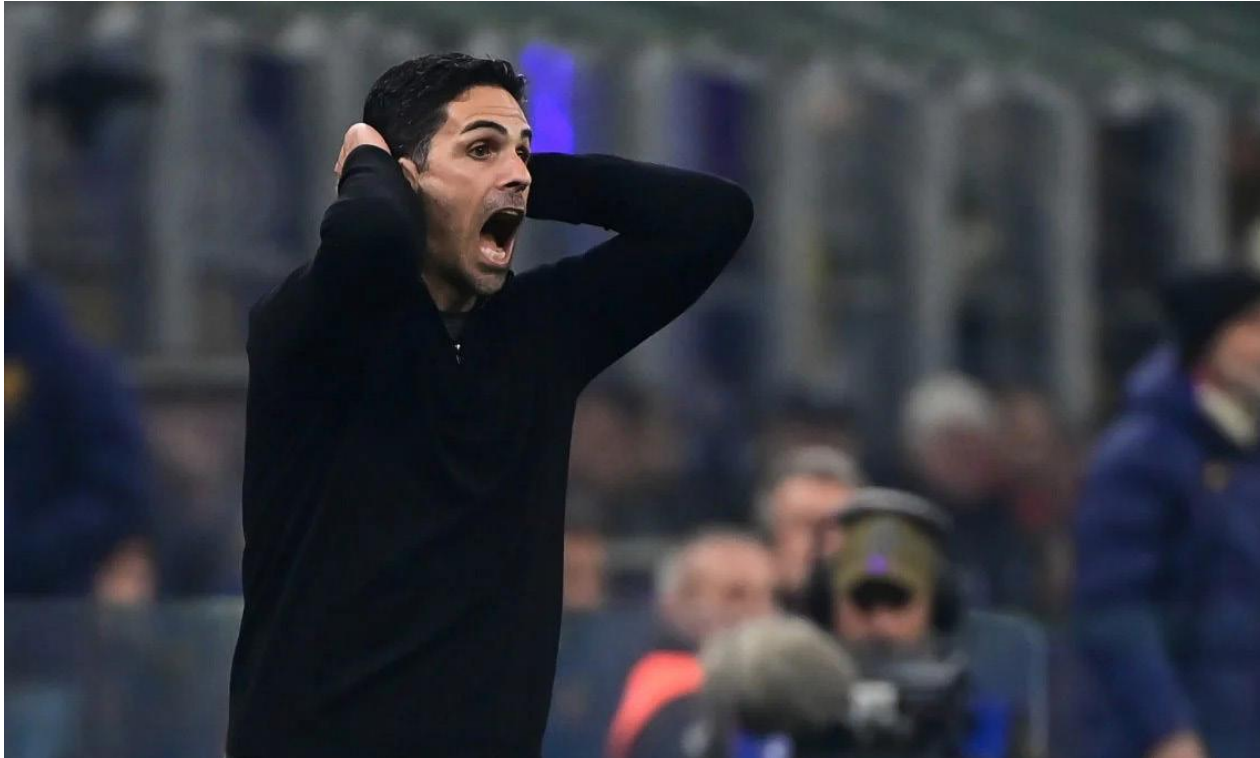
Arsenal's Spanish manager Mikel Arteta looks on during the UEFA Champions League football match between Inter Milan and Arsenal at the San Siro stadium in Milan on November 6, 2024.

Arsenal dominated for large periods against Inter, but were left to rue a controversial penalty in first-half stoppage time when Mikel Merino was adjudged to have handled.