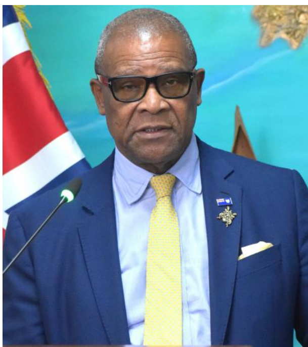
MISSICK: The cost of living over the summer has been brutal.

The opposition People's Democratic Movement (PDM) is challenging the recent decision by Premier Washington Missick's Progressive National Party (PNP) government to distribute a $1,000 relief package to Turks and Caicos Islanders, calling it an election-year deception aimed at securing votes.