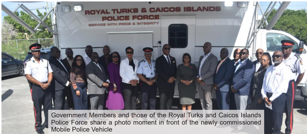
Government Members and those of the Royal Turks and Caicos Islands Police Force share a photo moment in front of the newly commissioned Mobile Police Vehicle

In a significant step toward enhancing community policing and public safety, the Royal Turks and Caicos Islands Police Force (RTCIPF) commissioned a state-of-the-art Mobile Police Station.