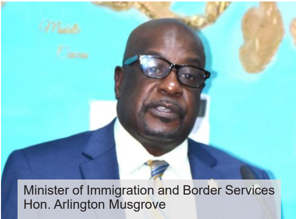
Minister of Immigration and Border Services Hon. Arlington Musgrove

In a decisive move against human trafficking, the Turks and Caicos Islands Border Force, in collaboration with the U.S. Coast Guard, has successfully prosecuted two individuals involved in a significant human smuggling operation.