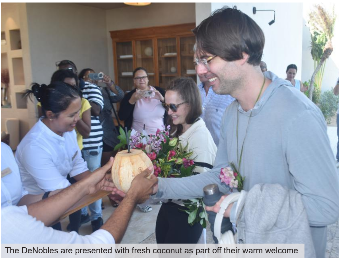
The DeNobles are presented with fresh coconut as part of their warm welcome