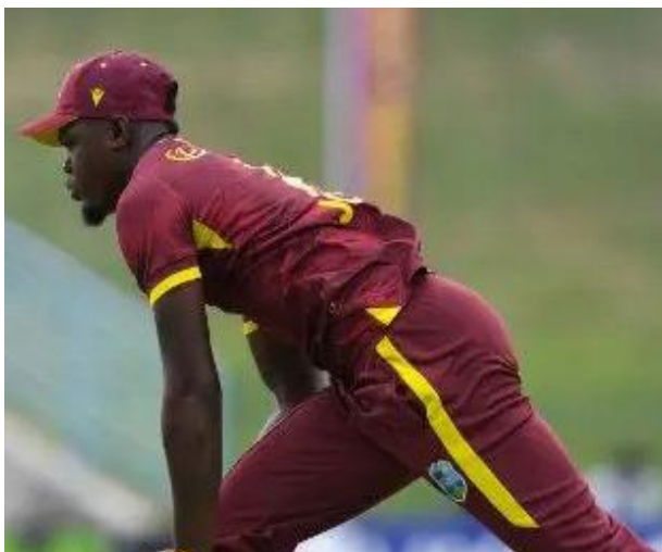
Alzarri Joseph of West Indies takes the catch to dismiss Phil Salt of England during the 1st ODI match between West Indies and England at Vivian Richards Cricket Stadium in North Sound, Antigua and Barbuda, on October 31, 2024.

West Indies fast bowler Alzarri Joseph was hit with a two-match suspension on Thursday after storming off the field during the series-clinching one day international (ODI) win over England.