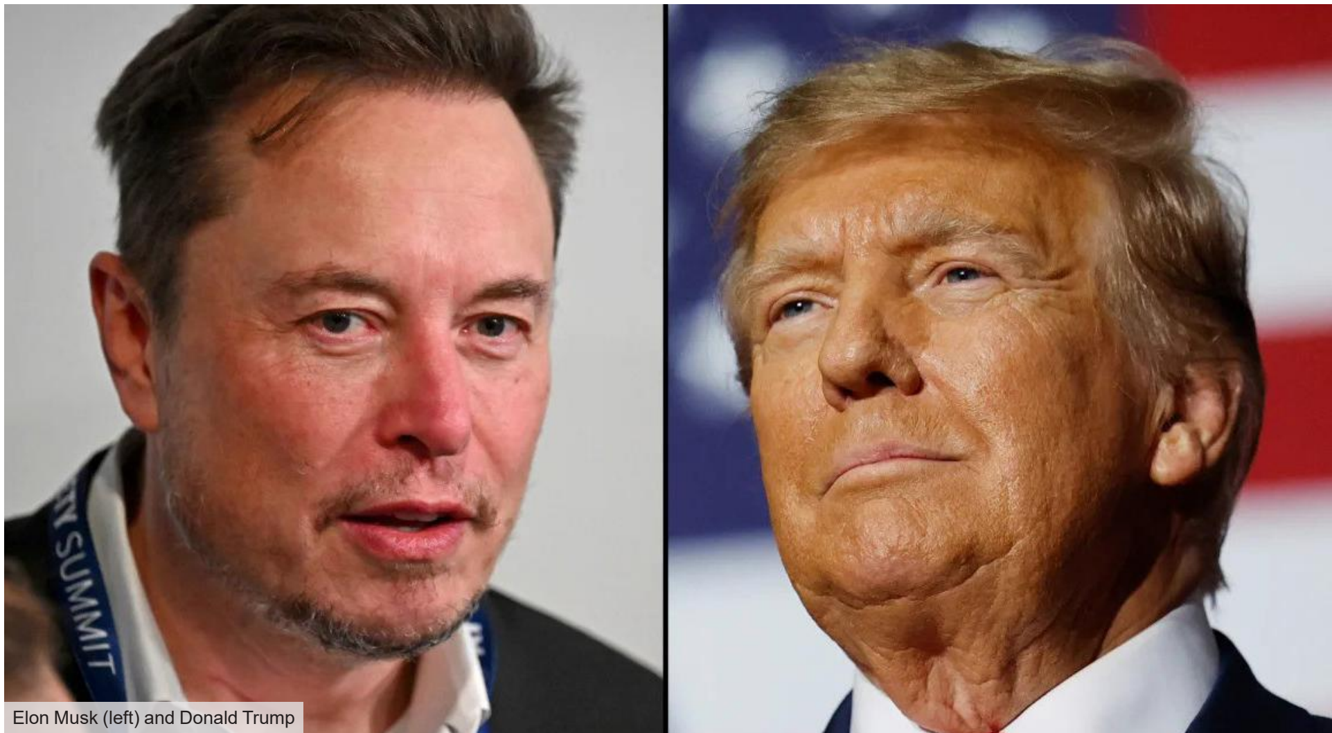
Elon Musk (left) and Donald Trump

No single business leader did more to support former President Donald Trump's candidacy than Elon Musk. But the billionaire and his business empire face both positives and negatives after Trump won back the presidency in Tuesday's election.