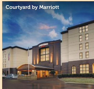
Courtyard by Marriott