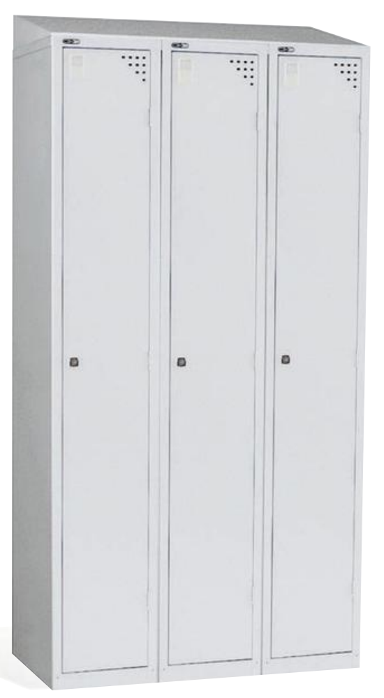
Showing TRIPLE SLOPING TOP