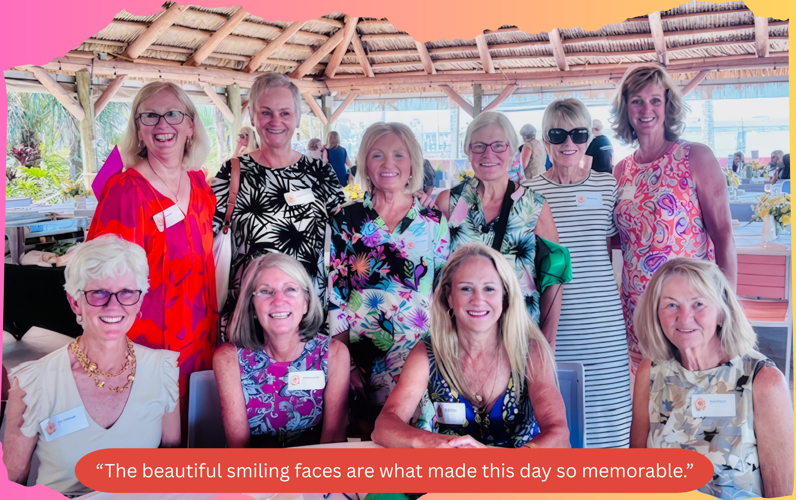
“The beautiful smiling faces are what made this day so memorable.”