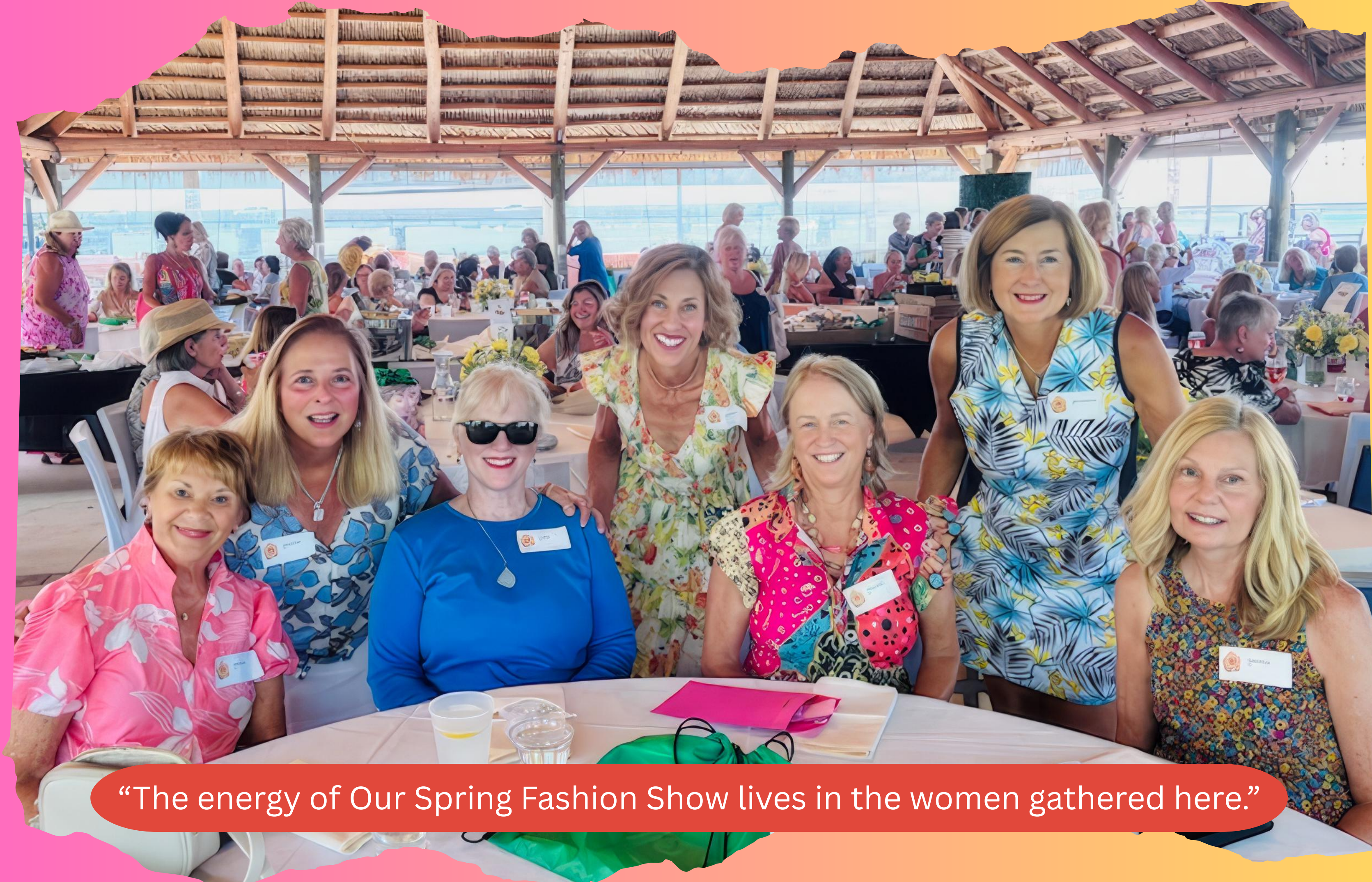
“The energy of Our Spring Fashion Show lives in the women gathered here.”