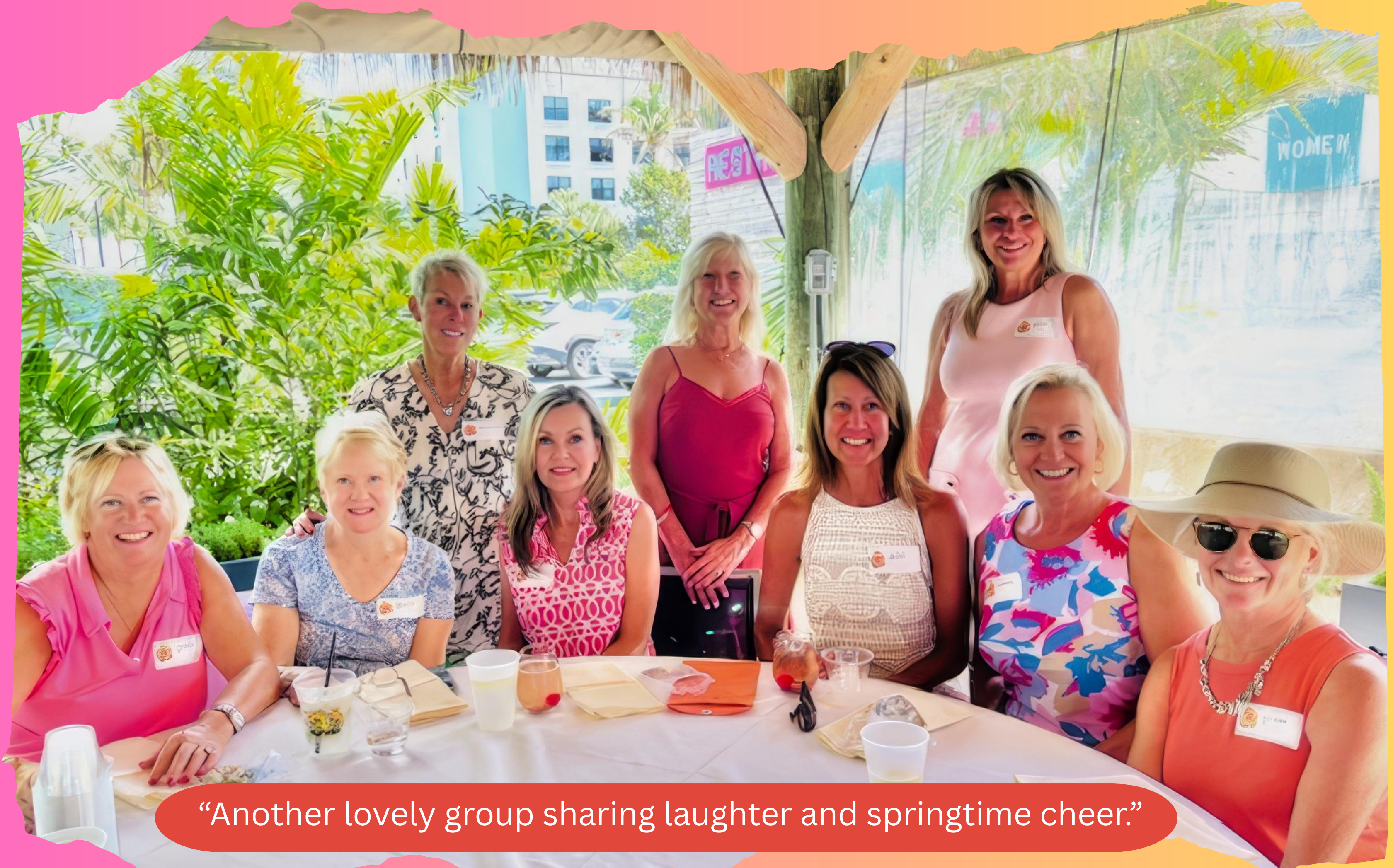
“Another lovely group sharing laughter and springtime cheer.”