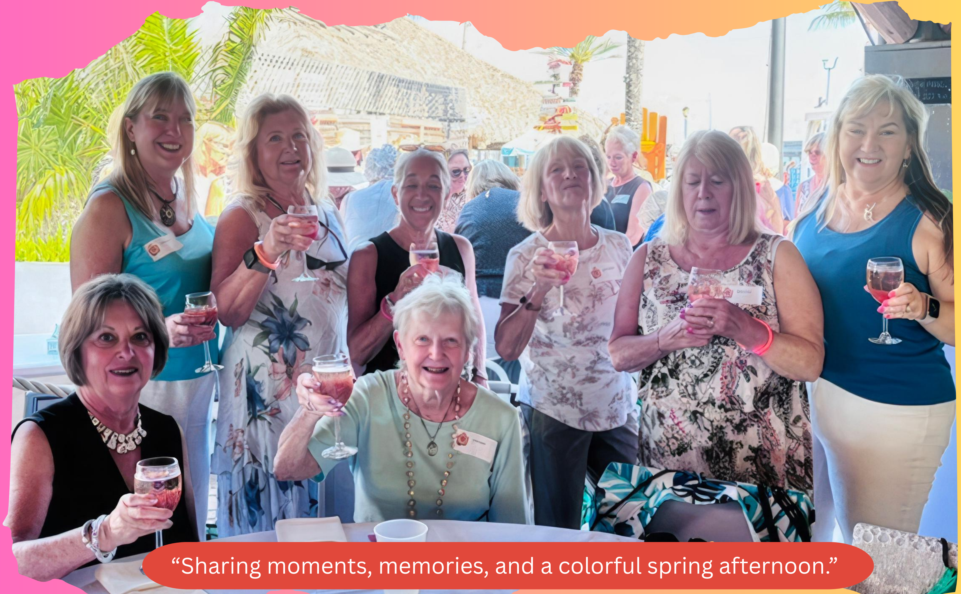
“Sharing moments, memories, and a colorful spring afternoon.”