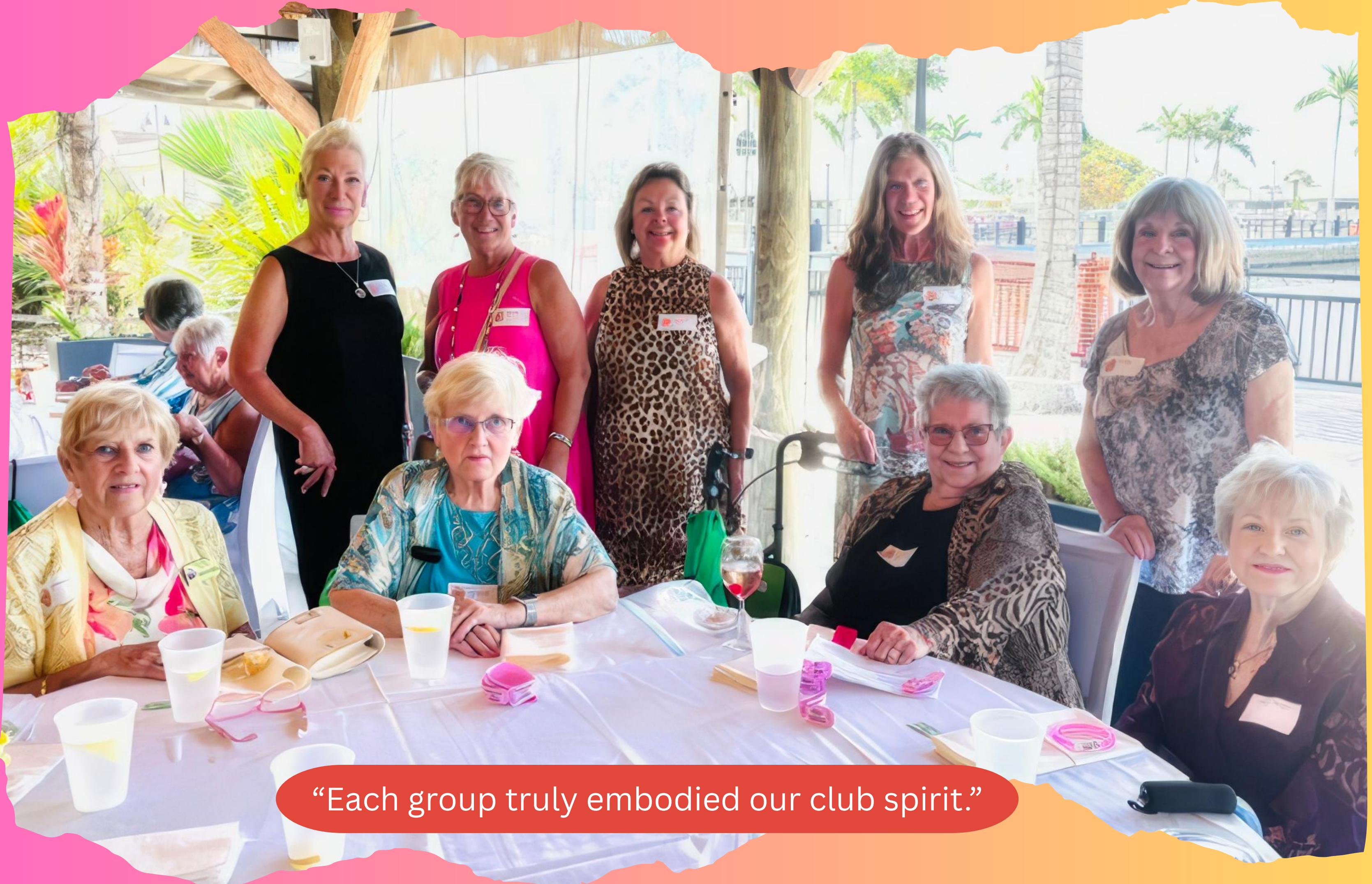
“Each group truly embodied our club spirit.”