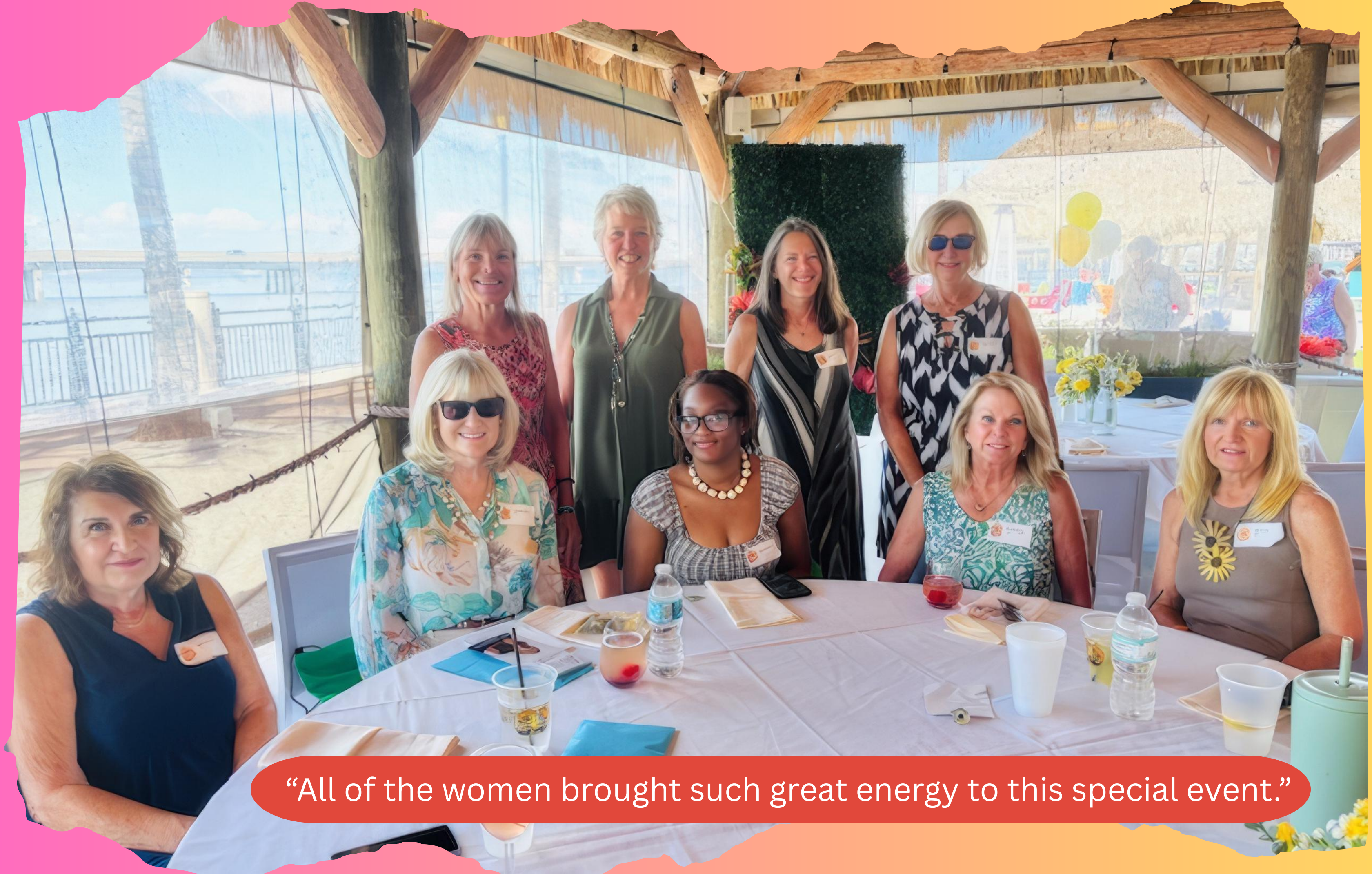
“All of the women brought such great energy to this special event.”