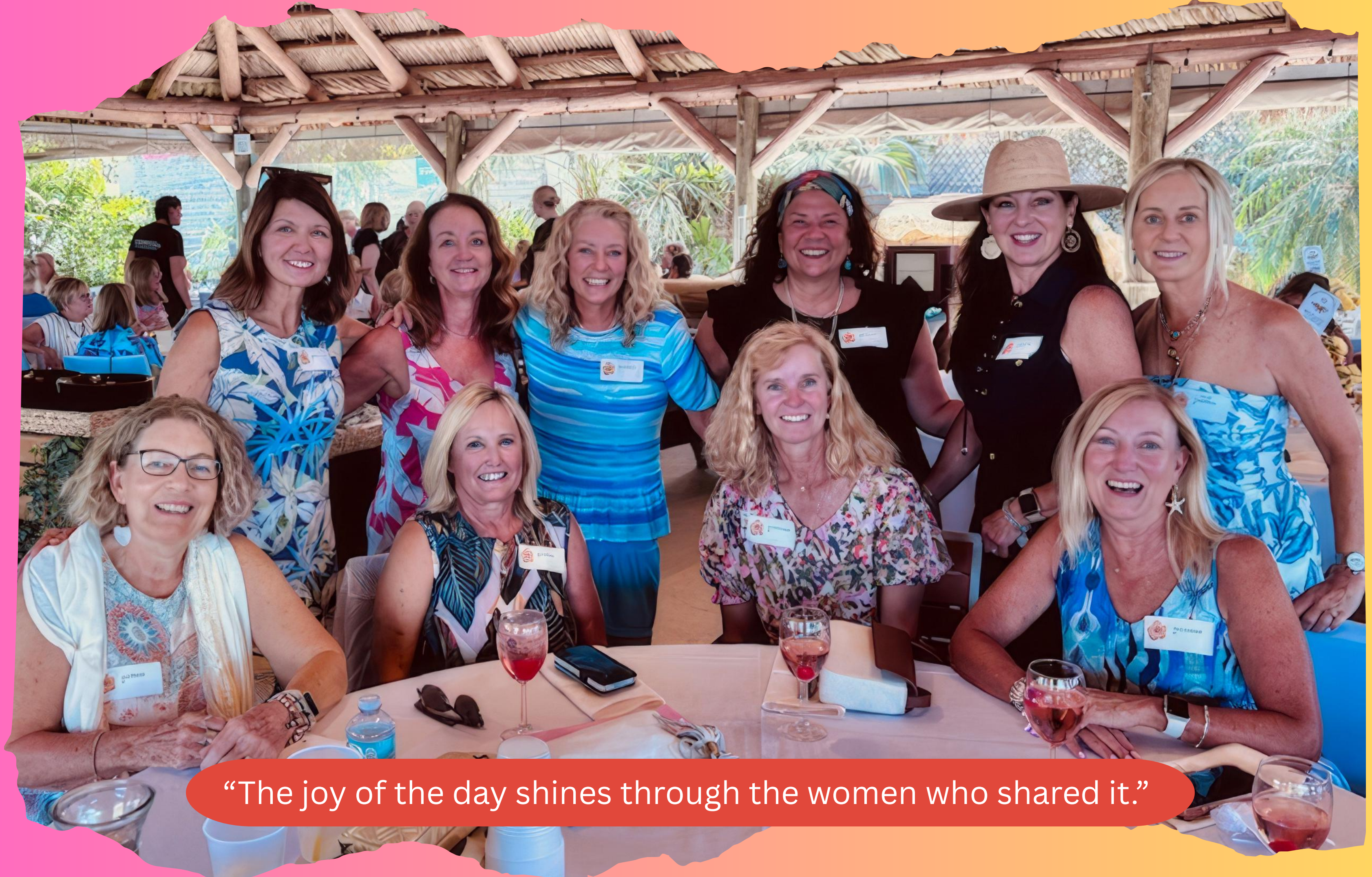
“The joy of the day shines through the women who shared it.”