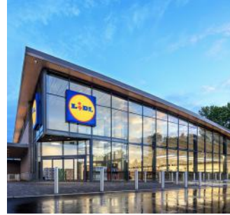
Lidl Various Locations