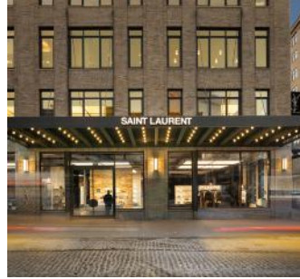
Saint Laurent Various Locations