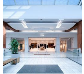
Zara Various Locations