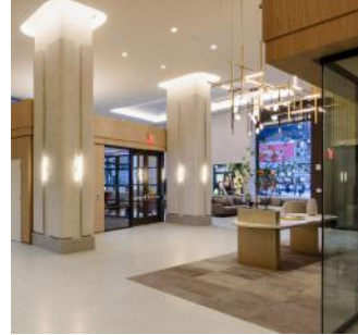
Chase Bank Various Locations