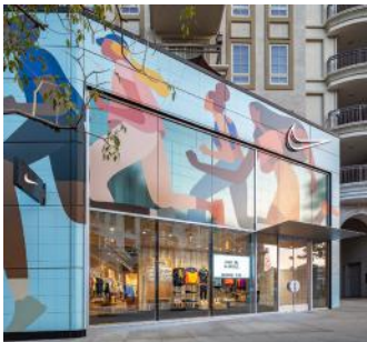
Nike Various Locations