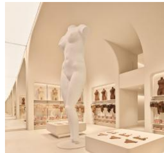
Skims Various Locations