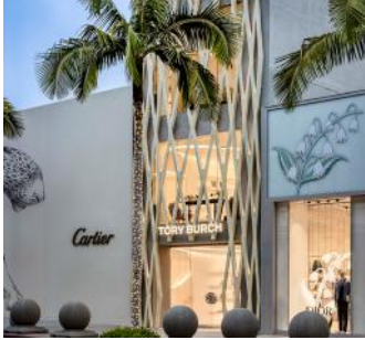
Tory Burch Rodeo Drive Beverly Hills, CA

Schimenti is the preferred builder for the world's largest retailers, Fortune 500 firms, and commercial developers. With 150+ projects annually, we take pride in our relationship-driven approach, delivering value beyond our client's expectations.