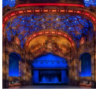
Live Nation Brooklyn, NY