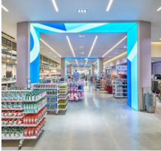
Primark Various Locations