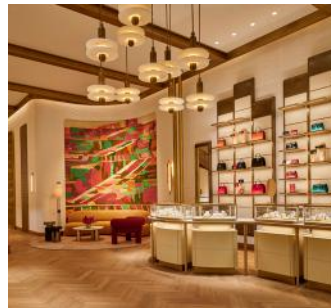
Cartier SoHo New York, NY