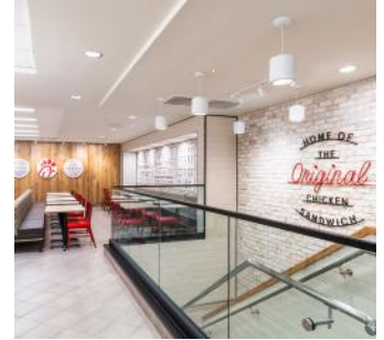
Chick-fil-A Various Locations