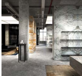
Saint Laurent Various Locations