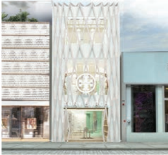
Tory Burch Rodeo Drive Beverly Hills, CA

Schimenti is the preferred builder for the world's largest retailers, Fortune 500 firms, and commercial developers. With 150+ projects annually, we take pride in our relationship-driven approach, delivering value beyond our client's expectations.