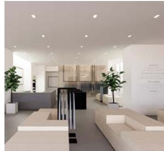
Alo Yoga Various Locations