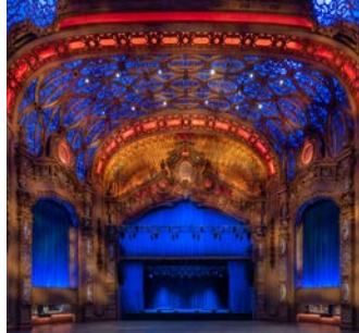
Live Nation Brooklyn, NY