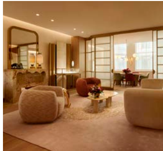
Cartier SoHo New York, NY