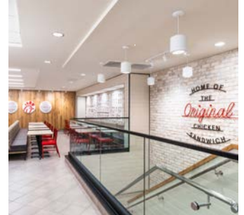
Chick-fil-A Various Locations