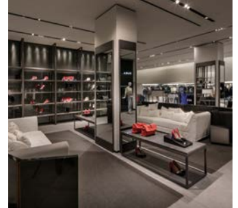
Zara Various Locations