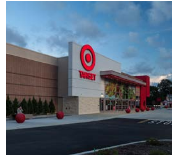
Target Various Locations