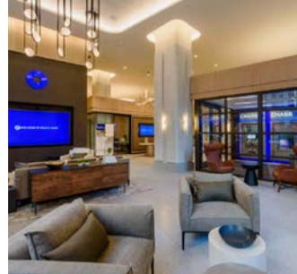
Chase Bank Various Locations