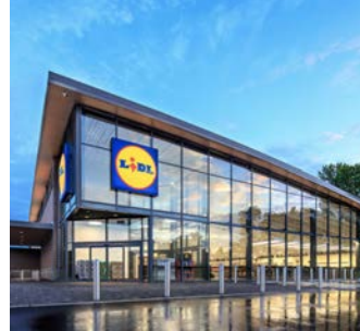
Lidl Various Locations