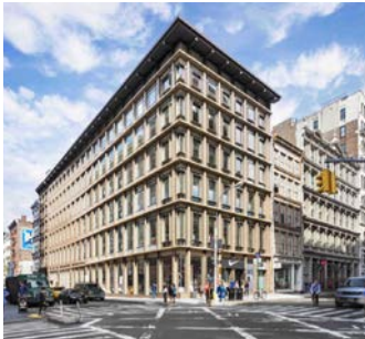
Nike Various Locations