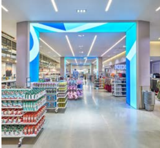
Primark Various Locations