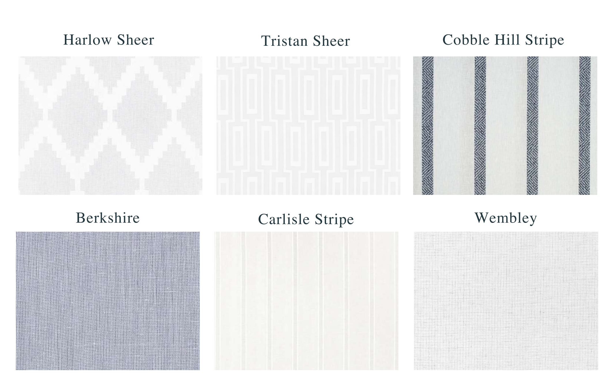
To view all available colorways, visit our website www.ngcmiddleeast.com