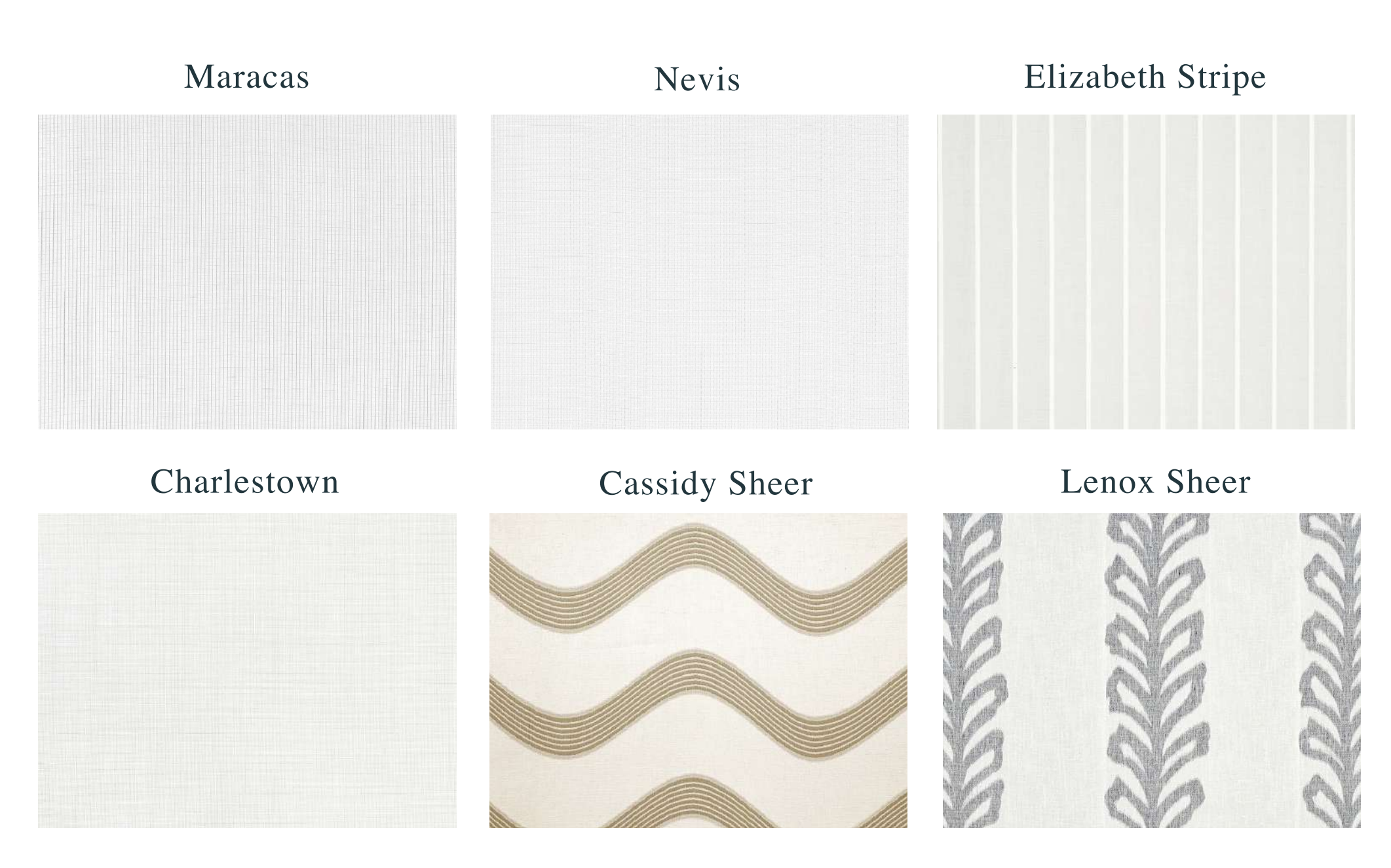
To view all available colorways, visit our website www.ngcmiddleeast.com