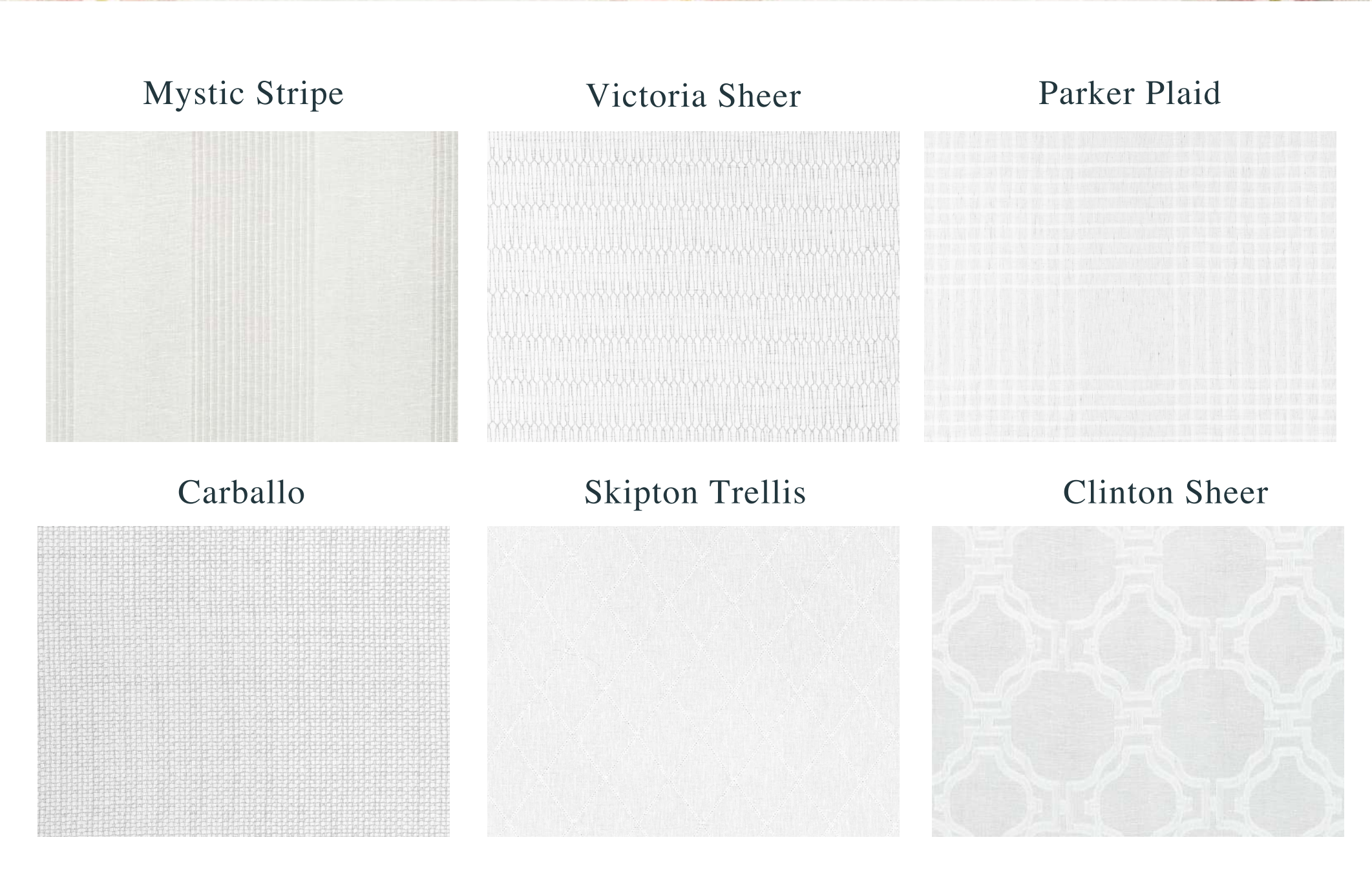
To view all available colorways, visit our website www.ngcmiddleeast.com