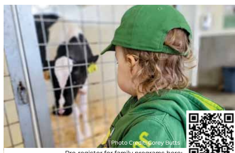
Pre-register for family programs here:

It's time to collect the sap from our maple trees and turn it into delicious maple syrup. We'll learn how this naturally sweet treat is made and awaken our taste buds this sugaring season.