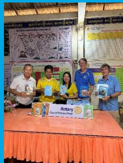
Rong Chak Elementary School