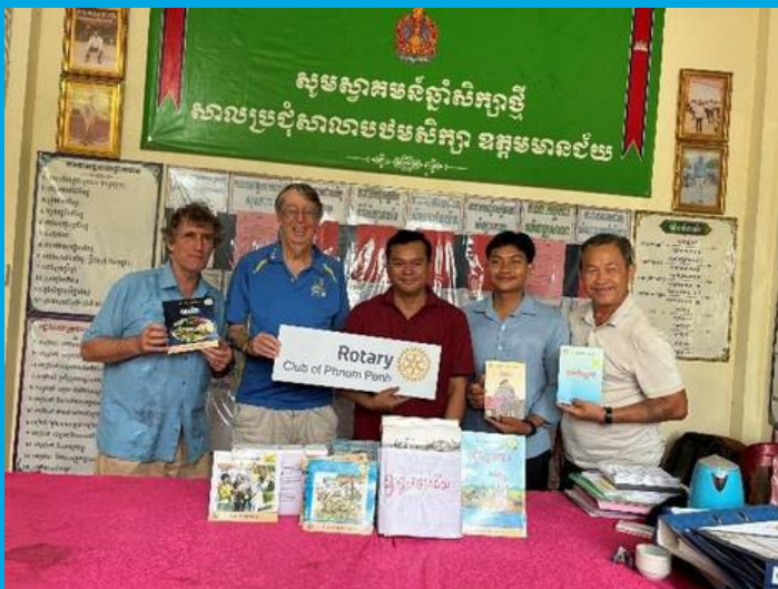
Odom Meanchey Elementary School

. Classroom Library Project ($500): This project provides Khmer-language books for classroom libraries primarily at the elementary school level. We used $500 of the RCSB donation to deliver books to three elementary schools in Kampot in southern Cambodia. I participated in the delivery on March 13. The schools were Odom Meanchey, Rong Chak, and Phnom Sor. The delivery was organized by the NGO Samaki, which works closely with public schools in Kampot - with a special focus on improving reading skills. Samaki has helped the schools develop and use a monitoring system that helps track which students borrow books and when they are returned. It also encourages teachers to make sure all students borrow and hopefully read books. For the donor, it provides assurance that the books are not simply donated and forgotten but actually read.