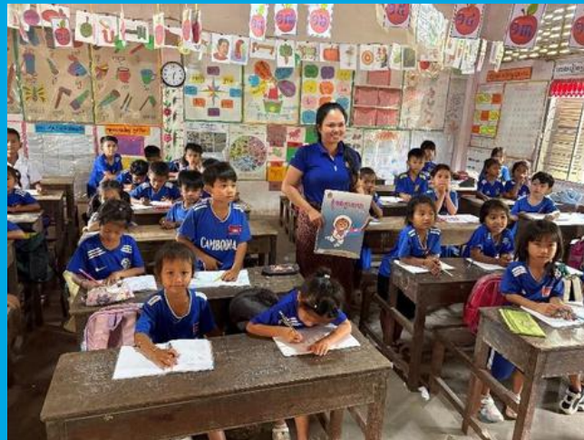
Phnom Sor Elementary School

4. Emergency Relief Deliveries for families displaced by the border conflict ($500). The border conflict with Thailand, which erupted in July and flared again in December, displaced at least 650,000 Cambodians from border areas at its peak. 104,000 were still displaced in February. A major effort has been undertaken in Cambodia to provide assistance to displaced families. One organization active in this effort is Mother's Heart Organization (MHO), which works closely with officials in the impacted regions to identify those in need who have lost access to farmland, local markets, and steady income. RCPP used $500 of the RCSB donation to support MHO's efforts. Our donation enabled MHO to provide an aid package to 10 families and a total of 95 people. Each aid package included rice, canned and dried fish, cooking oil, condiments such as sugar, salt, and fish sauce, and hygiene products including shampoo and laundry detergent. The RCSB donation was greatly appreciated by MHO and the recipient families.