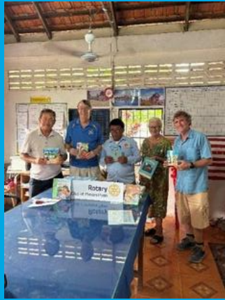
Phnom Sor Elementary School