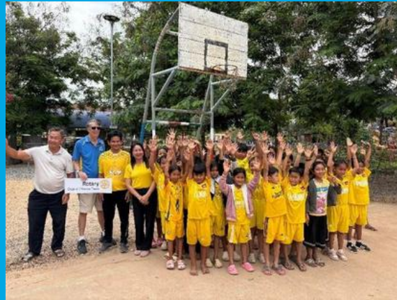
Rong Chak Elementary School