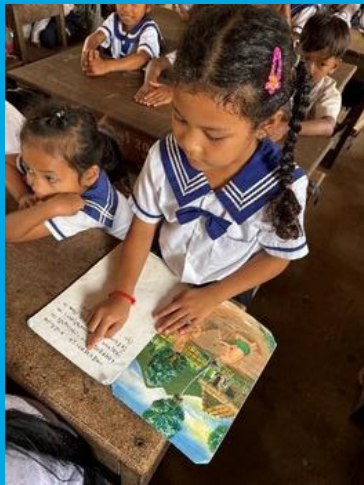
Odom Meanchey Elem School