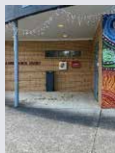
Hesse Rural Health 8 Gosney Street