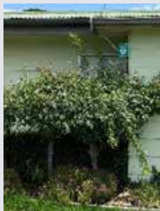
Winchelsea Golf Club 13 Anderson Street