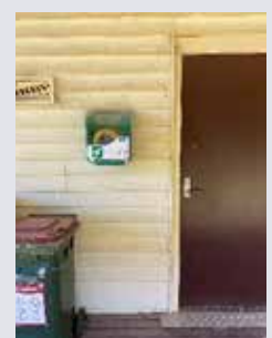
Wurdale Memorial Hall 220 Wurdale Road