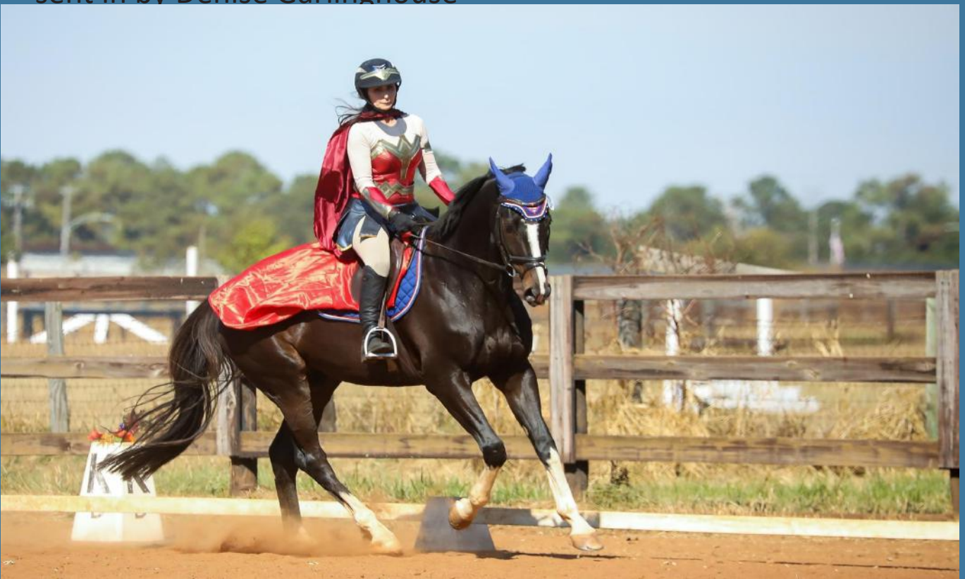
Below: "Super #Lizzard Halloween Dressage". sent in by Denise Garlinghouse