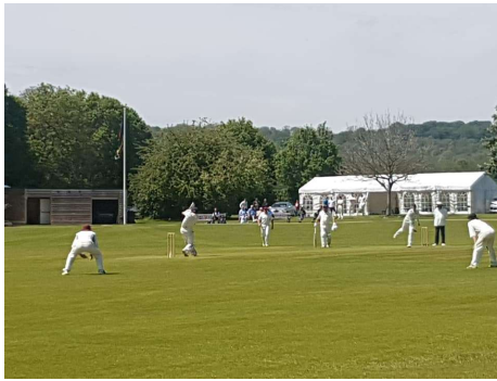
Action at Warnford