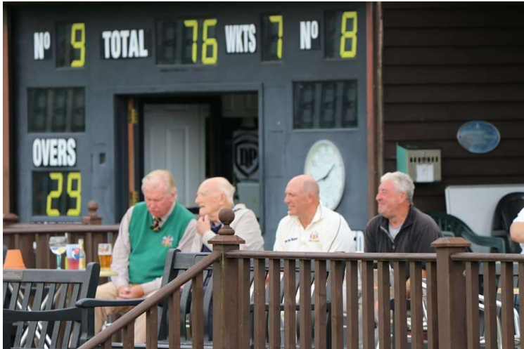
The Pres in a cocoon of concentration!