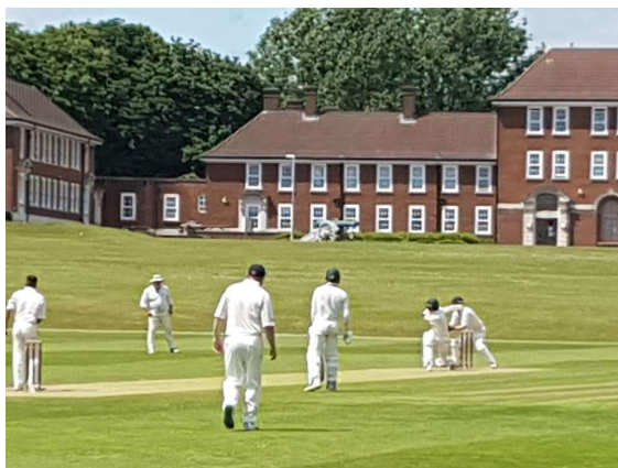
Runs for the Navy at Larkhill, home of the Royal Artillery.