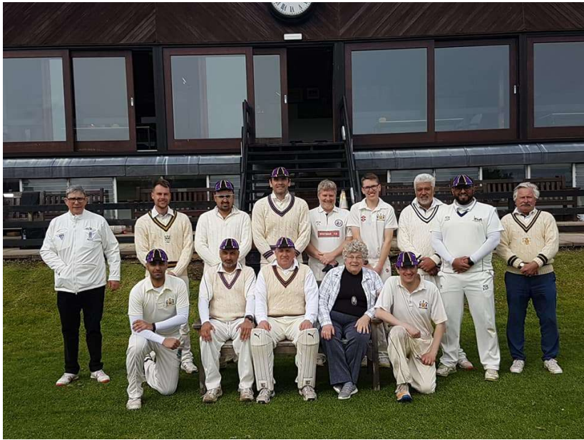
Incogs at Fenners