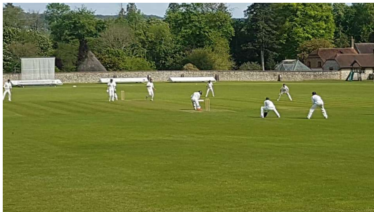
Pleasant surroundings at Grist's for the Tercels match