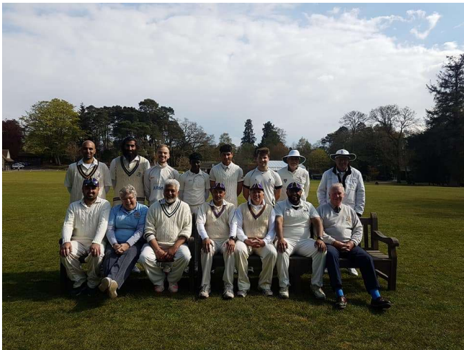
Incogs v. Gemini