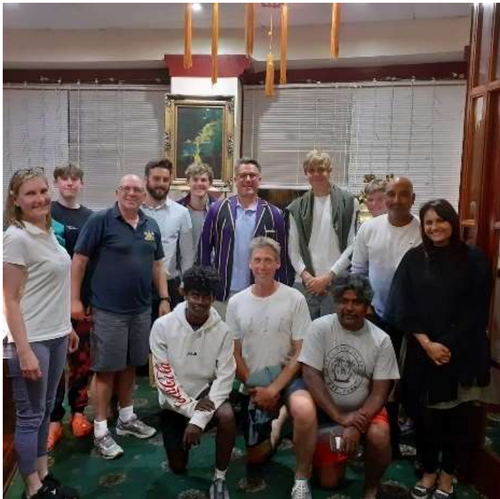
End of tour dinner