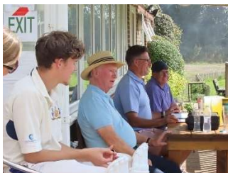
The Pres and his successor!