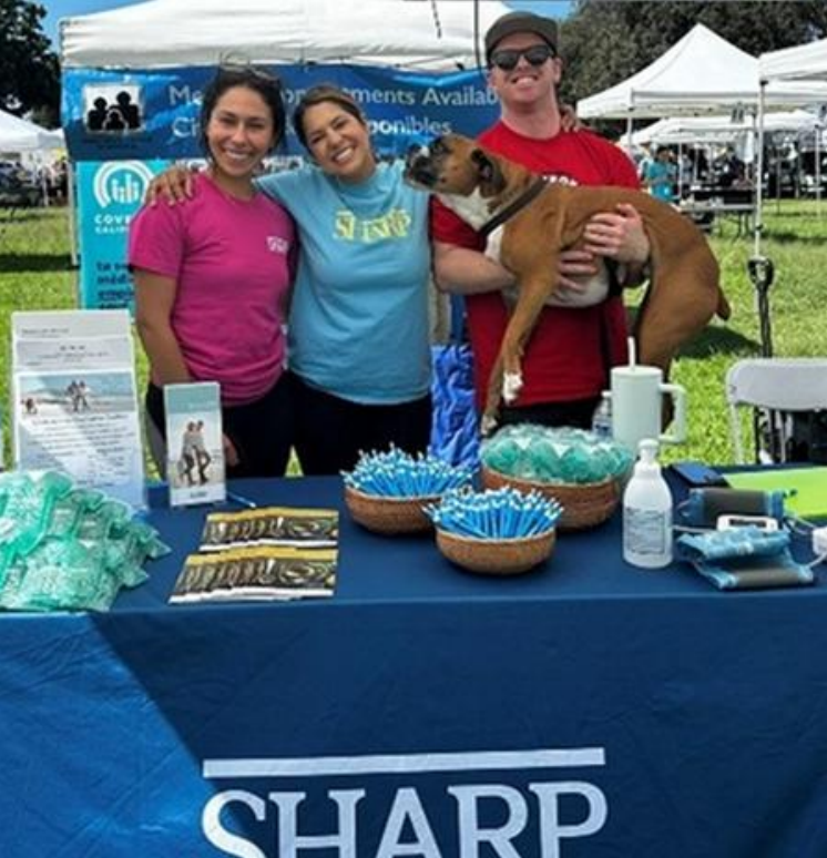
Sharp Coronado physicians and employees offer free health seminars, screenings, vaccinations and more, demonstrating care that extends beyond our hospital walls.