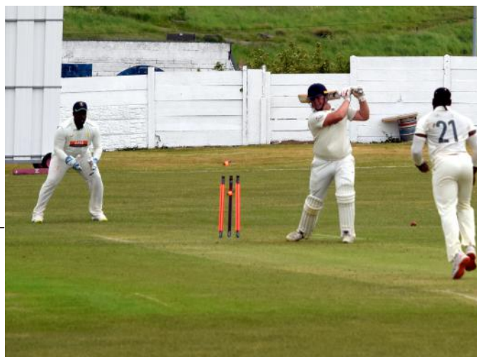
That's out! Division Two action between Frickley and Thorpe Hesley & High Green