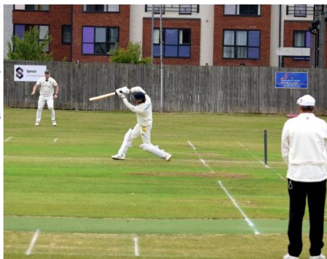
Shot! Division Two action between Frickley and Thorpe Hesley & High Green

Upper Haugh 2nds moved ten points clear of the bottom two when they put Kexborough in to