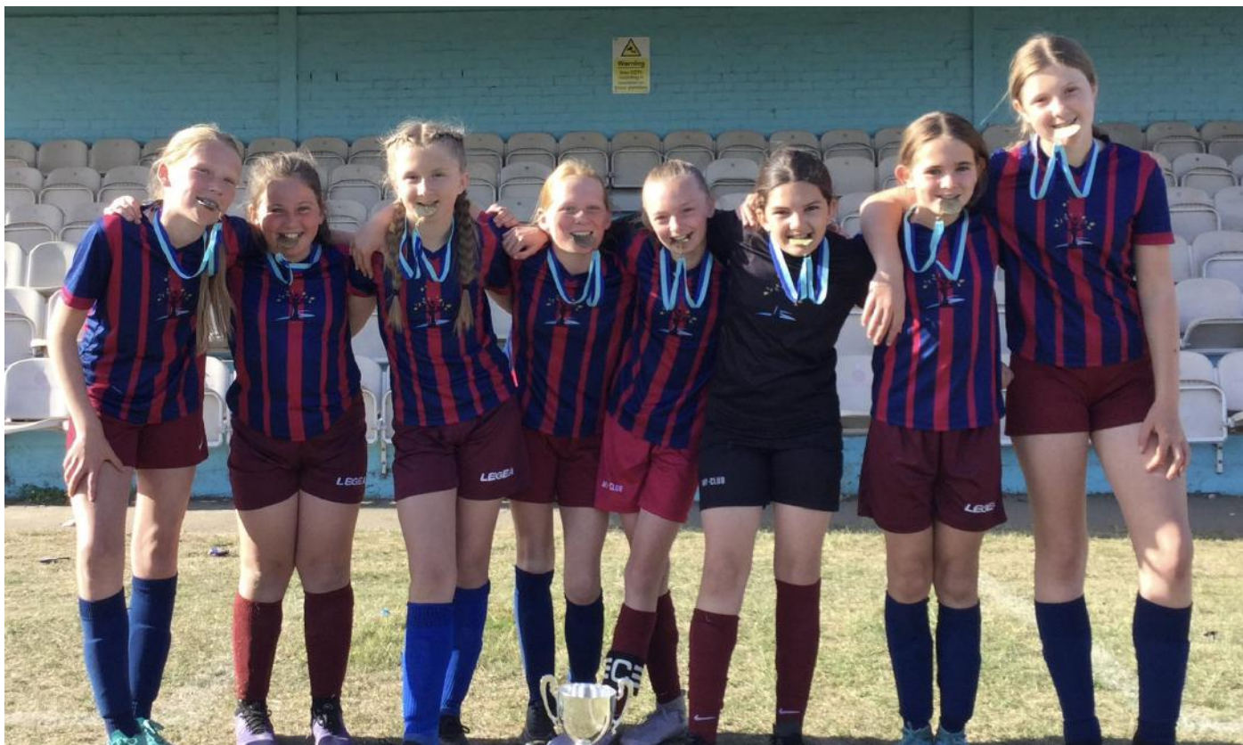
Winners of the Don & Dearne Girls Cup - Carrfield

Wath C of E secured third place, edging out Swinton Fitzwilliam, Thurnscoe Gooseacre, Mexborough Windhill, and Goldthorpe Sacred Heart in a tightly contested league.