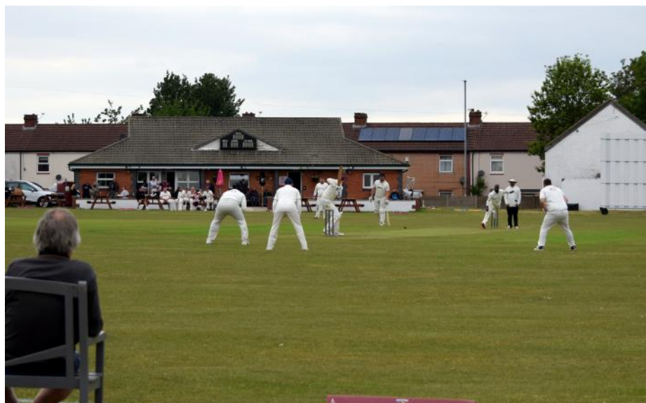
Division Two action between Frickley and Thorpe Hesley & High Green