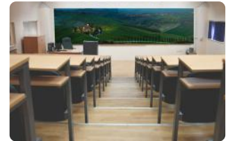
Auditorium & Lecture Hall