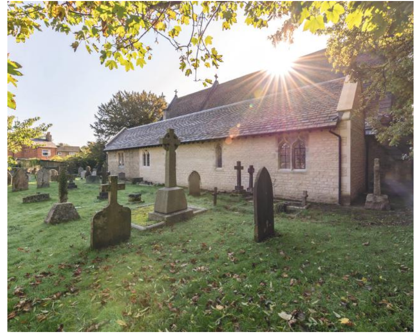
Holy Trinity - Oxford