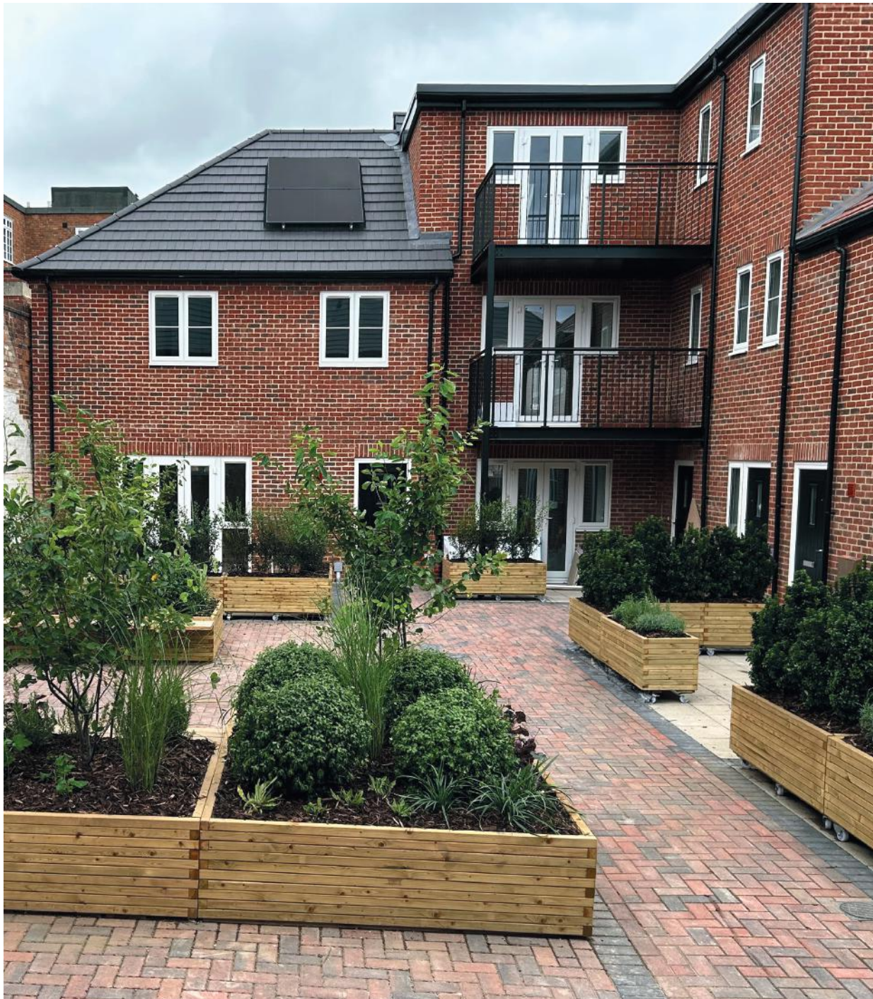
Brewhouse Yard - Wallingford