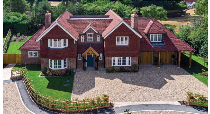
Rotherfield Peppard - Oxfordshire