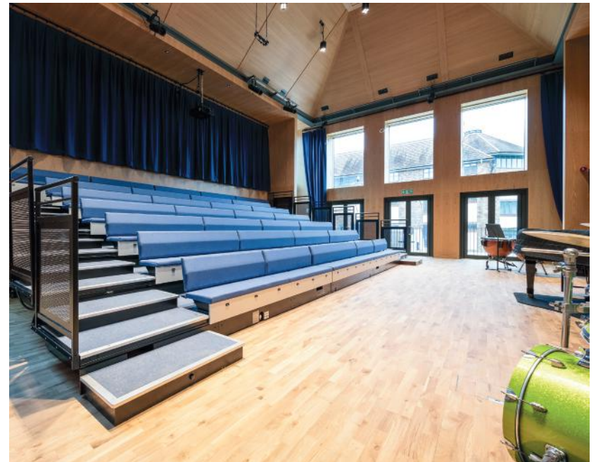
The Dragon School, Music building - Oxford