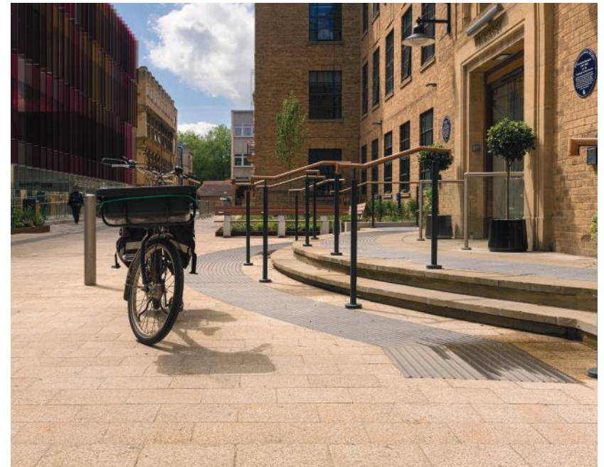
Oxford University Science Landscaping