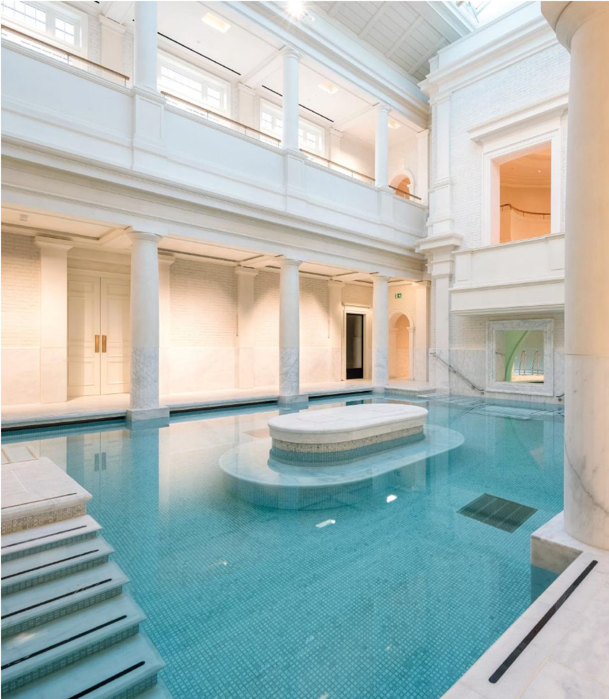
Spa Building - Oxfordshire