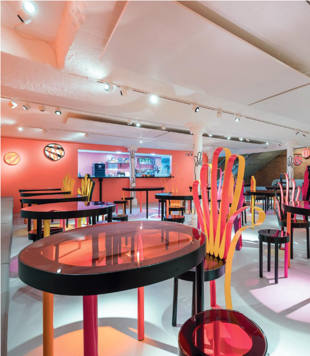
MOMA - Oxford