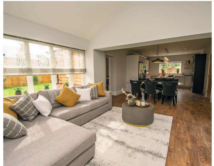
Brightwell-Cum-Sotwell - Oxfordshire