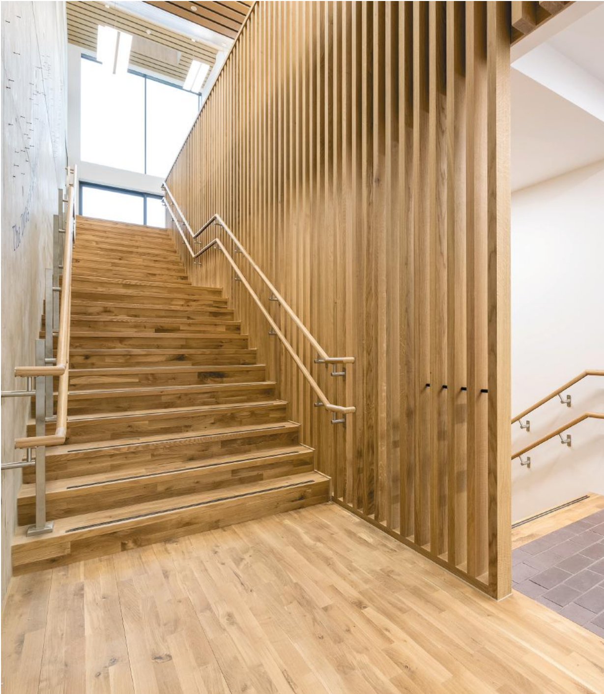
The Dragon School, Music building - Oxford