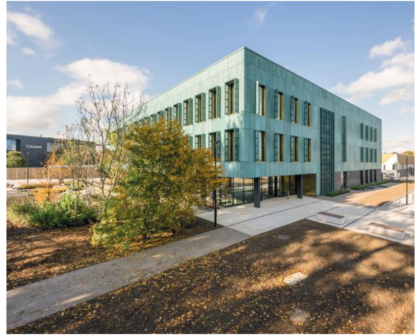
The Helios Building, Harwell - Oxford